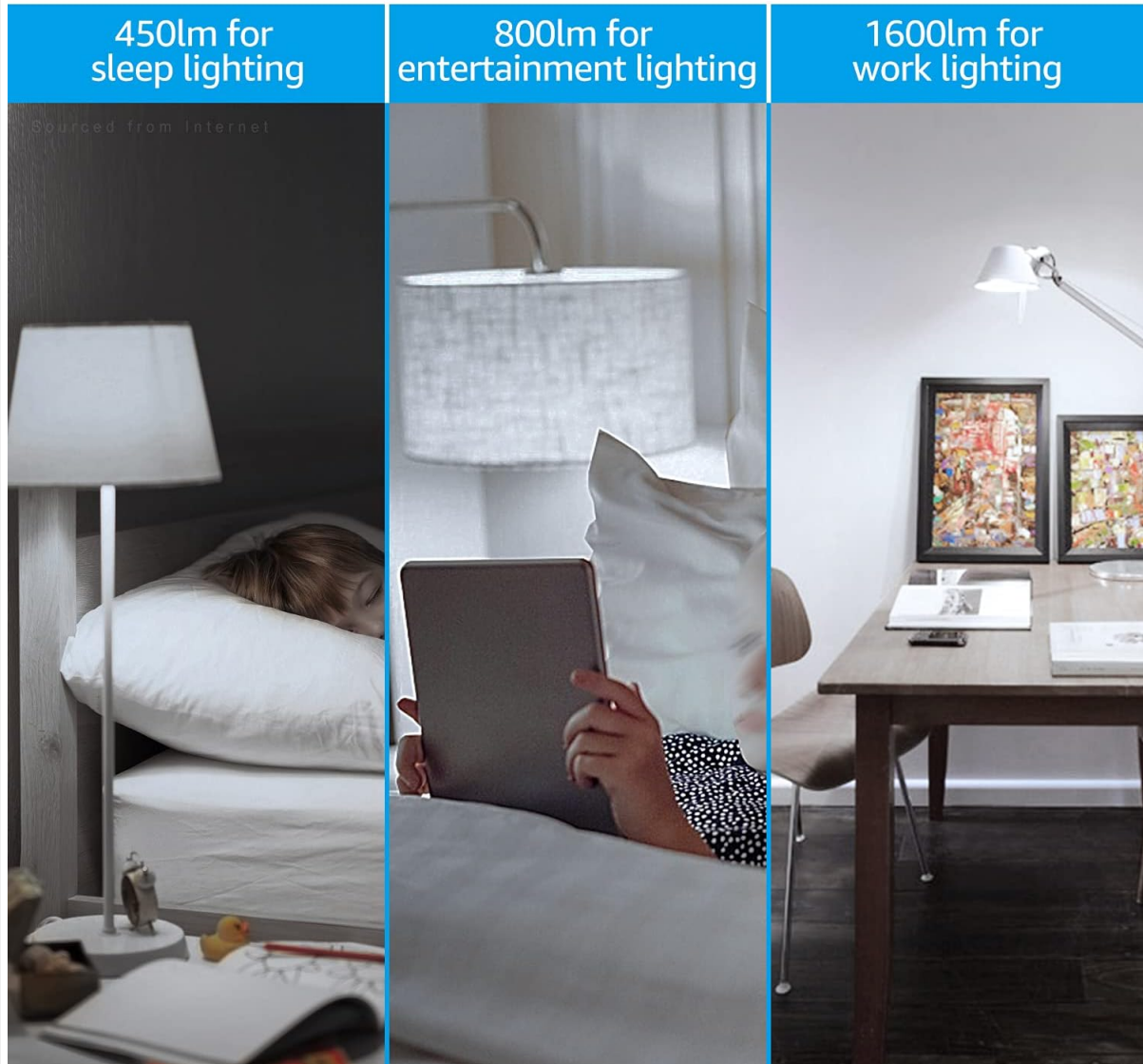
Image: Illustrates how the three brightness levels (450lm, 800lm, 1600lm) can be used for different scenarios such as sleep lighting, entertainment lighting, and work lighting.