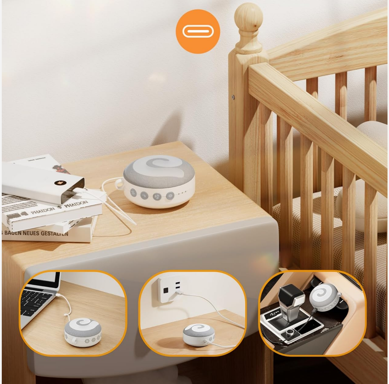
Image: The Dreamegg D11 sound machine connected to a USB-C charging cable, illustrating its rechargeable capability.