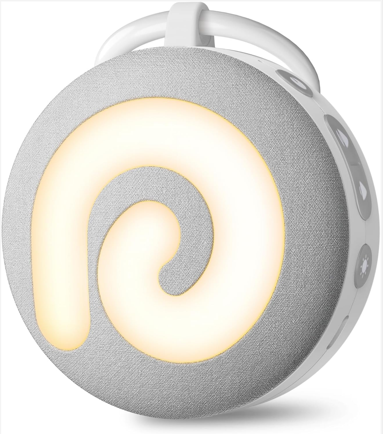
Image: Front view of the Dreamegg D11 Portable White Noise Sound Machine, showing the illuminated spiral night light and speaker grille.