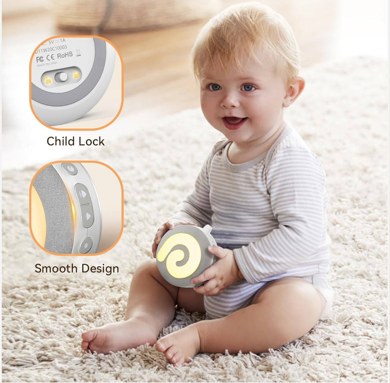
Image: The Dreamegg D11 with its child lock feature, shown with a baby nearby, emphasizing its safety design.