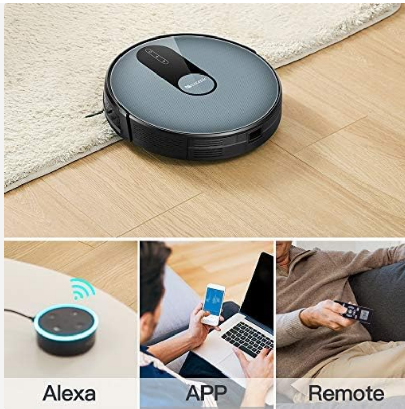
Image: Illustration showing three ways to control the robot vacuum: via an Alexa smart speaker, a mobile application on a smartphone, and a physical remote control.