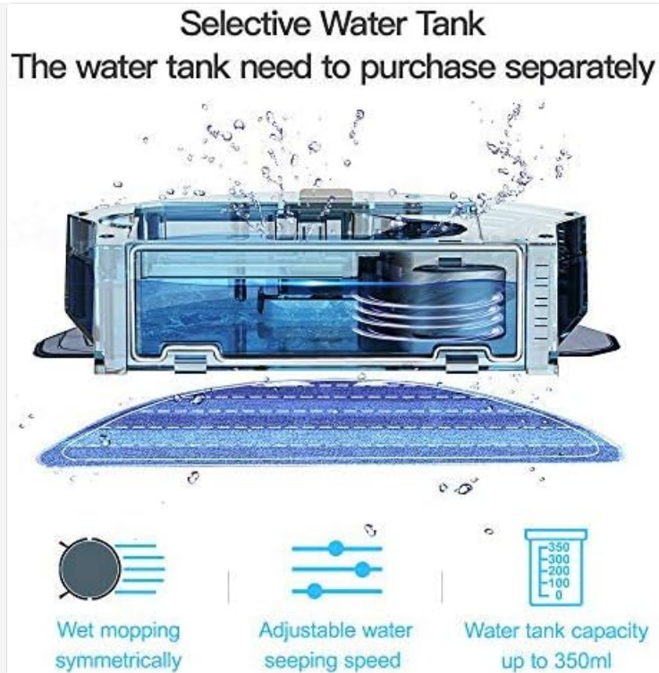
Image: A transparent diagram illustrating the internal components of the selective water tank, showing water levels and the mopping pad. Text highlights features like "Wet mopping symmetrically," "Adjustable water seeping speed," and "Water tank capacity up to 350ml."