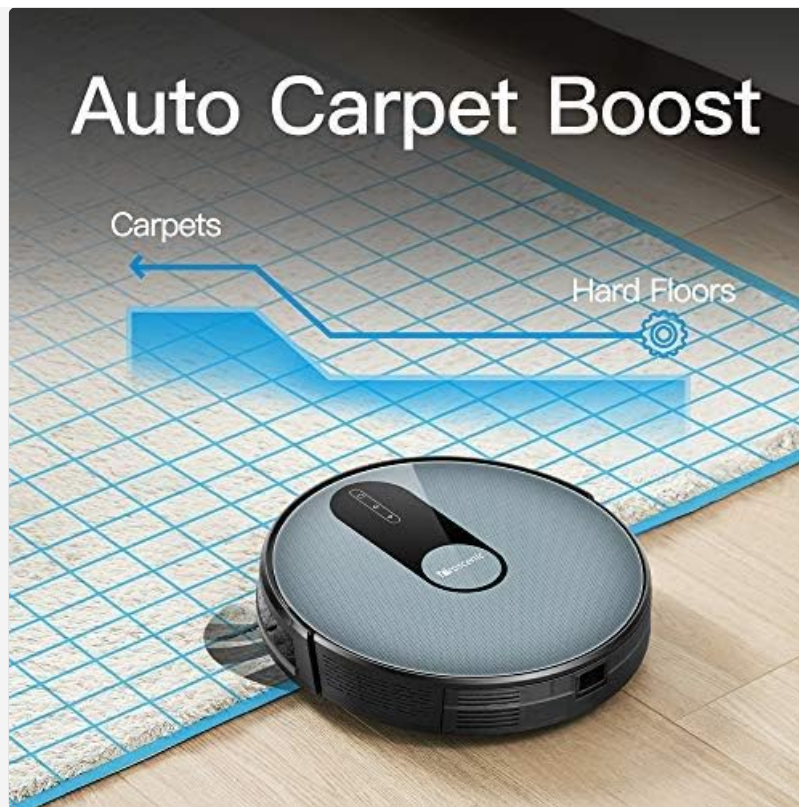
Image: The robot vacuum cleaner is depicted moving from a hard floor onto a carpet, illustrating the "Auto Carpet Boost" feature. A blue arrow indicates the transition from hard floors to carpets.