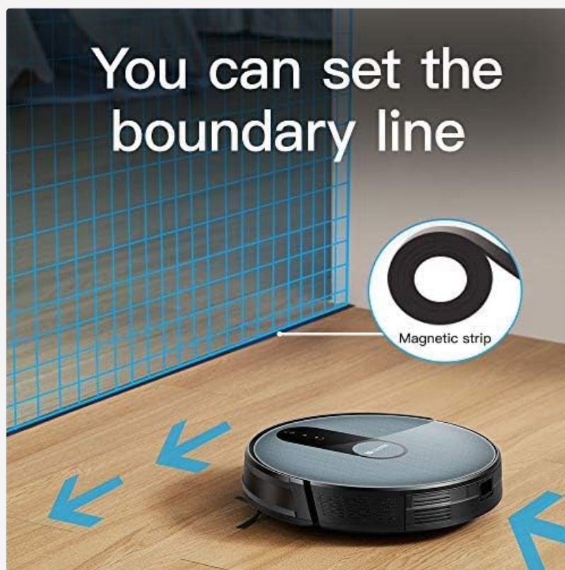
Image: The robot vacuum cleaner is shown on a wooden floor, with blue arrows indicating its movement away from a magnetic boundary strip placed on the floor, demonstrating how boundaries can be set.