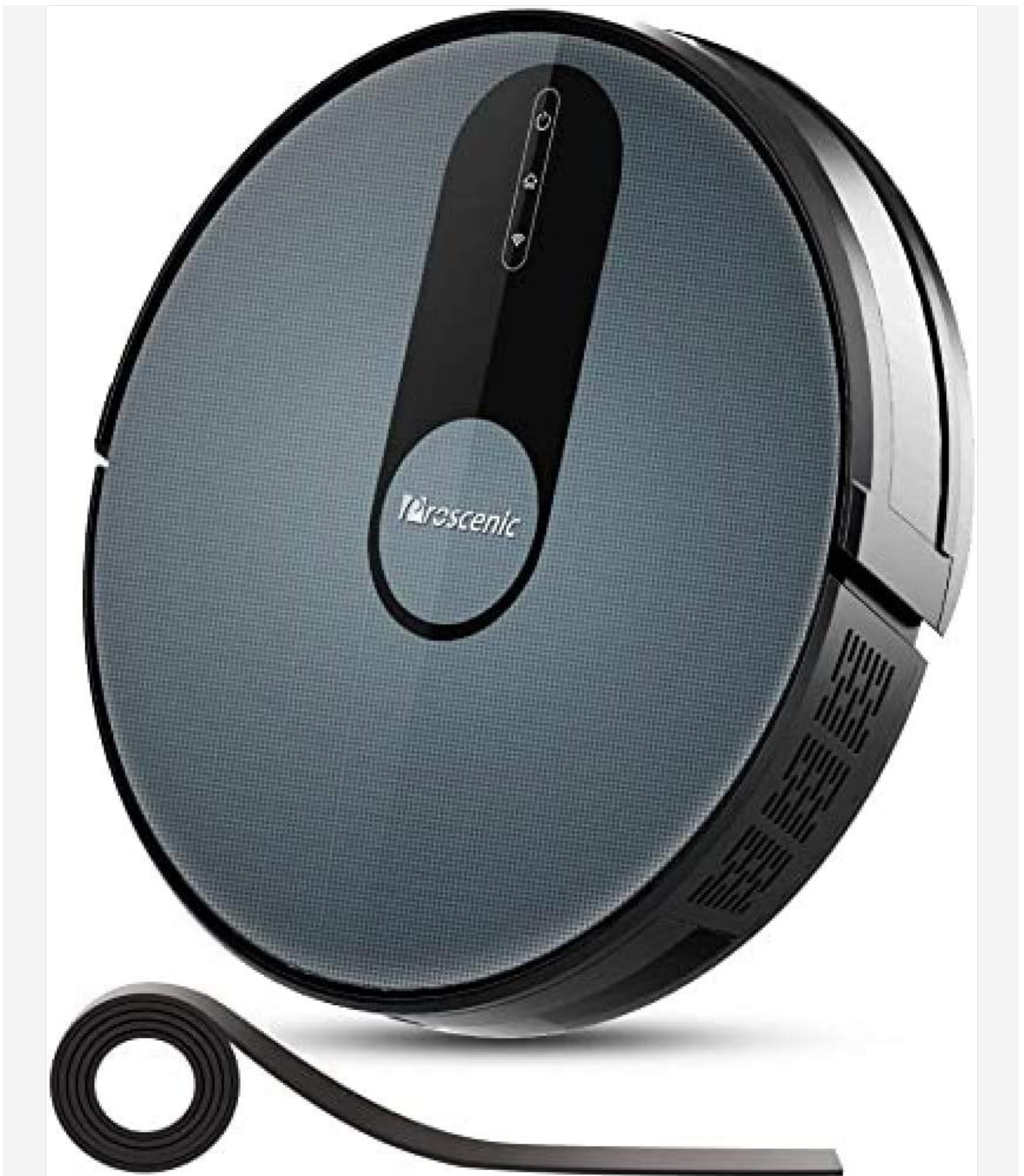
Image: The Proscenic 820S Robot Vacuum Cleaner, a round, dark grey and black device, shown with a magnetic boundary strip.