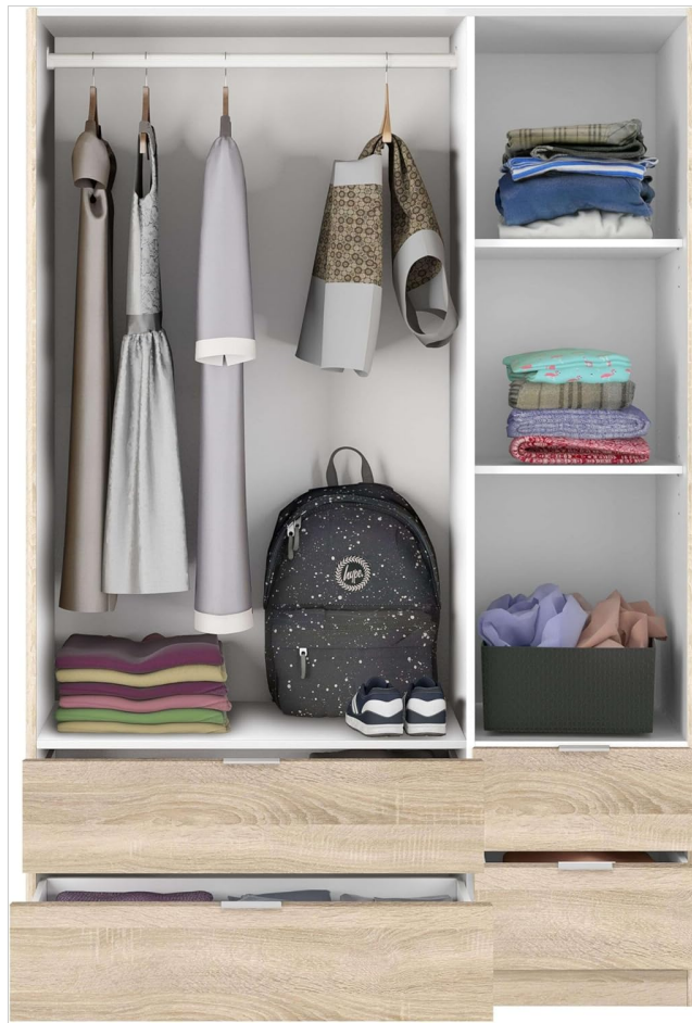
Figure 6: Example of wardrobe interior with items stored.