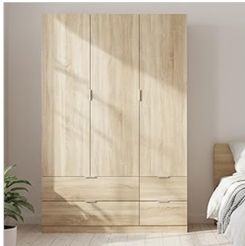
Figure 4: Example of a drawer handle.