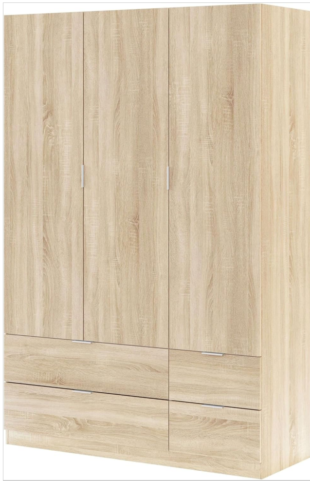
Figure 5: Fully assembled wardrobe.