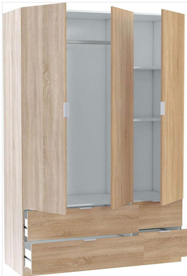
Figure 2: Internal structure of the wardrobe with doors open.