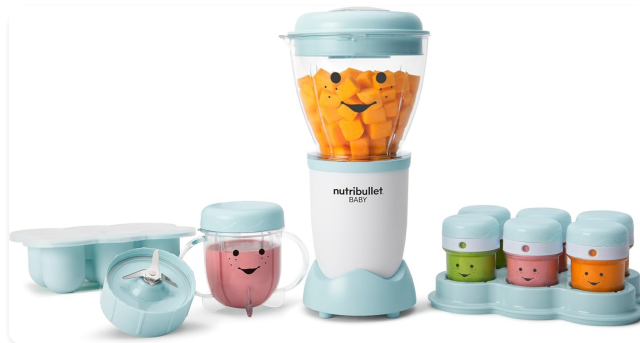
Image: The complete NutriBullet Baby Food-Making System, showcasing the motor base, blending blade, batch bowl, short cup, storage cups with tray, and silicone freezer tray.

The NutriBullet Baby Food-Making System is designed to simplify the process of preparing fresh, wholesome baby food. This comprehensive system provides the essential tools needed to create nutritious meals from scratch quickly and efficiently, allowing for easy preparation, storage, and freezing of baby food.