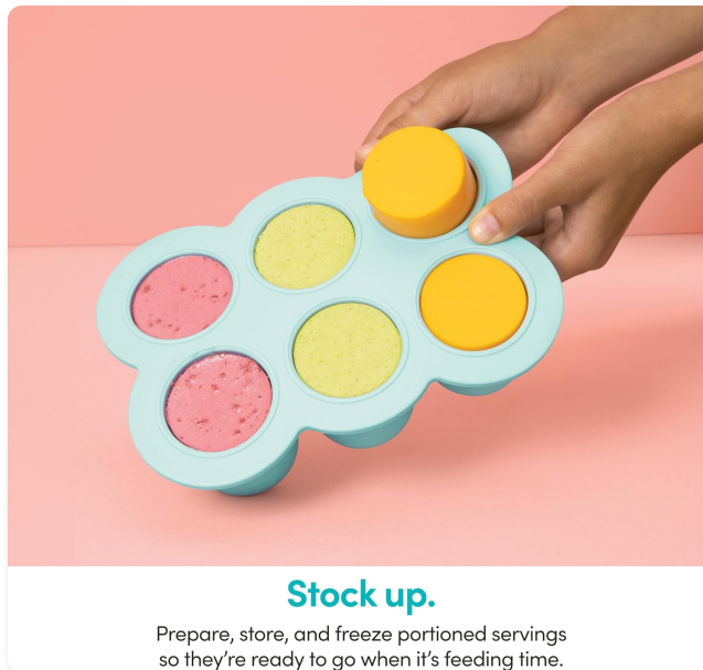
Image: The silicone freezer tray, designed for freezing individual portions of baby food for later use.