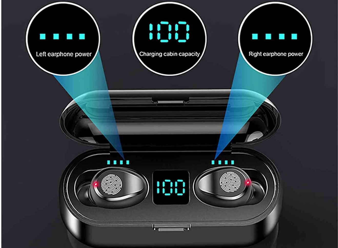
Figure 1.2: A detailed view of the LED display, showing individual battery indicators for each earbud and the charging case's capacity.

Add a new power display screen, charging cabin, earphone power can be seen clearly.