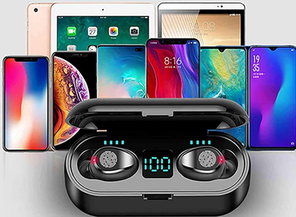
Figure 3.2: The F9 earbuds are compatible with a wide range of Bluetooth-enabled devices, including smartphones and tablets, for multi-platform music support.

High compatibility, as long as Bluetooth can be connected to support multi-platform music