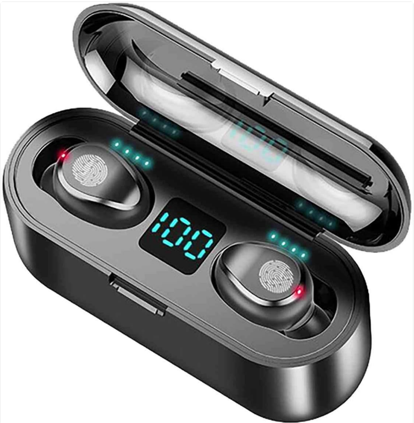
Figure 1.1: The F9 TWS Earbuds inside their charging case, displaying the battery percentage on the LED screen. The earbuds themselves also show small indicator lights.