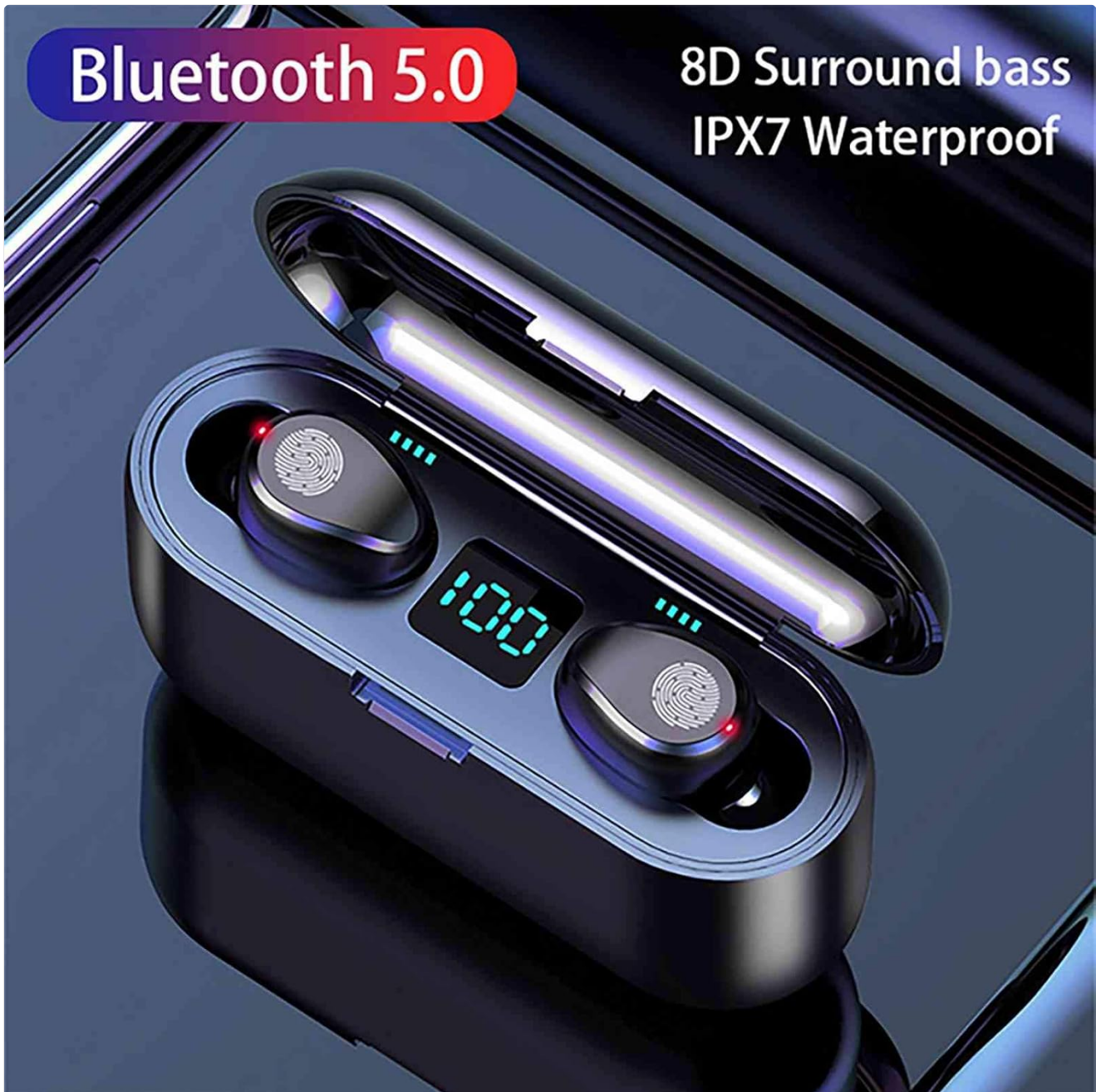
Figure 3.1: The F9 TWS Earbuds in their charging case, highlighting Bluetooth 5.0 connectivity and IPX7 waterproof rating.