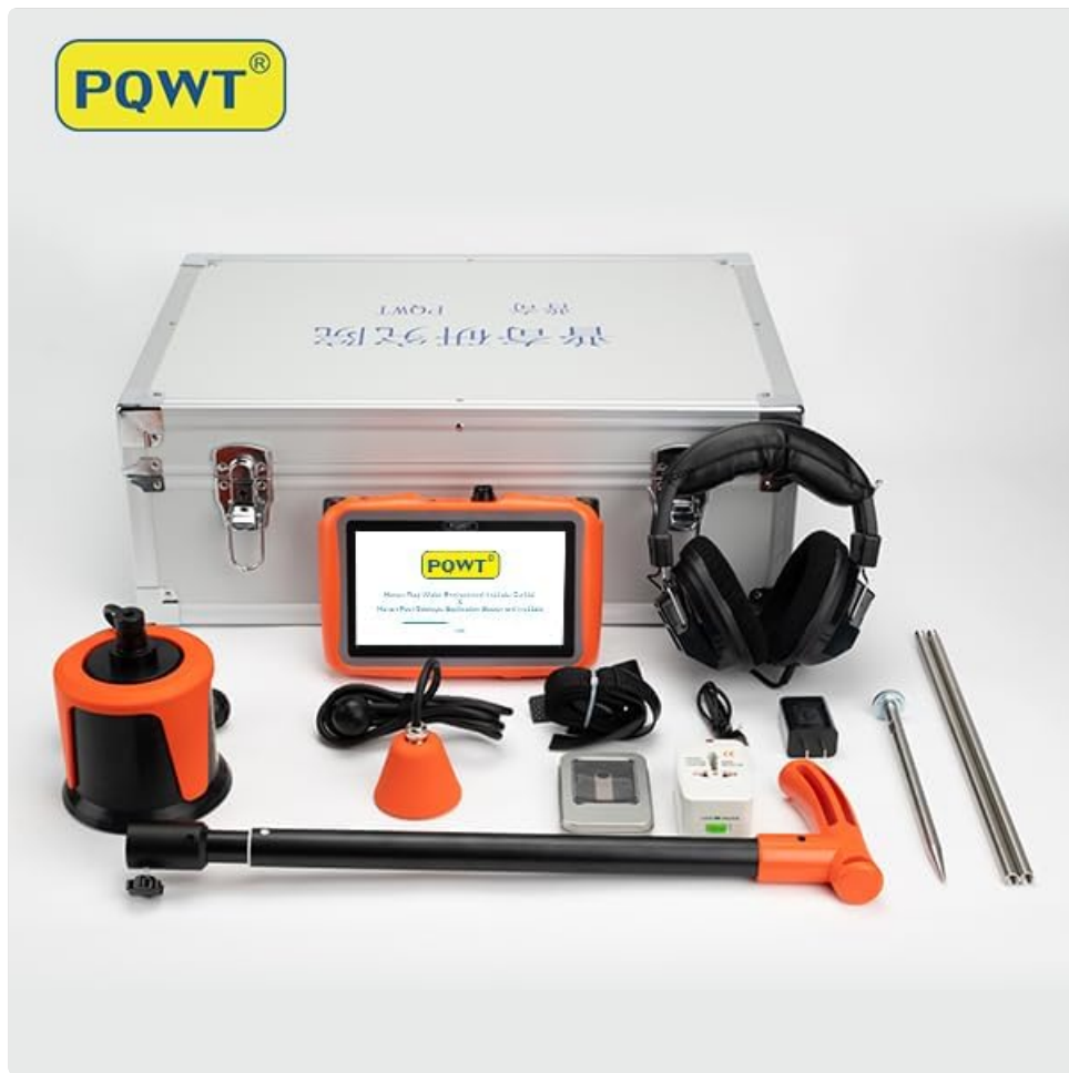
Figure 2.2: Close-up of the PQWT L4000 host machine interface.