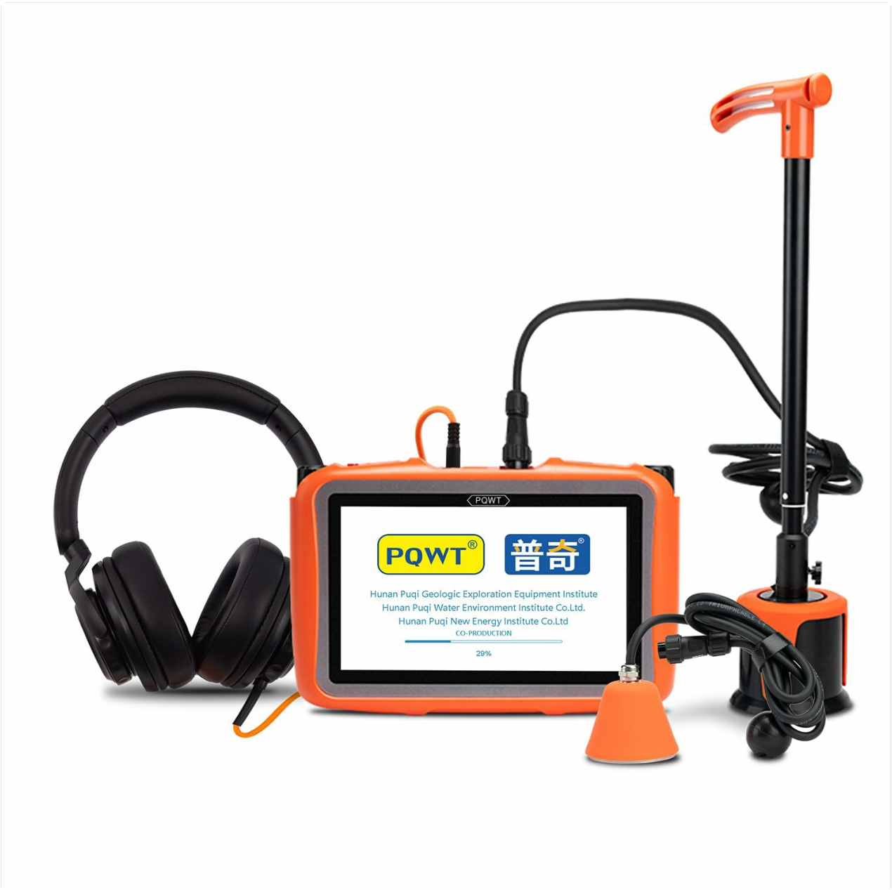
Figure 2.1: Main components of the PQWT L4000 Water Leak Detector.