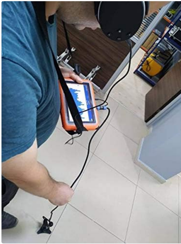
Figure 5.1: Various applications for precise leak positioning.