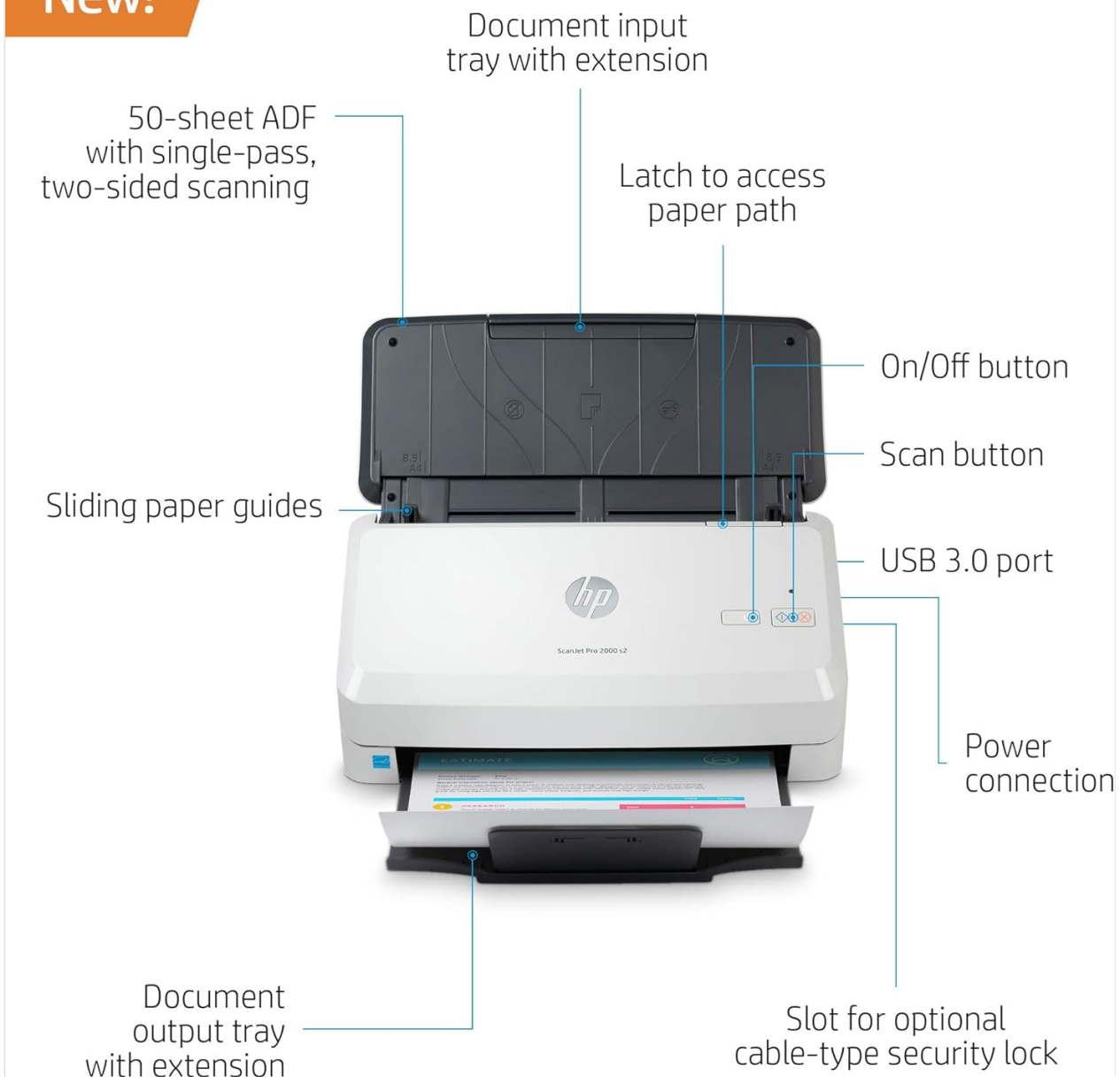
Figure 2.2: Key components of the HP ScanJet Pro 2000 s2, including the document input tray, output tray, control buttons, and ports.