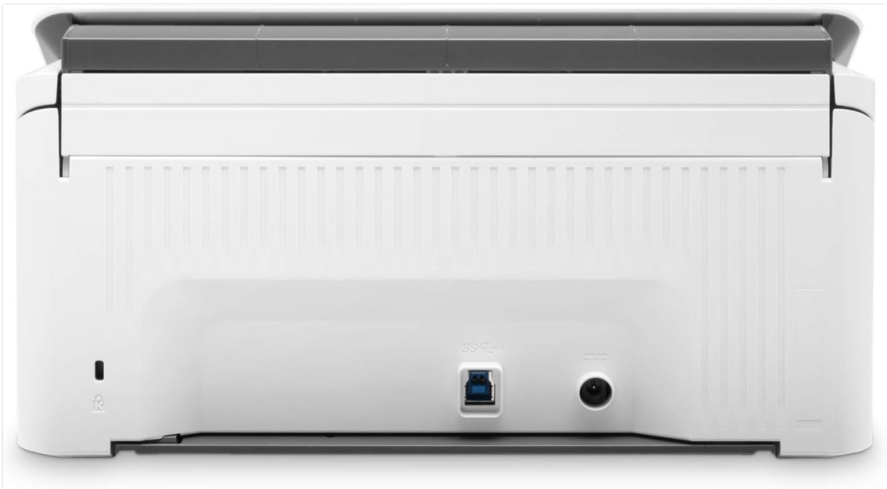
Figure 2.3: Rear view of the scanner, highlighting the USB 3.0 port and power input.

The rear of the scanner houses the primary connectivity ports: