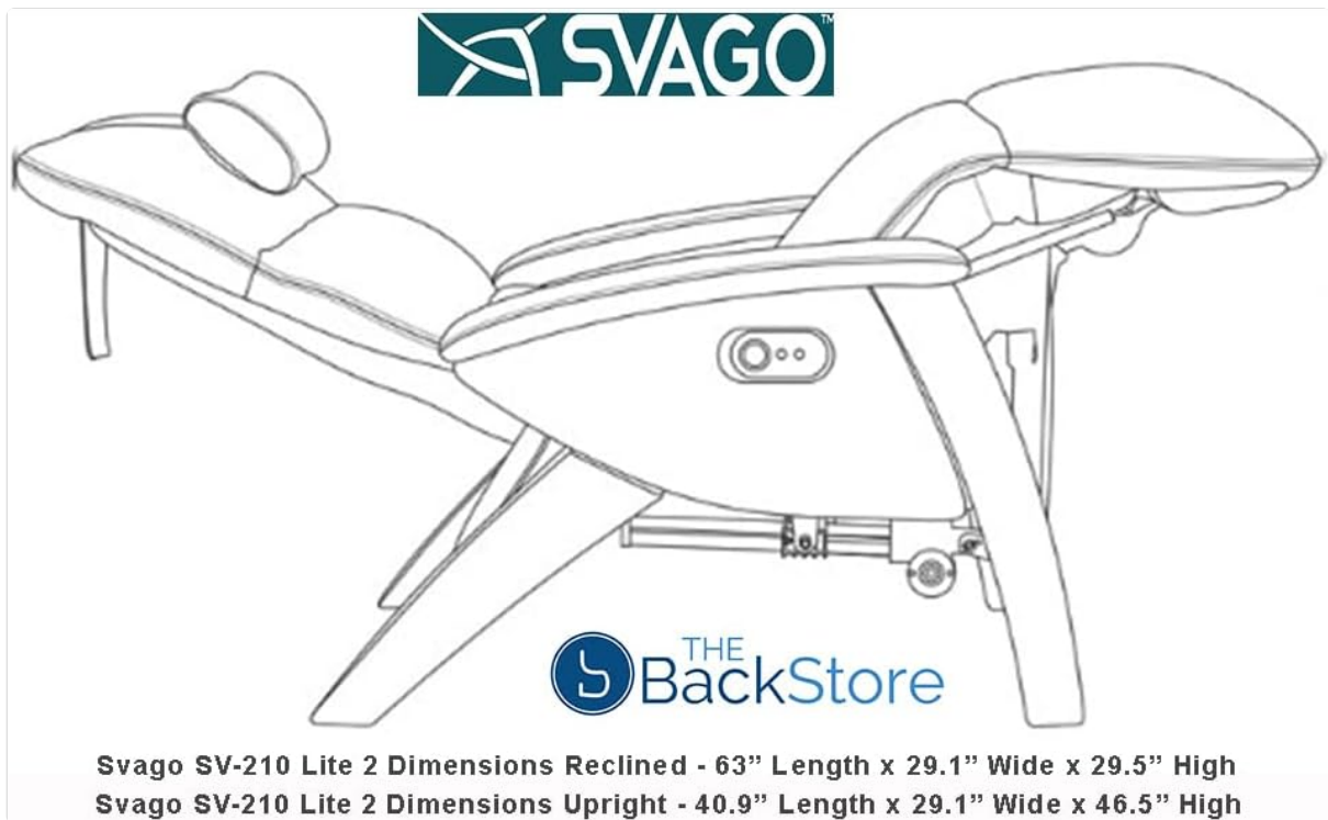
Image: The Svago Lite recliner in a fully reclined, zero gravity position.