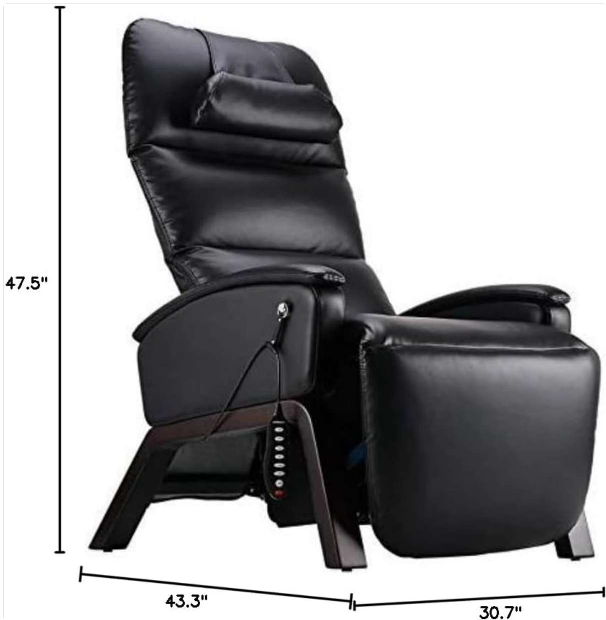
Image: Front view of the Svago Lite Zero Gravity Recliner Chair.