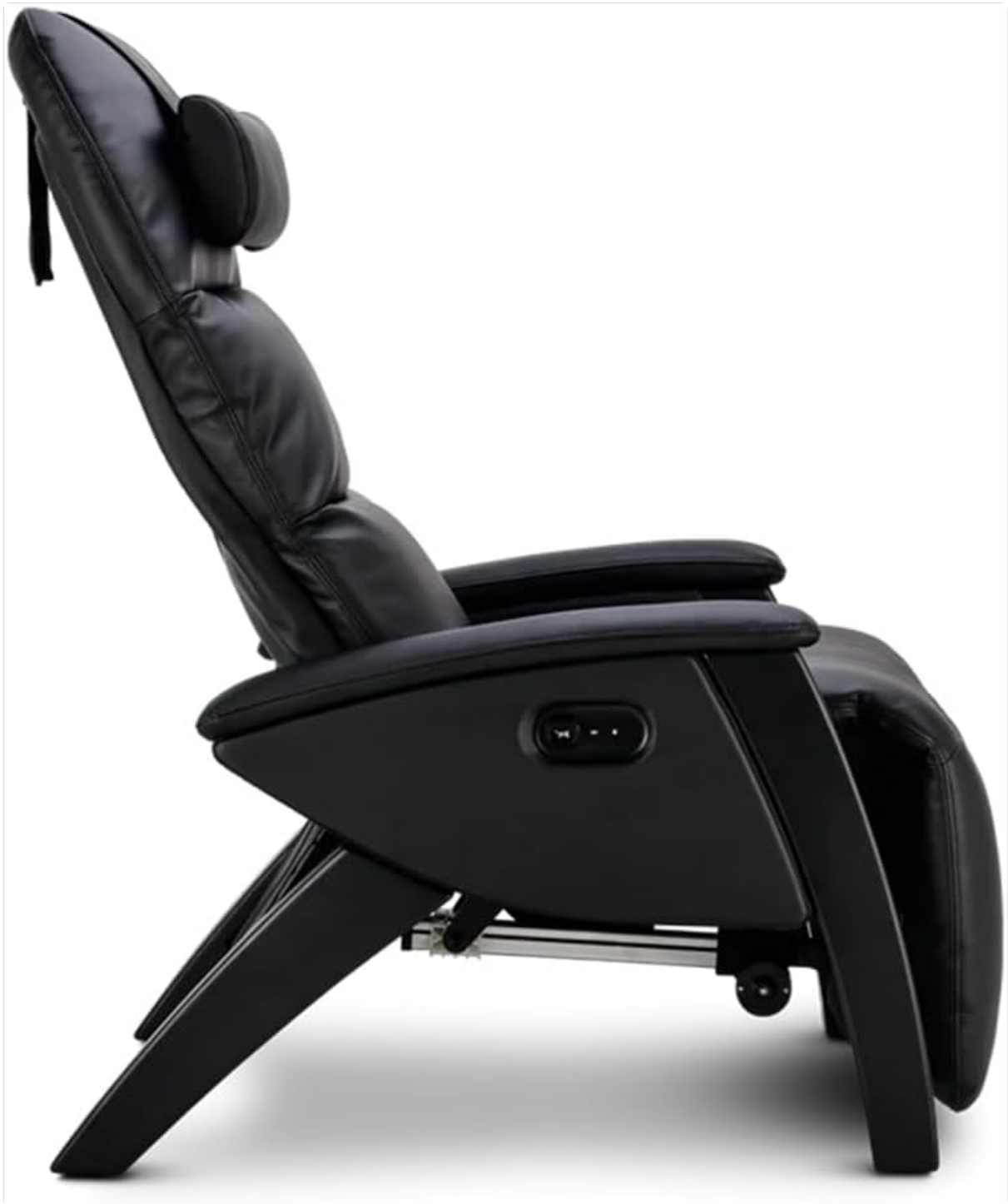
Image: Side view of the Svago Lite Zero Gravity Recliner Chair, showcasing its design.