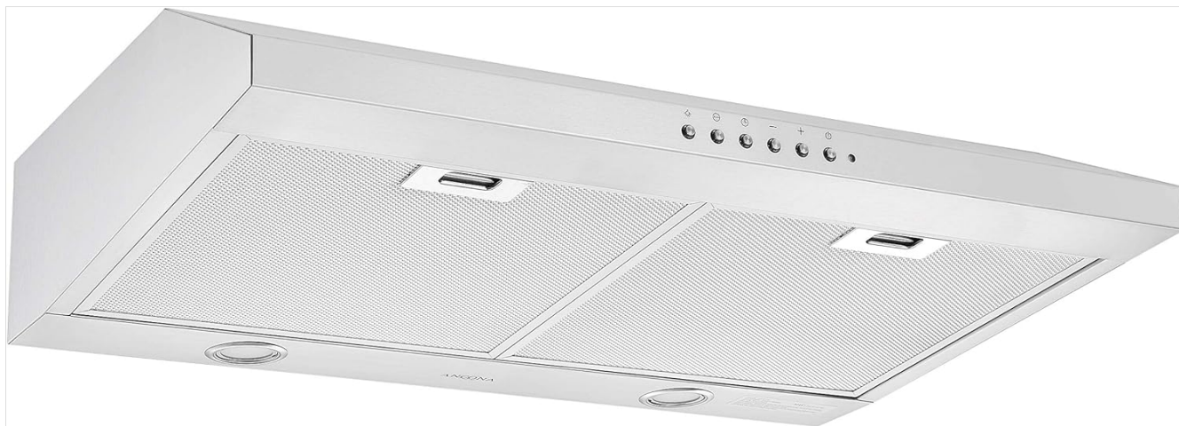
Figure 1.1: The Ancona UC64NL 30-inch under-cabinet range hood, showcasing its sleek stainless steel design and integrated lighting.

Thank you for choosing the Ancona UC64NL Under-Cabinet Range Hood. This manual provides essential information for the safe installation, operation, and maintenance of your new appliance. Please read this manual thoroughly before installation and retain it for future reference.