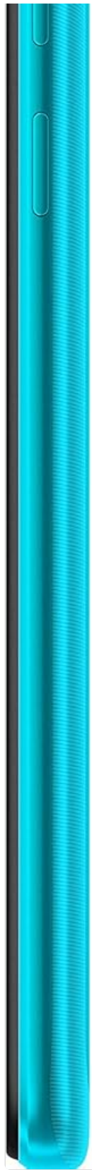
Figure 2.4: Bottom view of the Redmi 9A, detailing the Micro-USB port, speaker, and microphone.