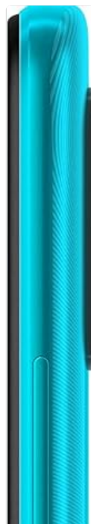
Figure 2.3: Right side view of the Redmi 9A, indicating the location of the volume control and power button.