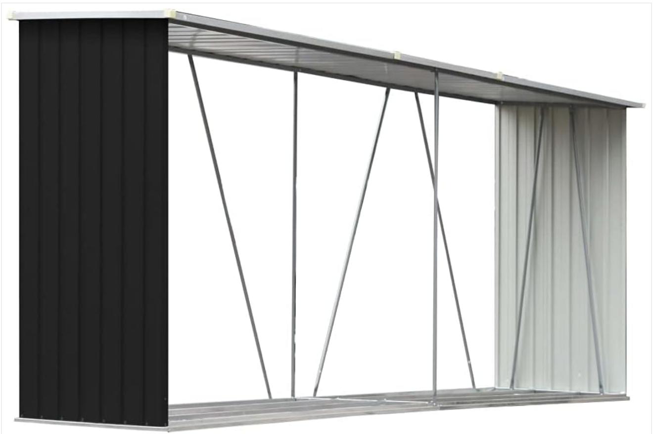
Figure 1: Assembled vidaXL Galvanized Steel Garden Shed (Anthracite)

Key features include a stable structure with steel support bars, additional tubes for enhanced stability, a raised floor to ensure proper ventilation for logs, and a sloped roof designed for efficient rainwater runoff. Its galvanized steel construction ensures minimal maintenance and long-lasting durability.