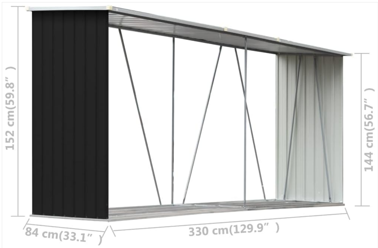
Figure 5: Overall dimensions of the assembled shed (330 cm length, 84 cm width, 152 cm height).