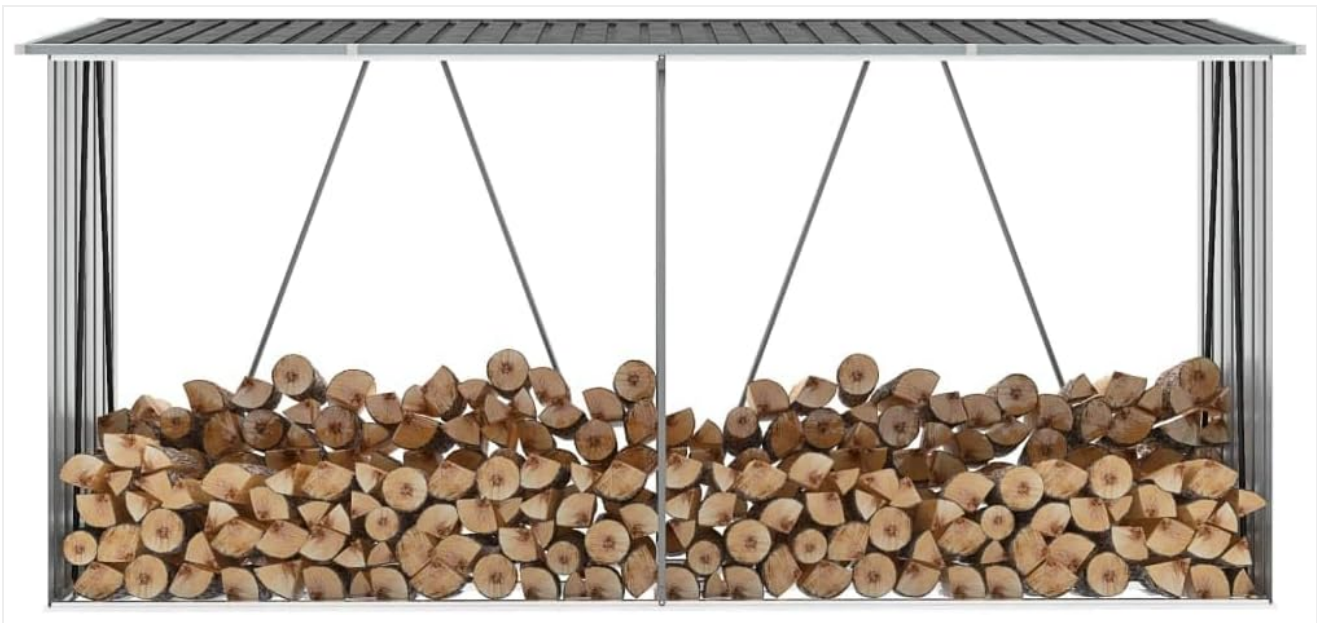
Figure 6: Example of firewood properly stacked within the shed, demonstrating ventilation space.