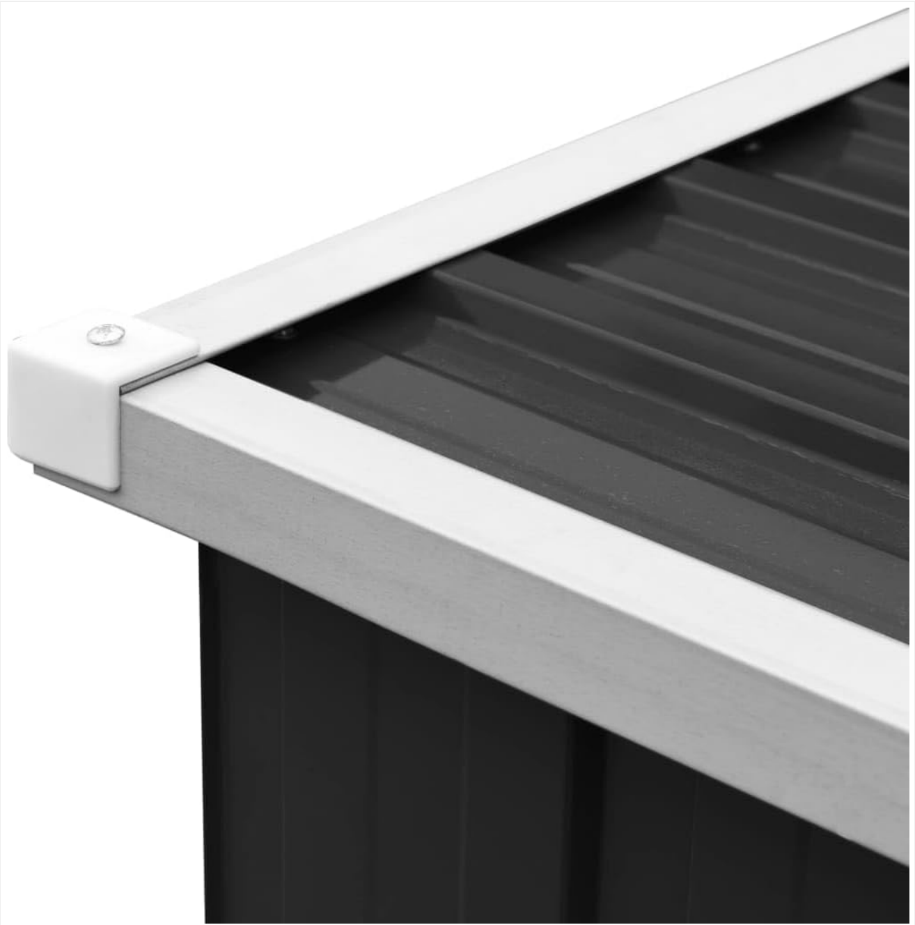
Figure 4: Detail of the roof edge and corner.

2. Secure the roof panels to the frame using the remaining fasteners.