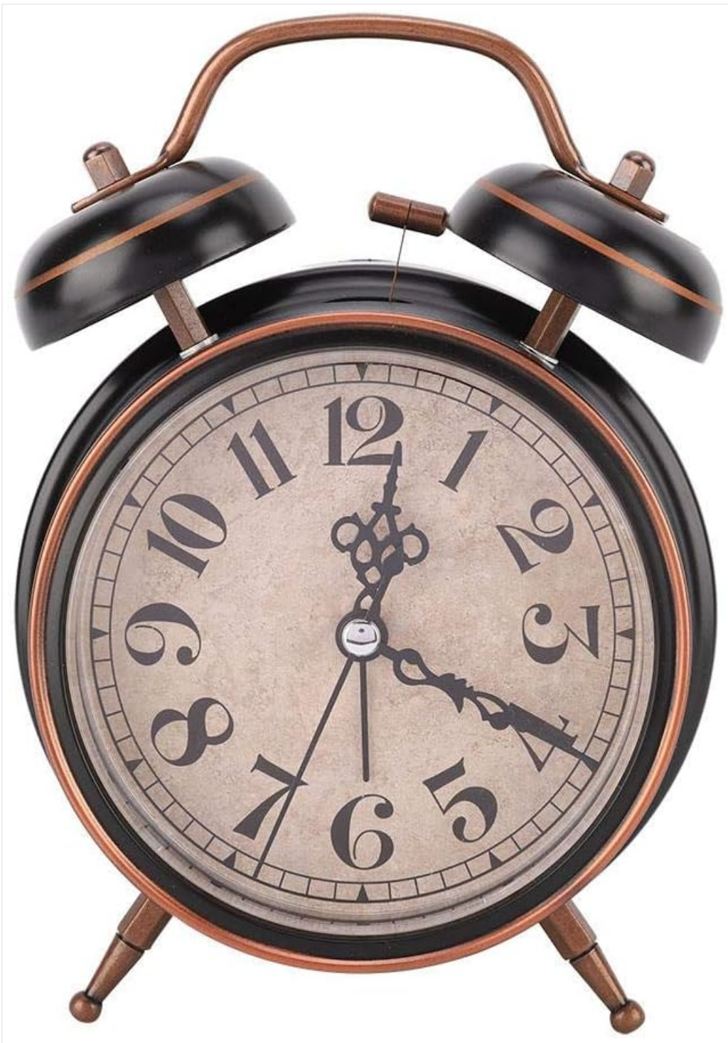
Image: Front view of the Mumusuki 4-inch Retro Mechanical Alarm Clock, showcasing its classic design with twin bells and an analog dial.