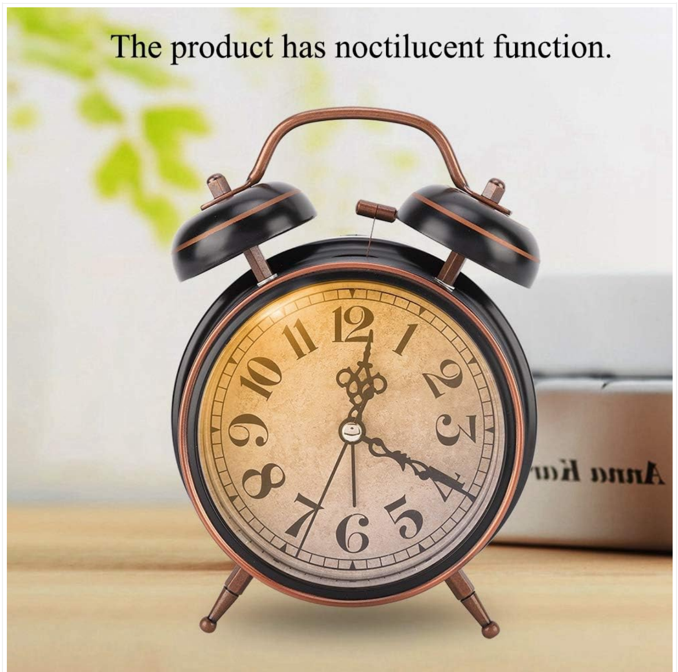
Image: The alarm clock with its night light activated, showing the illuminated clock face for nighttime visibility.

The clock features a night light function. To activate it, press the button located on the back of the clock (often a small circular button). The light will illuminate the clock face for a short period, allowing you to read the time in the dark.