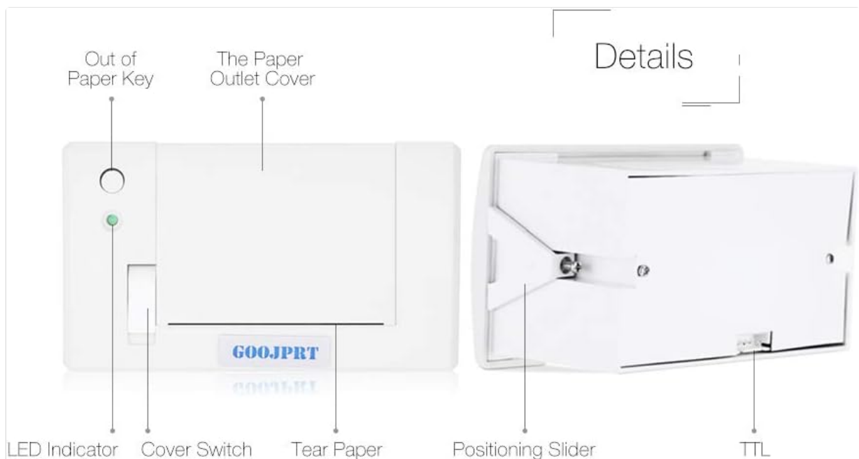
Figure 2: Key components of the QR701 printer.

Familiarize yourself with the main components and features of your QR701 printer.