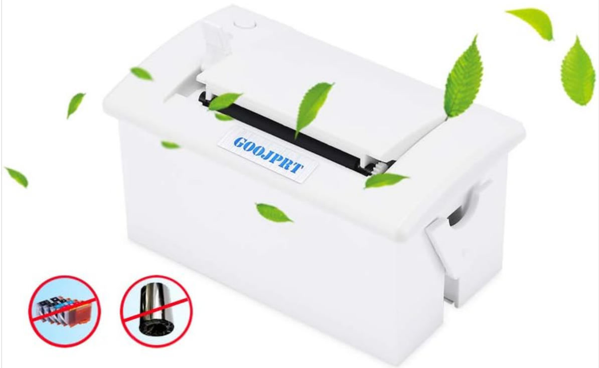
Figure 4: Environmental benefits of the printer.

It does not require ribbon and cartridge, reduce energy consumption