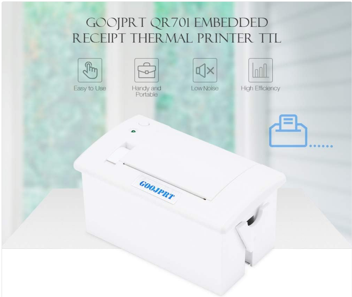
Figure 1: GoojpRT QR701 Mini Thermal Receipt Printer.