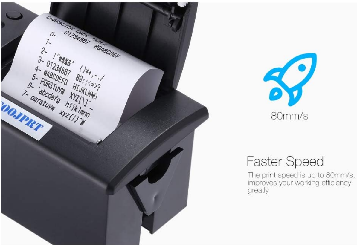
Figure 5: High-speed printing capability.