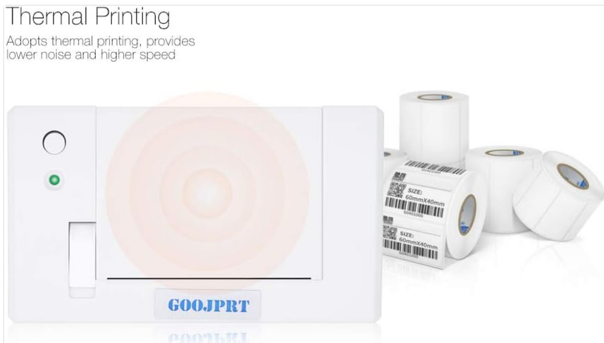
Figure 3: Thermal printing benefits.