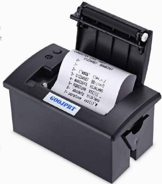
Figure 7: Printer with cover open for paper loading.