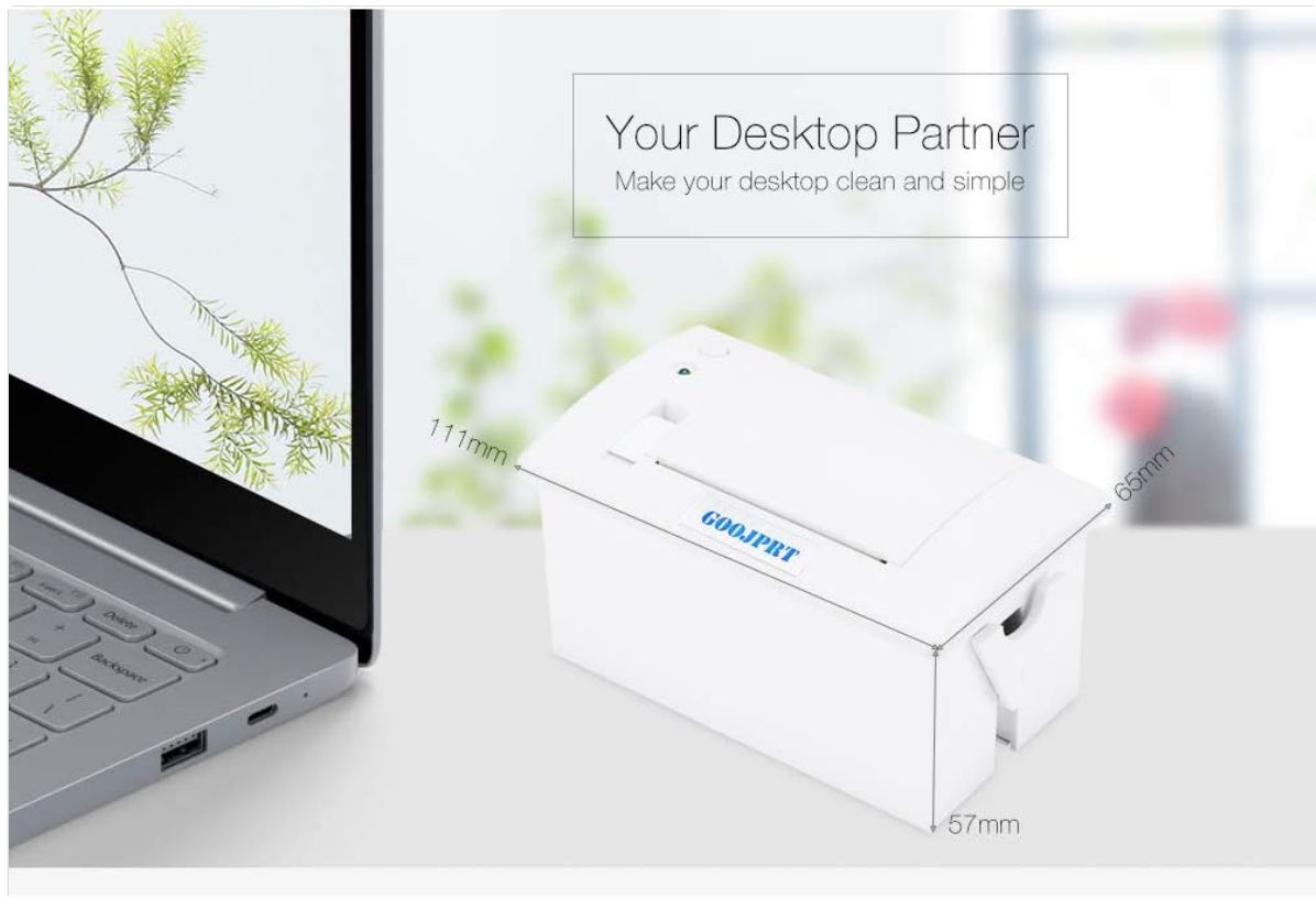
Figure 6: Printer dimensions.