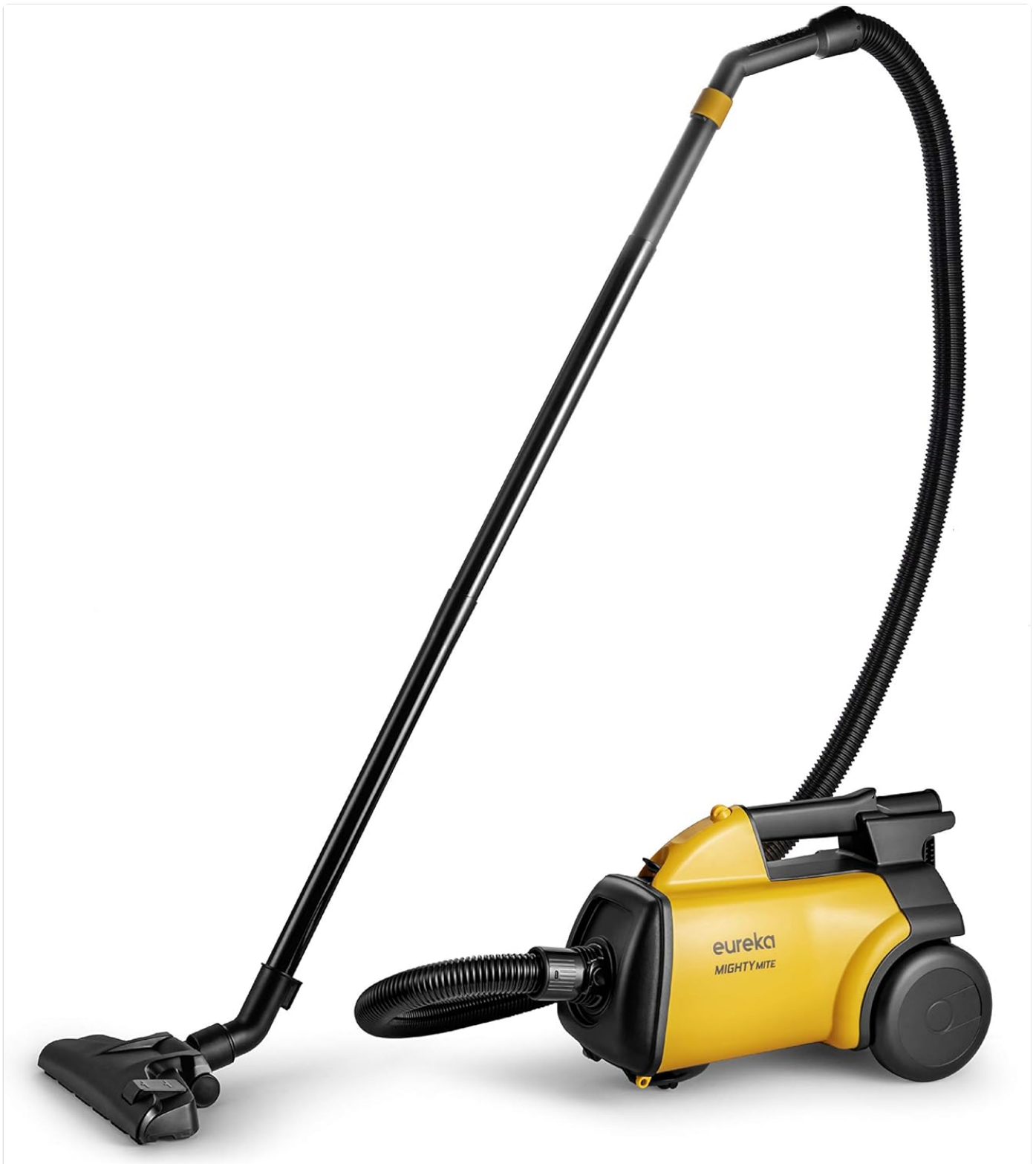
Figure 3.1: Eureka 3670M Canister Cleaner assembled with hose and floor tool.

This image displays the complete Eureka 3670M Canister Cleaner, showing the main yellow canister unit, the flexible hose connected to the front, and the long extension wand with the floor tool attached at the end. The unit features wheels for easy mobility and a handle for carrying.