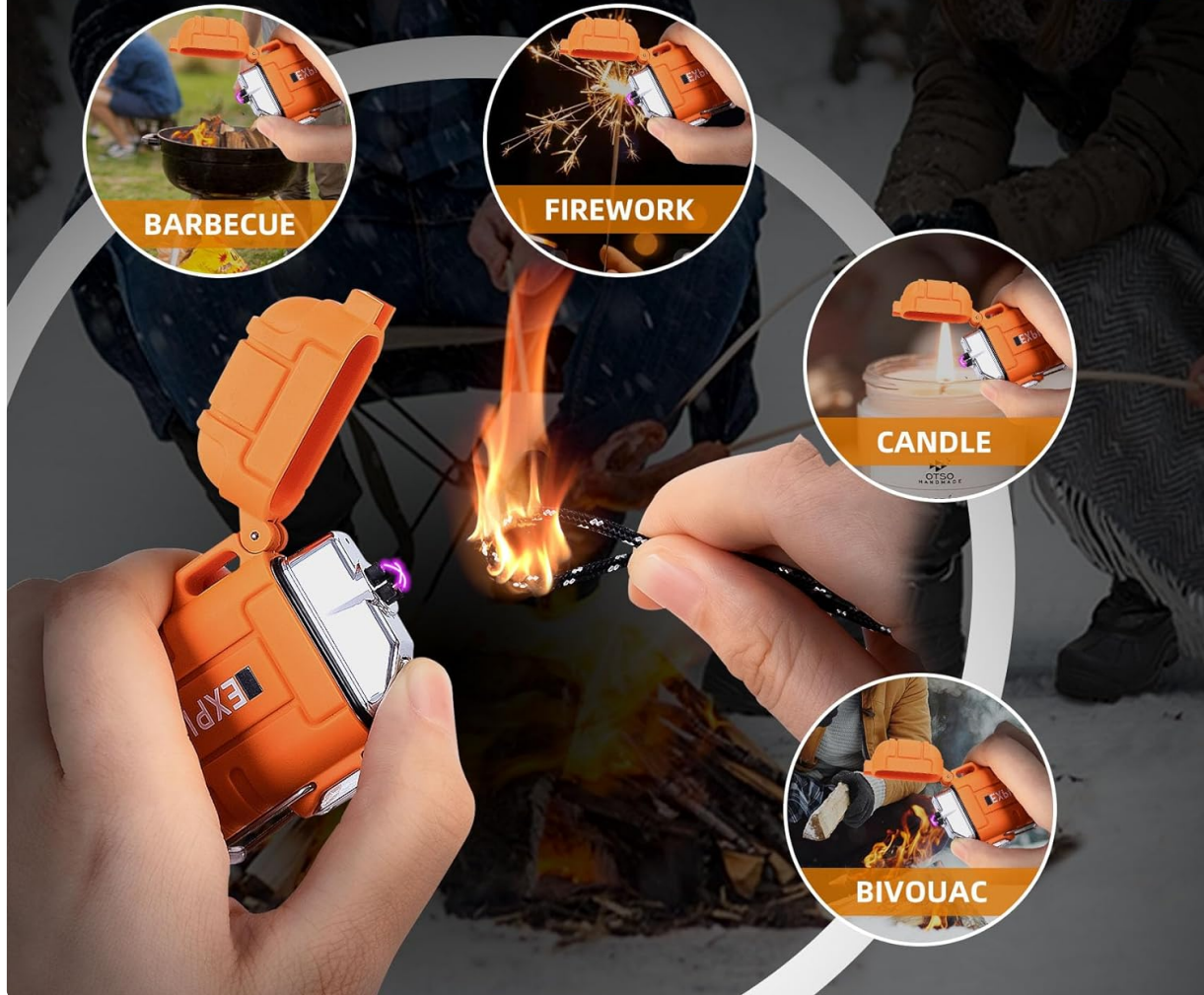
Figure 5: Examples of how the lighter can be used in different outdoor and recreational settings.