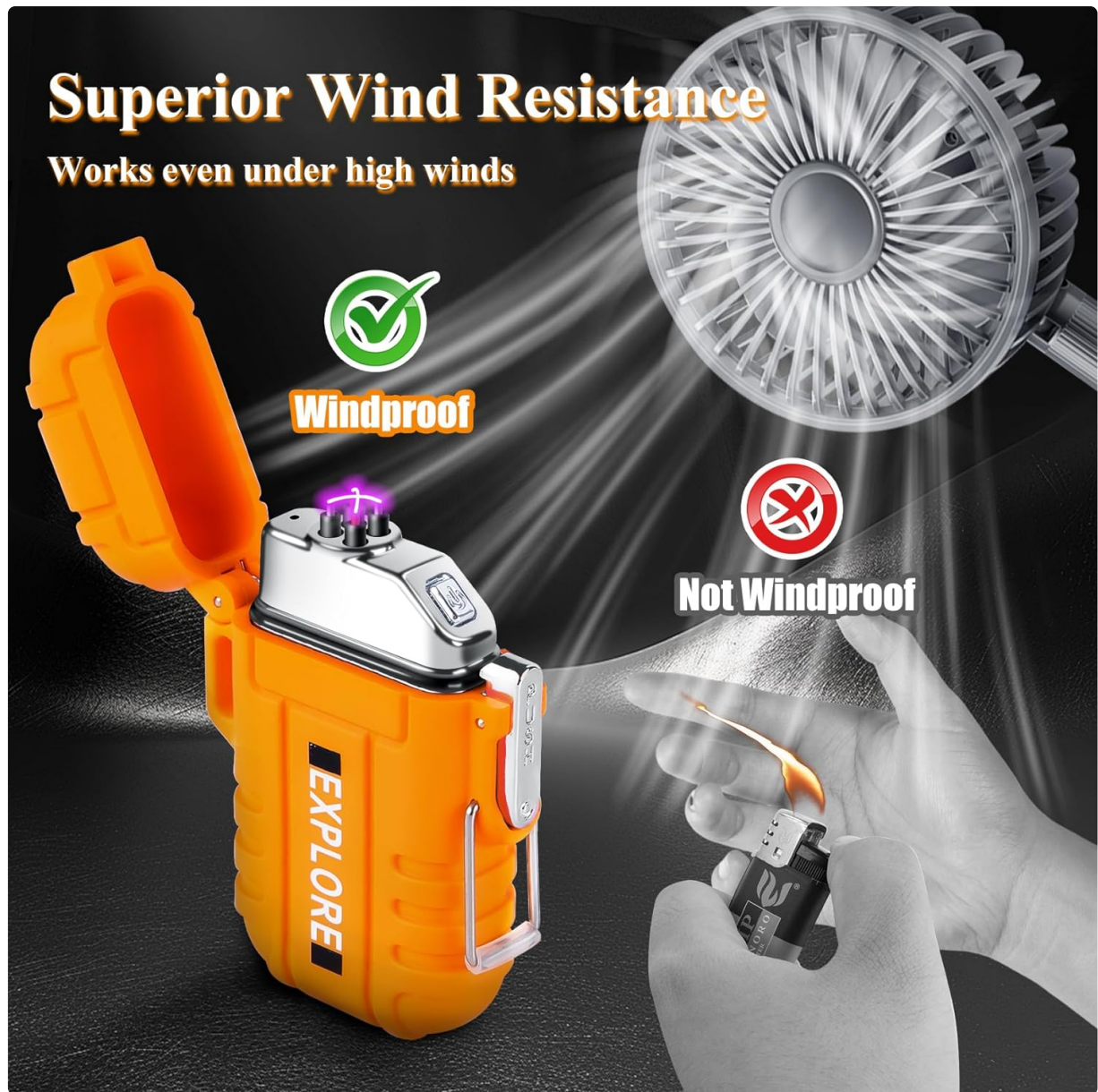
Figure 4: The lighter's plasma arc remains stable even when exposed to strong airflow from a fan.