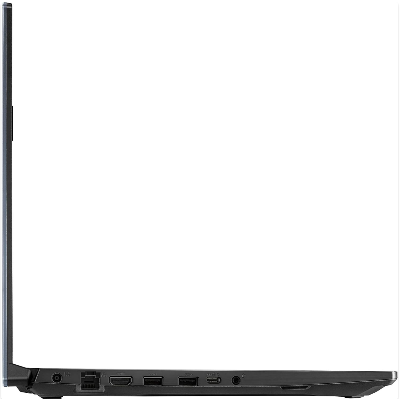
Figure 2: Left Side Ports