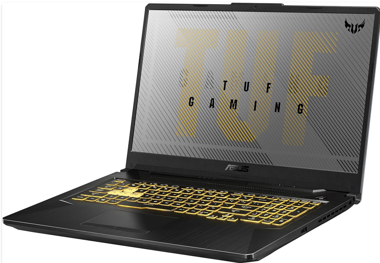
Figure 1: ASUS TUF Gaming A17 Laptop (TUF706IH-ES75) - Front View

This manual provides essential information for setting up, operating, maintaining, and troubleshooting your ASUS TUF Gaming A17 Laptop, model TUF706IH-ES75. Please read this guide thoroughly to ensure optimal performance and longevity of your device.