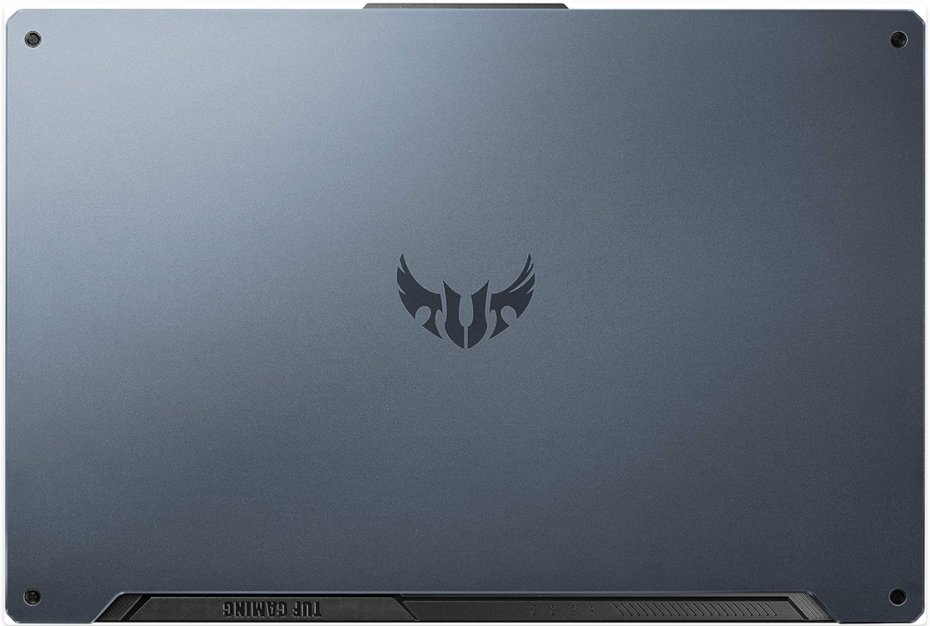
Figure 5: Rear Cooling Vents

The laptop features an Anti-Dust Cooling (ADC) system with dual self-cleaning fans to maintain stability and prevent dust buildup. Regularly ensure that the cooling vents are not obstructed to allow for optimal airflow.