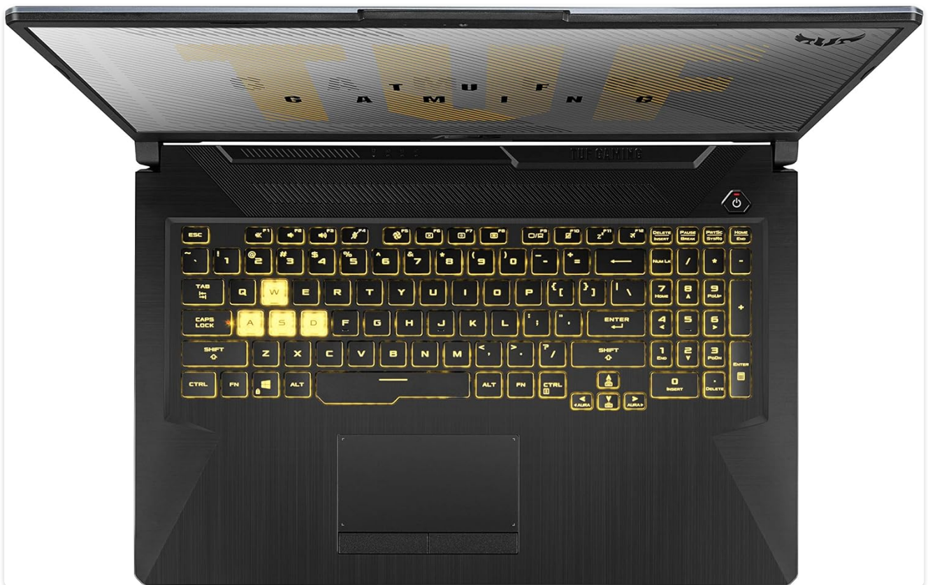
Figure 4: Keyboard Layout

The laptop features a desktop-style keyboard with a dedicated Numpad and customizable Aura RGB backlighting. The touchpad supports multi-touch gestures for navigation.