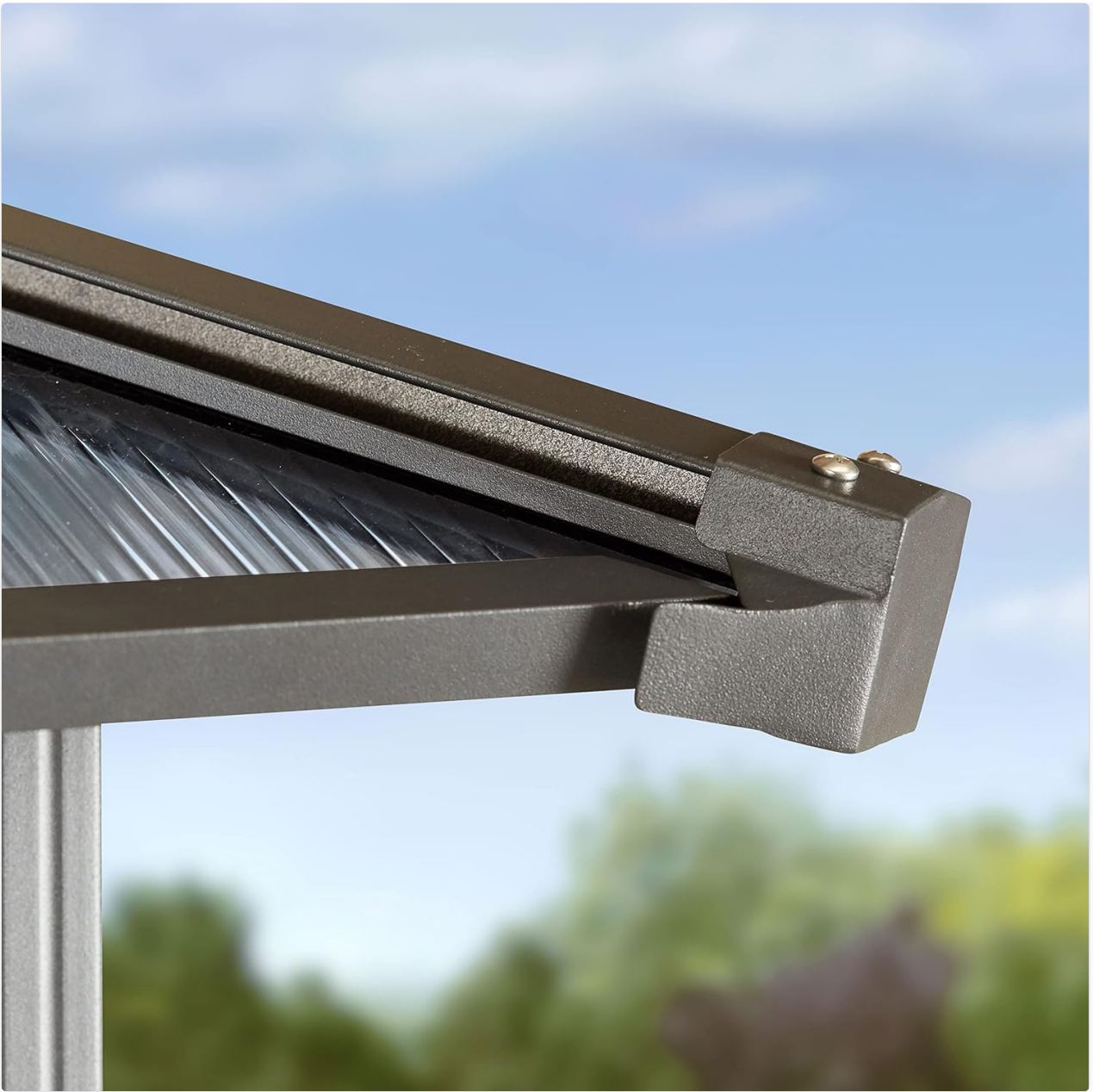
Figure 3.3: Polycarbonate roof panel detail.