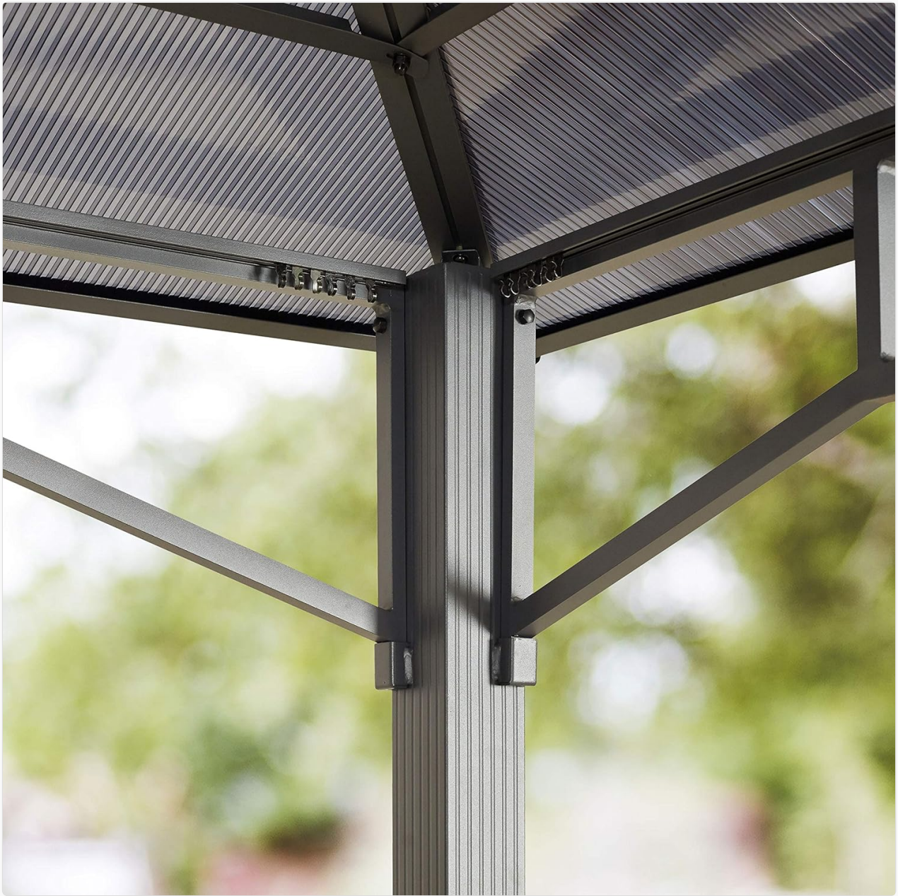
Figure 3.2: Detail of a post and beam connection point.