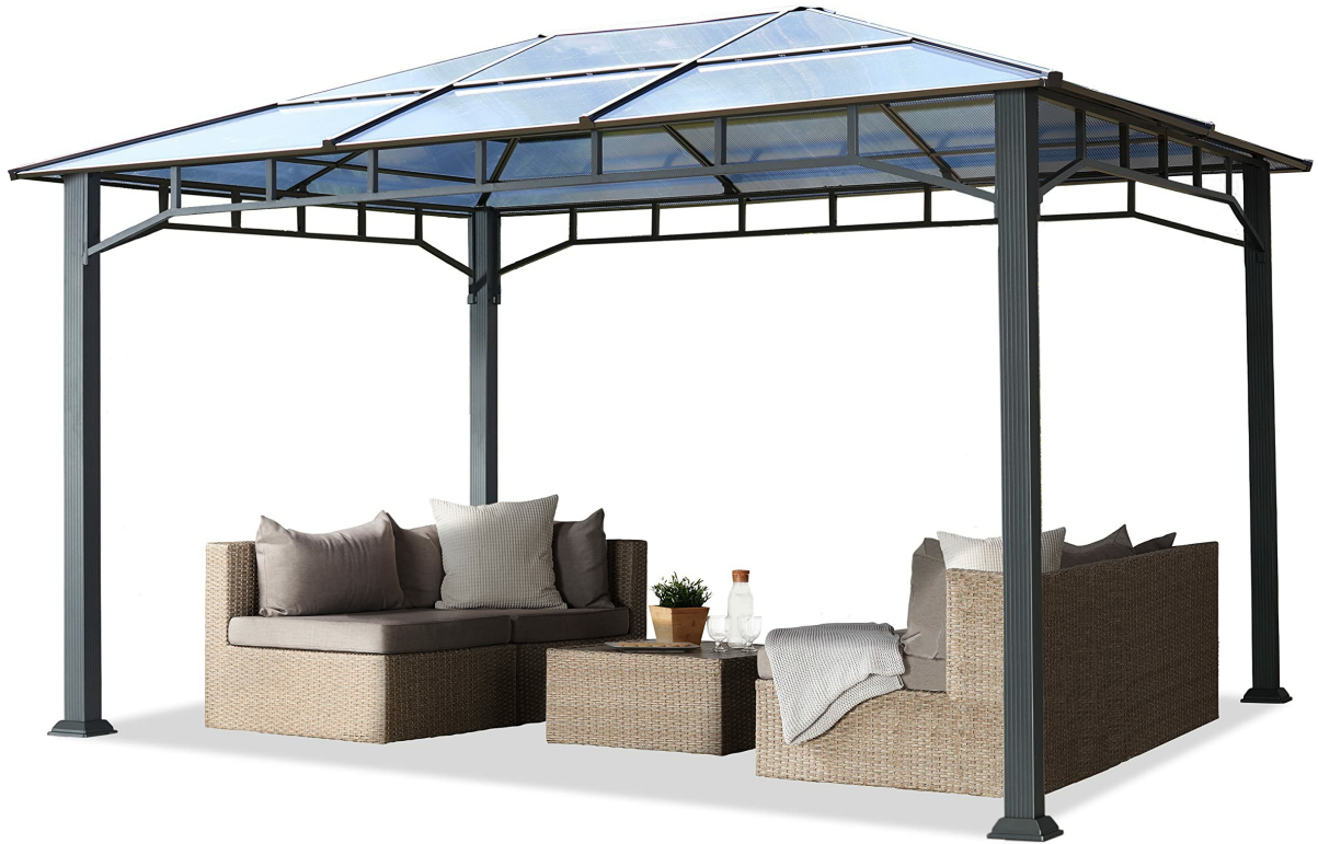
Figure 2.1: Overall view of the TOOLPORT Hardtop Gazebo.