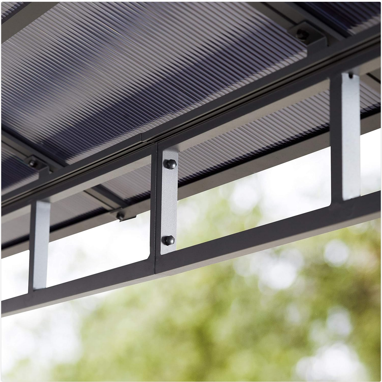
Figure 3.4: Underside view of the roof support structure.