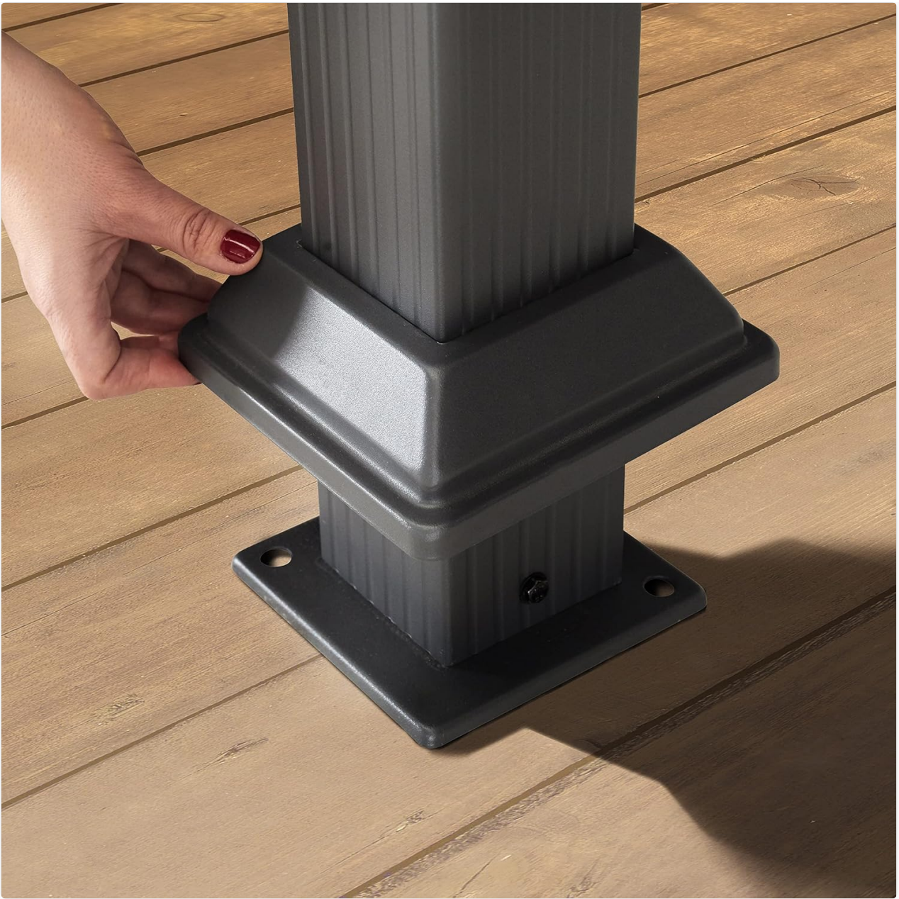
Figure 3.5: Gazebo post base with anchoring points.