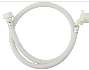
Our Inlet Hose