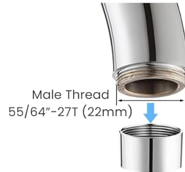
Male Thread 55/64"-27T (22mm)