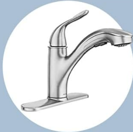
Non removable aerator faucet