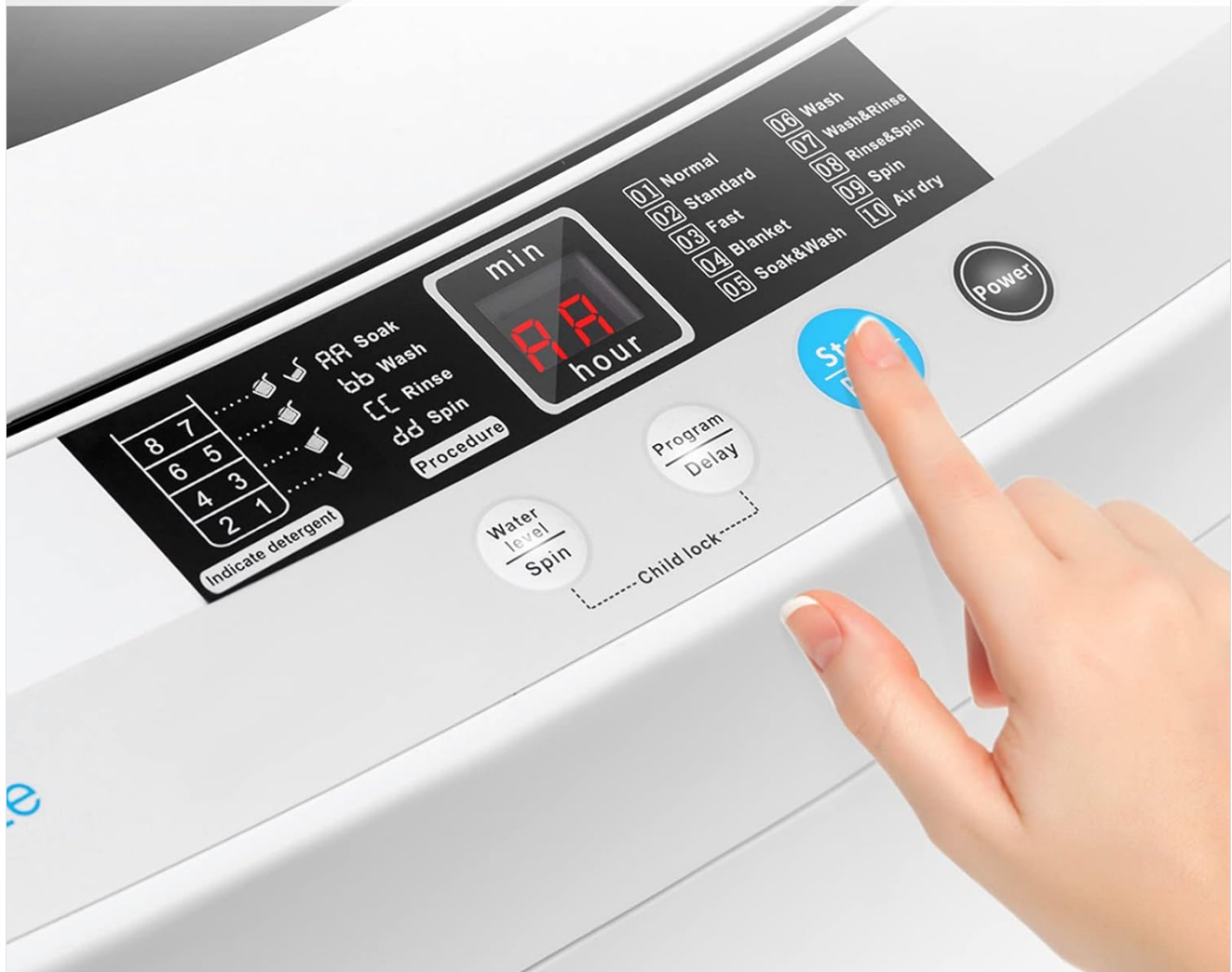
Figure 3.2: Control Panel Layout. This image details the control panel, showing the 10 program options, 8 water level settings, LED display, and time setting controls for easy operation.