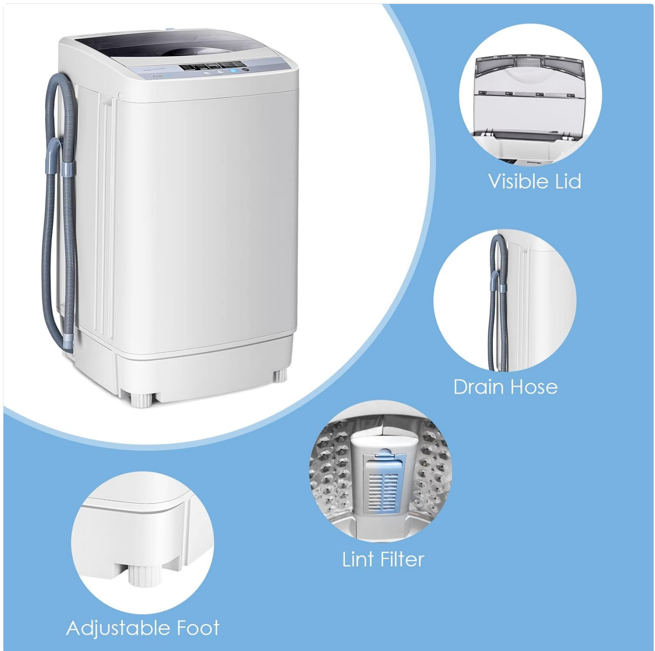
Figure 3.1: Key Components. This image illustrates the visible lid, drain hose, lint filter, and adjustable foot, providing a visual guide to the machine's features.