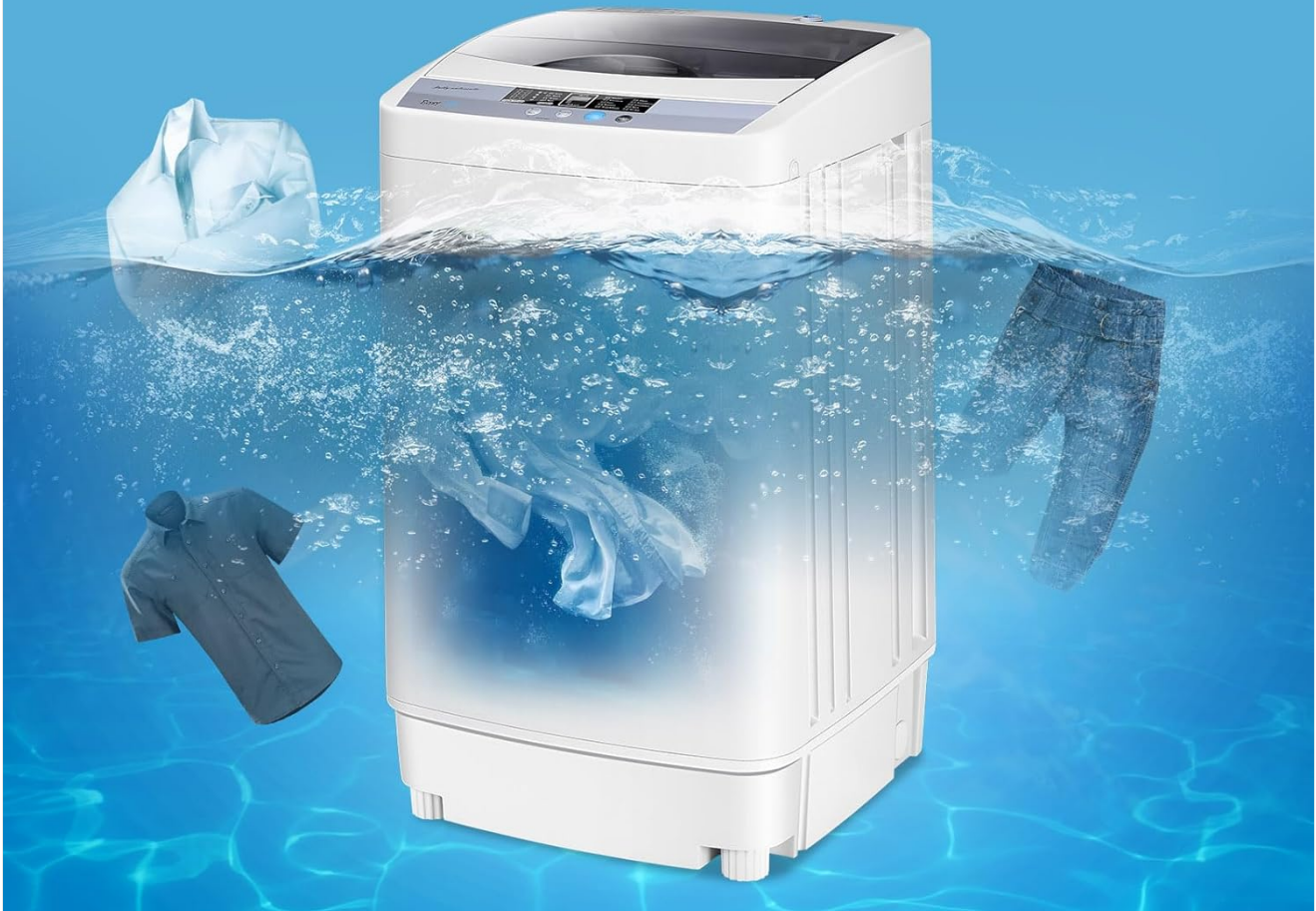
Figure 5.1: Loading Capacity. This image demonstrates the 12 lbs capacity of the washing machine, showing it can accommodate various items such as underwear, t-shirts, trousers, and bedding.