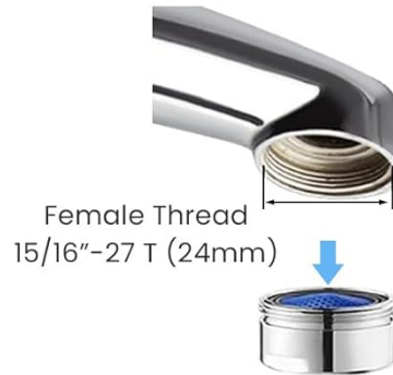
Female Thread 15/16"-27 T (24mm)