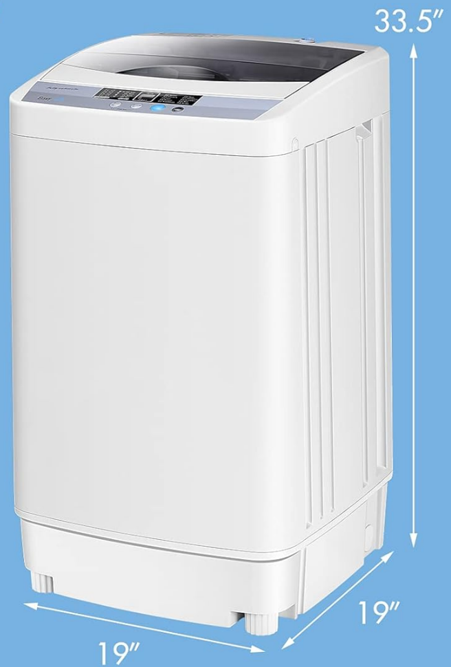
Figure 4.1: Placement Guidelines. This image illustrates the compact dimensions of the washing machine and suggests ideal placement in various small living environments such as dorms, apartments, and RVs.