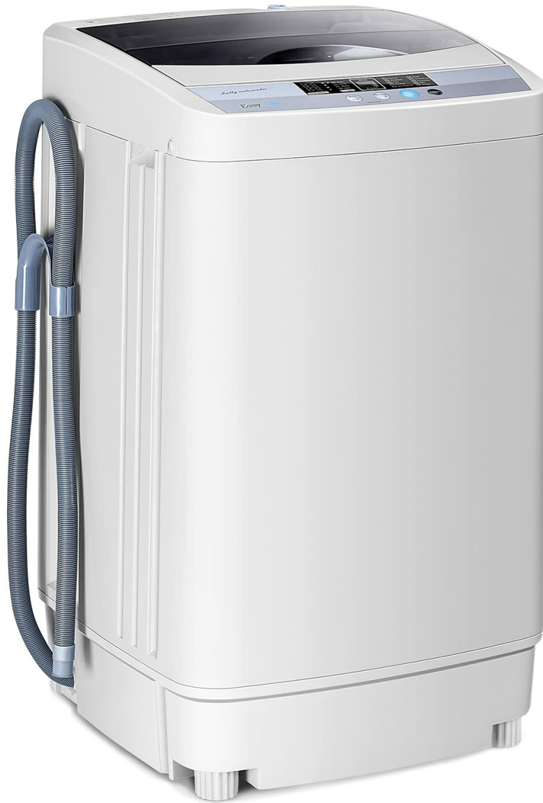
Figure 2.1: Child Lock Feature. This image highlights the child lock function on the control panel, emphasizing its role in preventing accidental operation by children.