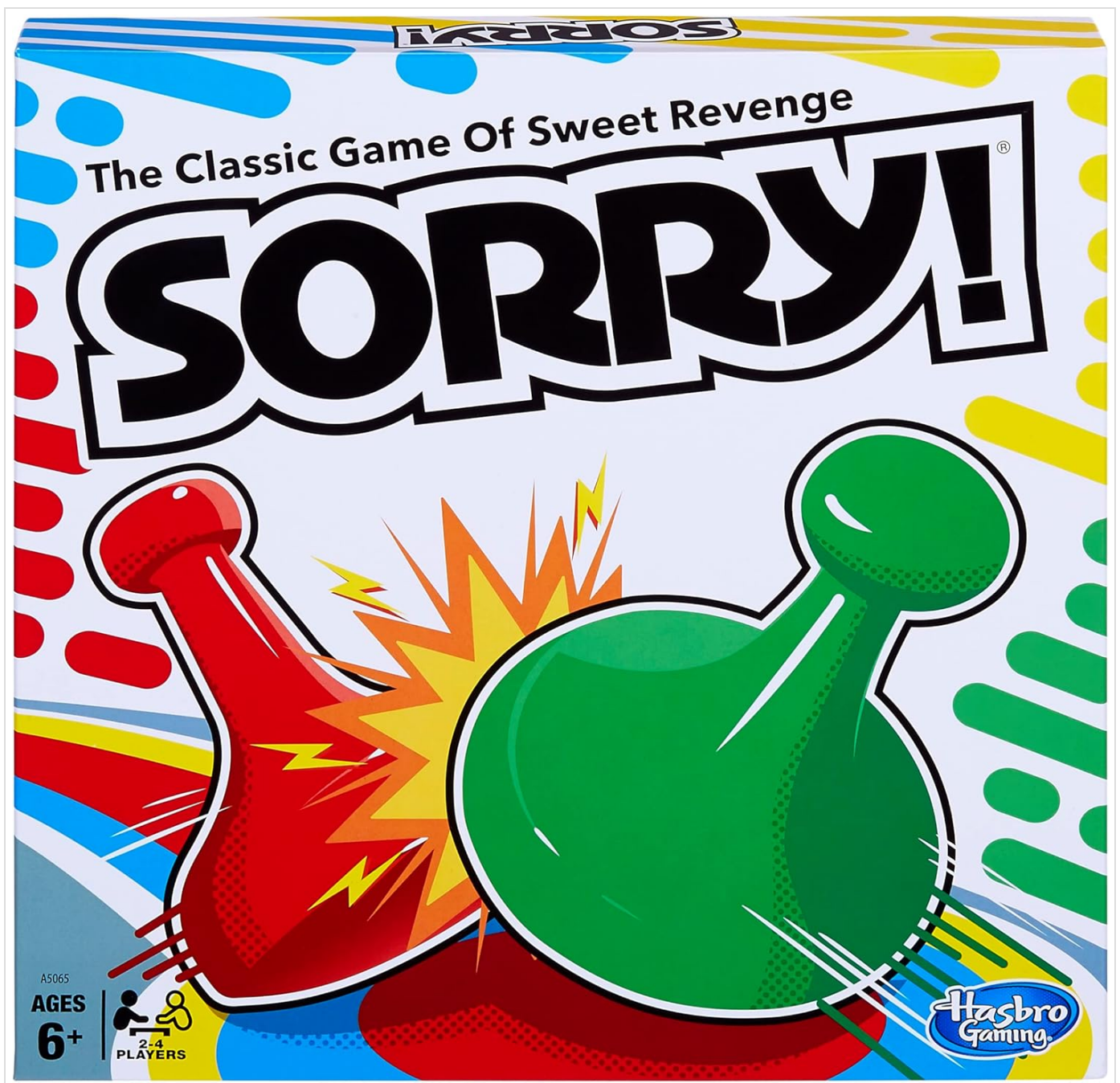
Image: The Sorry! game box, featuring two pawns, one red and one green, appearing to collide.