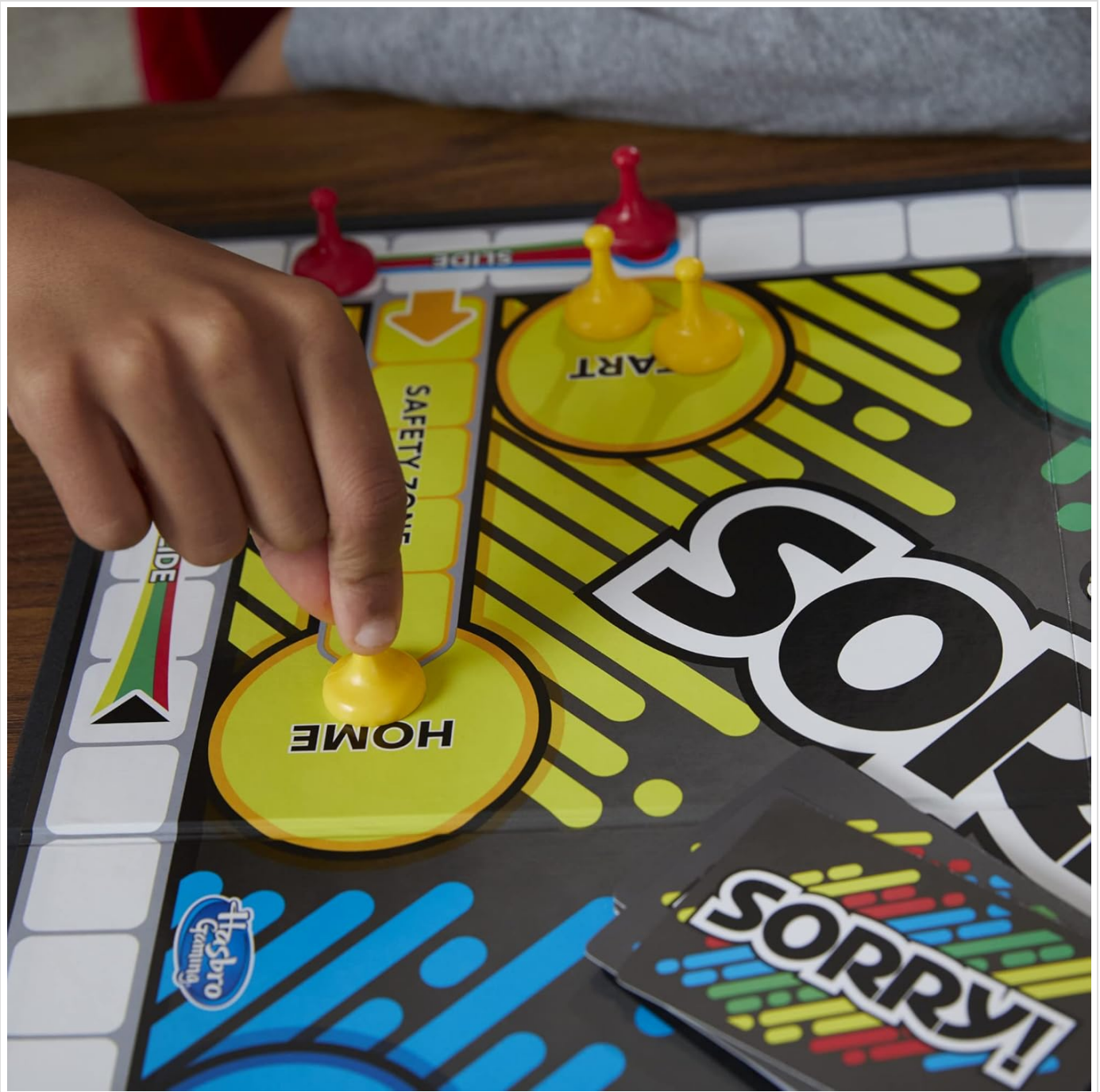
Image: A hand moving a yellow pawn into the "Home" circle, indicating the final destination for a pawn.