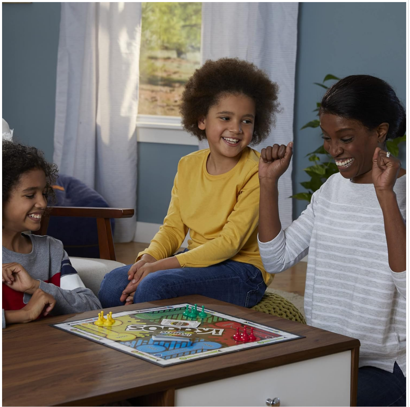
Image: A family enjoying a game of Sorry!, highlighting the social aspect of the game.