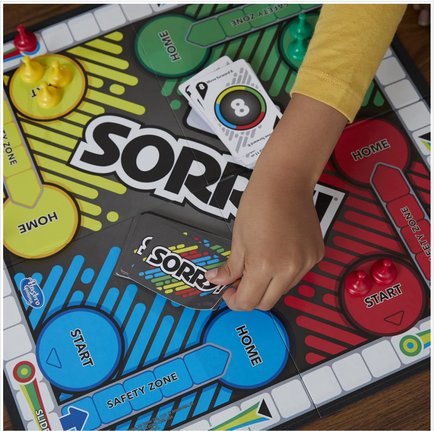
Image: A hand reaching to draw a card from the deck placed on the Sorry! game board.