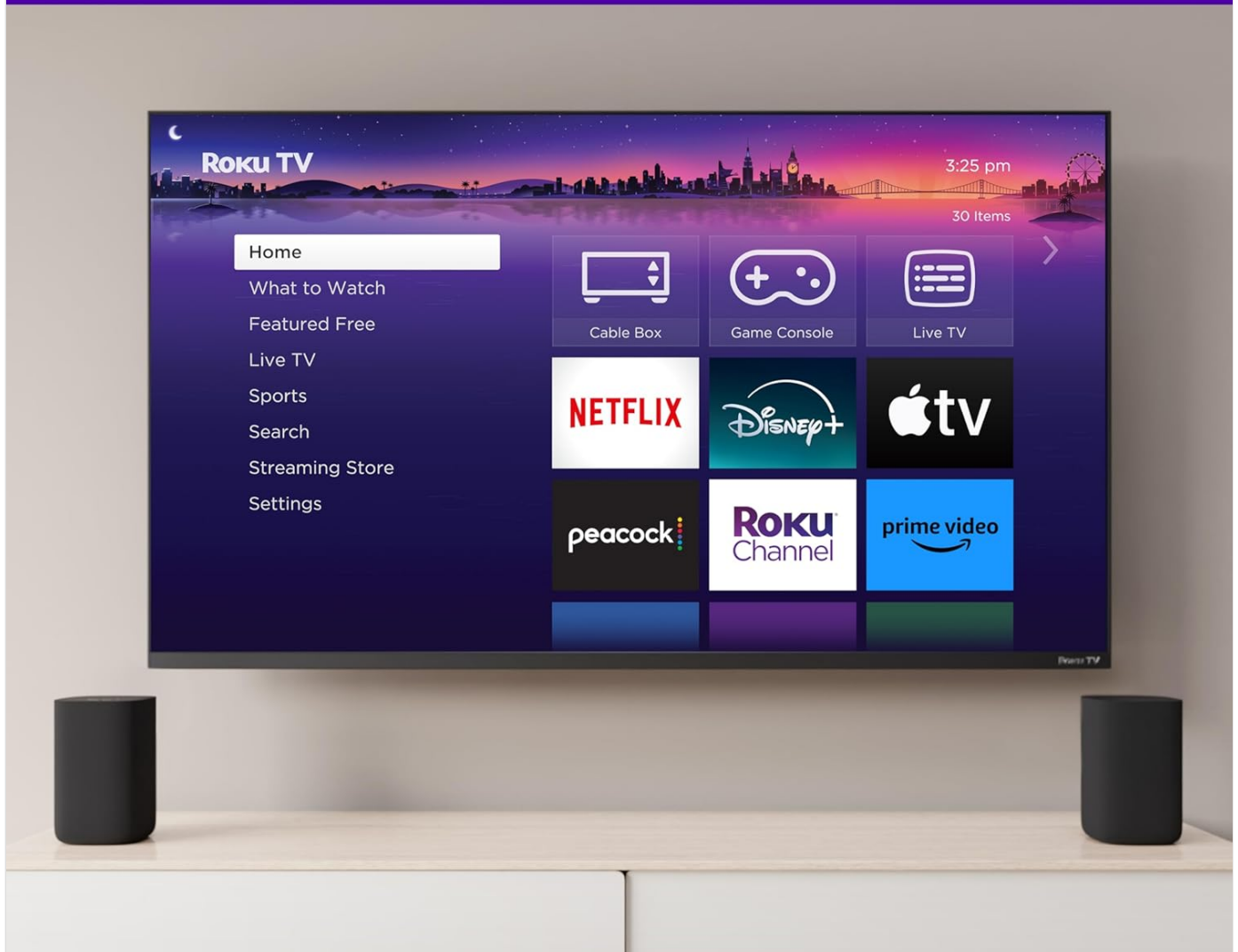
Image: A Roku TV displaying its home screen with various streaming apps, flanked by two black Roku Wireless Speakers on a media console, illustrating a typical setup.

Wireless speakers are not compatible with non-Roku TVs nor Roku Players.