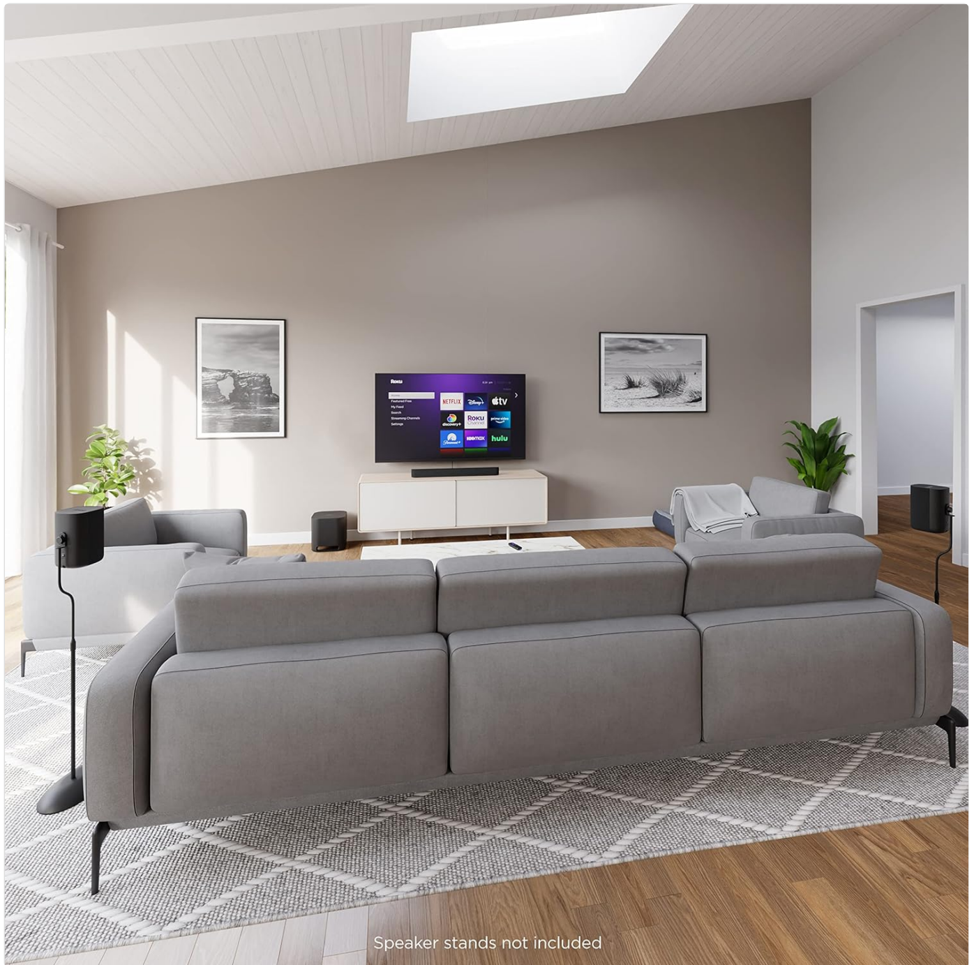
Speaker stands not included

Image: A living room with a large TV and a sofa, showing two Roku Wireless Speakers placed on stands behind the sofa, illustrating a potential rear surround sound setup.