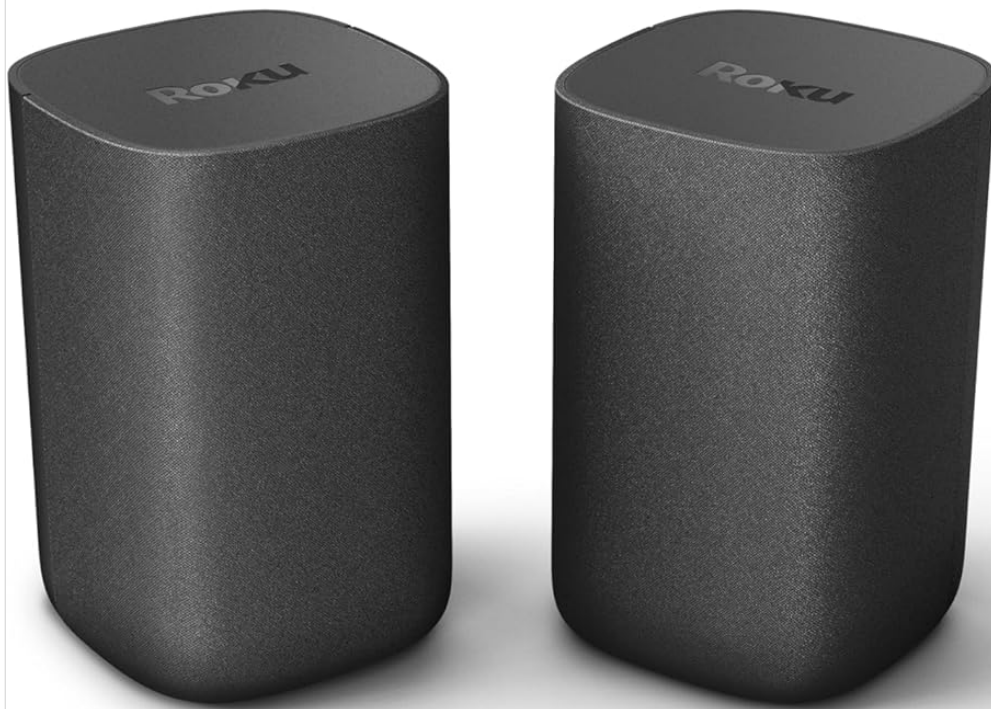
Roku Wireless Speakers