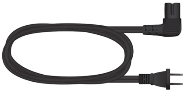
Power cable x2

Image: The contents of the Roku Wireless Speakers box, showing two compact black speakers and their accompanying power cables.