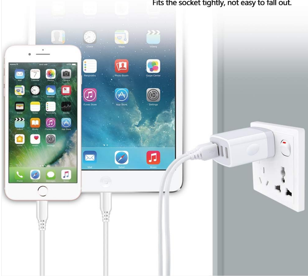
Image: The HOOTEK 4-Port USB Wall Charger connected to a wall outlet, simultaneously charging an iPhone and an iPad, demonstrating its multi-device charging capability.

Fits the socket tightly, not easy to fall out.