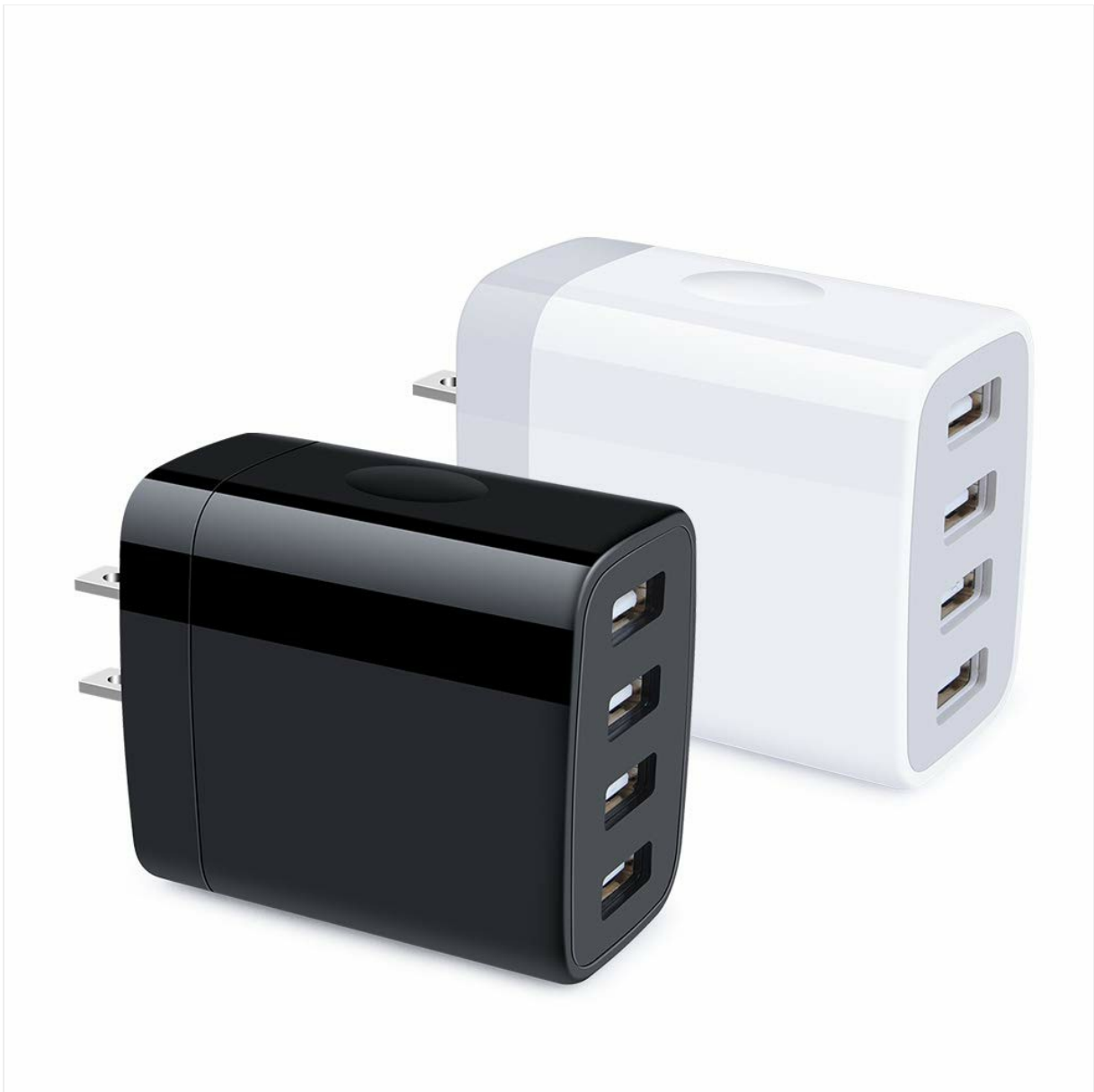
Image: A black and white HOOTEK 4-Port USB Wall Charger, illustrating its compact design and four USB-A output ports.