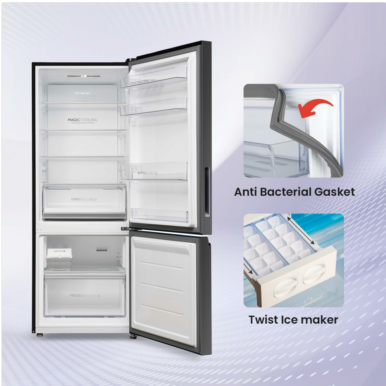
Figure 6: Close-up of the Anti-Bacterial Gasket and Twist Ice Maker.