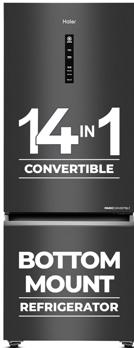
Figure 1: Front view of the Haier 325 L Bottom Mount Refrigerator.