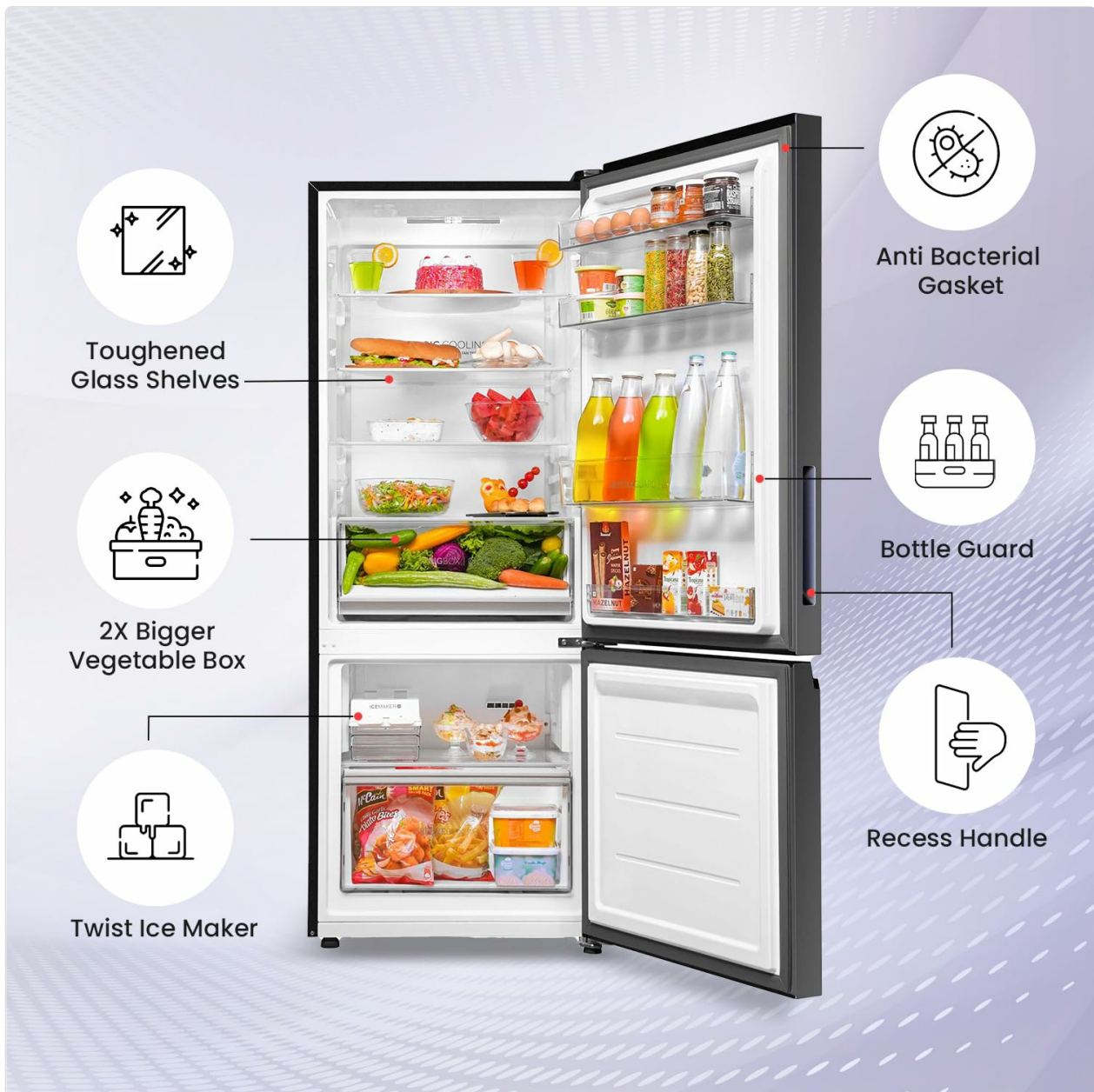
Figure 5: Interior layout highlighting storage features.