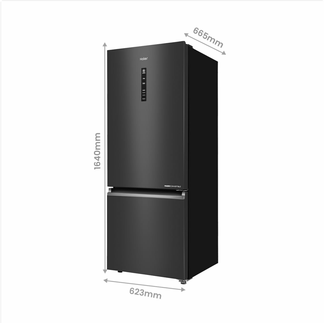
Figure 2: Refrigerator dimensions (W x D x H): 623 mm x 665 mm x 1640 mm.

Place the refrigerator on a firm, level surface. Ensure adequate ventilation around the appliance. Maintain a minimum clearance of 10 cm (4 inches) from the back and sides to allow for proper air circulation and heat dissipation. Avoid direct sunlight or proximity to heat sources.