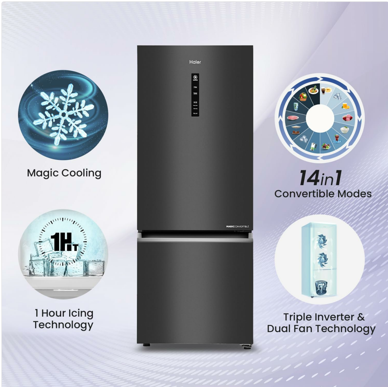
Figure 3: Overview of key features including 14-in-1 Convertible Modes.

Your Haier refrigerator offers 14 versatile convertible modes to adapt to your storage needs. These modes allow you to optimize the freezer compartment for various functions, from extra refrigeration to specific food preservation.