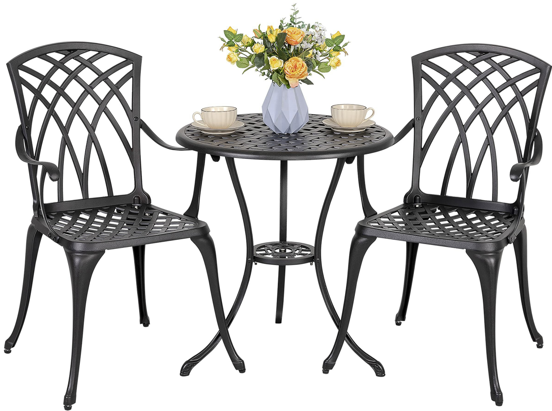
Image 3.1: The complete NUU GARDEN 3 Piece Cast Aluminum Bistro Set, featuring one round table and two armchairs.