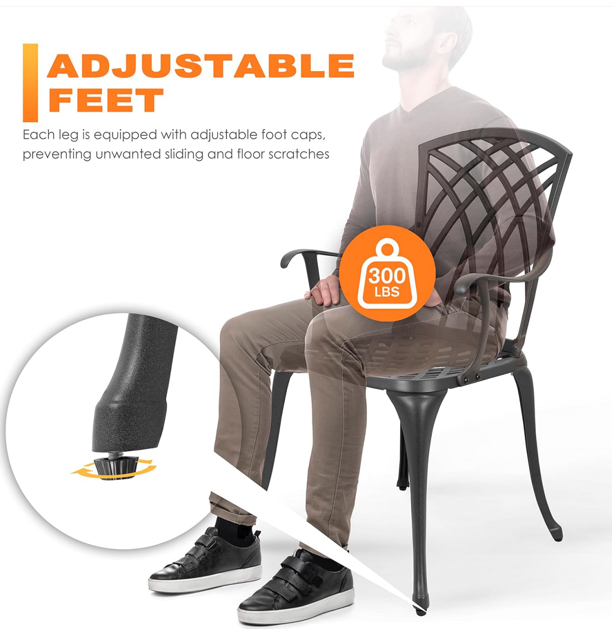
Image 5.1: Close-up view of the adjustable foot pads on the chair leg, designed to prevent sliding and floor scratches.

Each leg is equipped with adjustable foot caps, preventing unwanted sliding and floor scratches