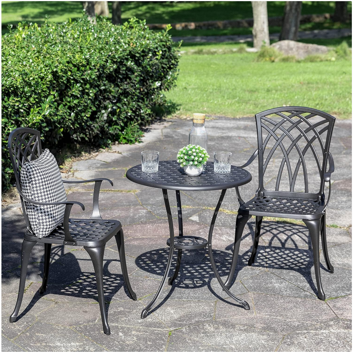
Image 10.1: The bistro set positioned on a patio, showcasing its elegant design in an outdoor environment.