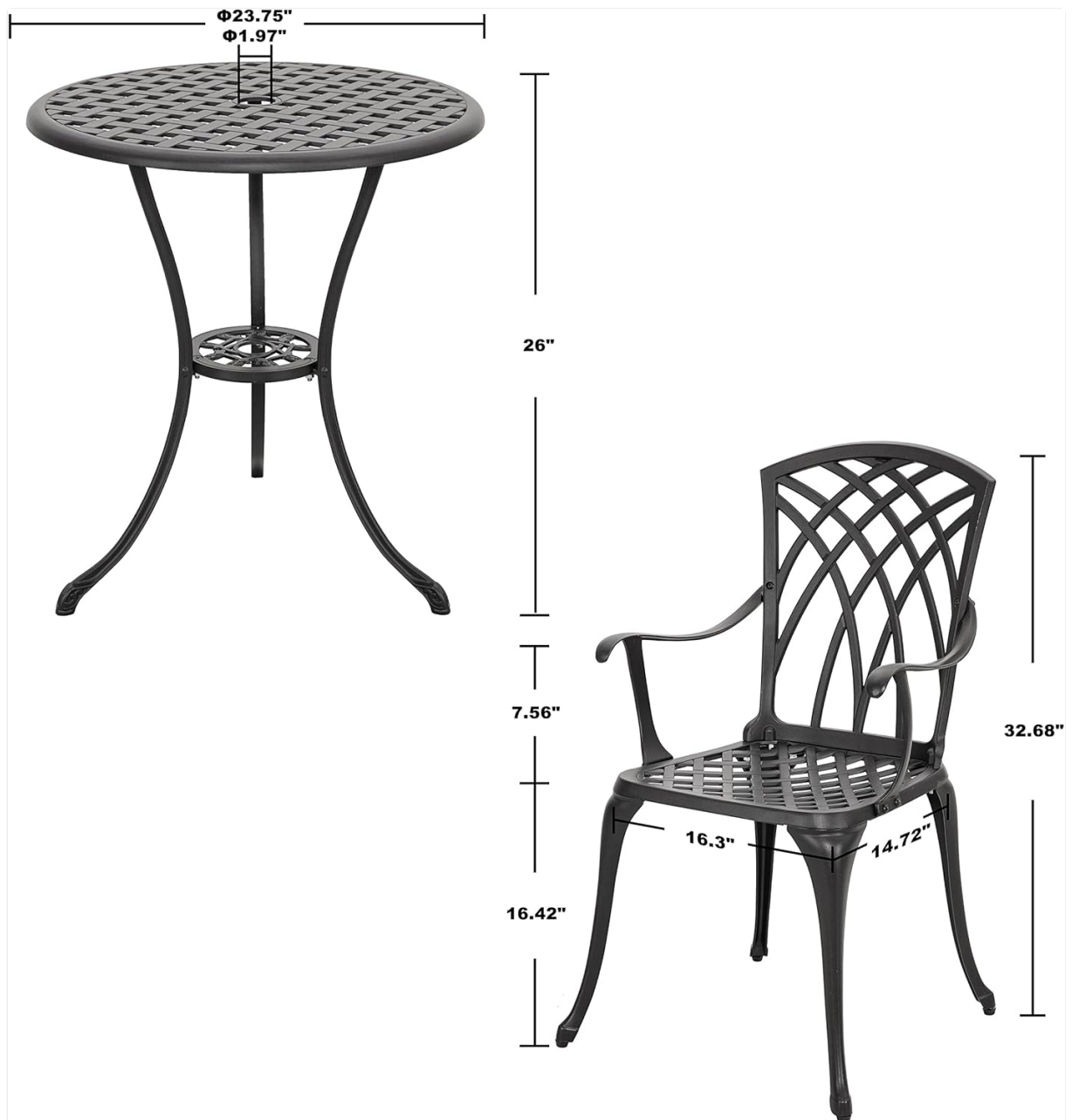
Image 5.2: Features of the chair including a concave seat for comfort, a high backrest for support, and ergonomic armrests to reduce tension.