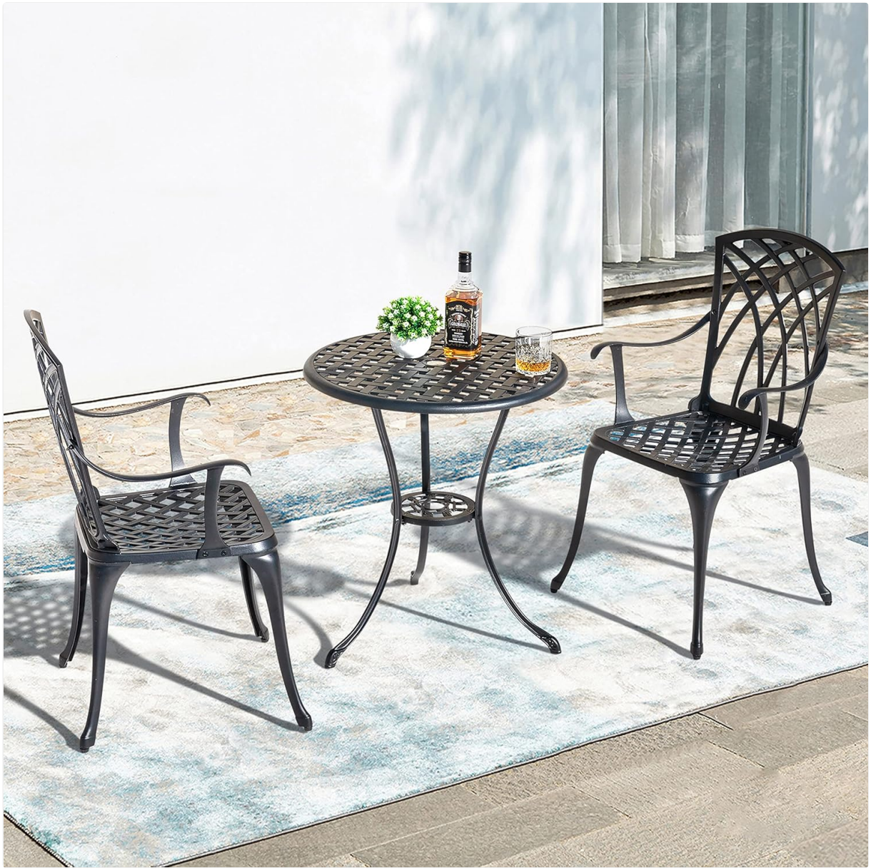
Image 10.2: The bistro set arranged on a balcony, demonstrating its suitability for smaller outdoor spaces.