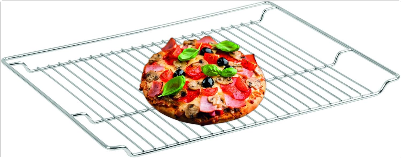
Figure 3: The oven rack supporting a pizza during baking.