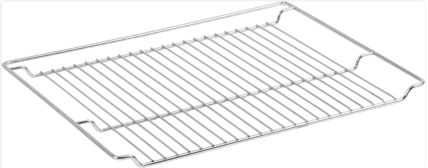
Figure 1: The ICQN Universal Oven Rack, a chrome-plated wire grid designed for oven use.

The ICQN Universal Oven Rack is designed to be a versatile accessory for your oven, suitable for various baking and cooking needs. It is constructed from chrome-plated material, offering durability and heat resistance up to 600°C (1112°F).