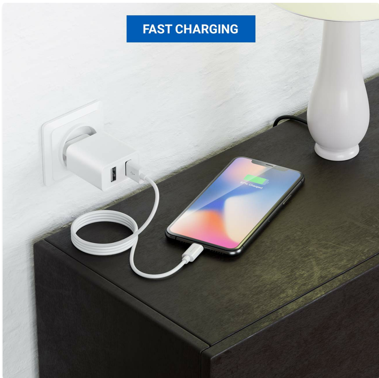
Image 5.1: An iPhone connected to a wall adapter via the deleyCON Lightning cable for charging.