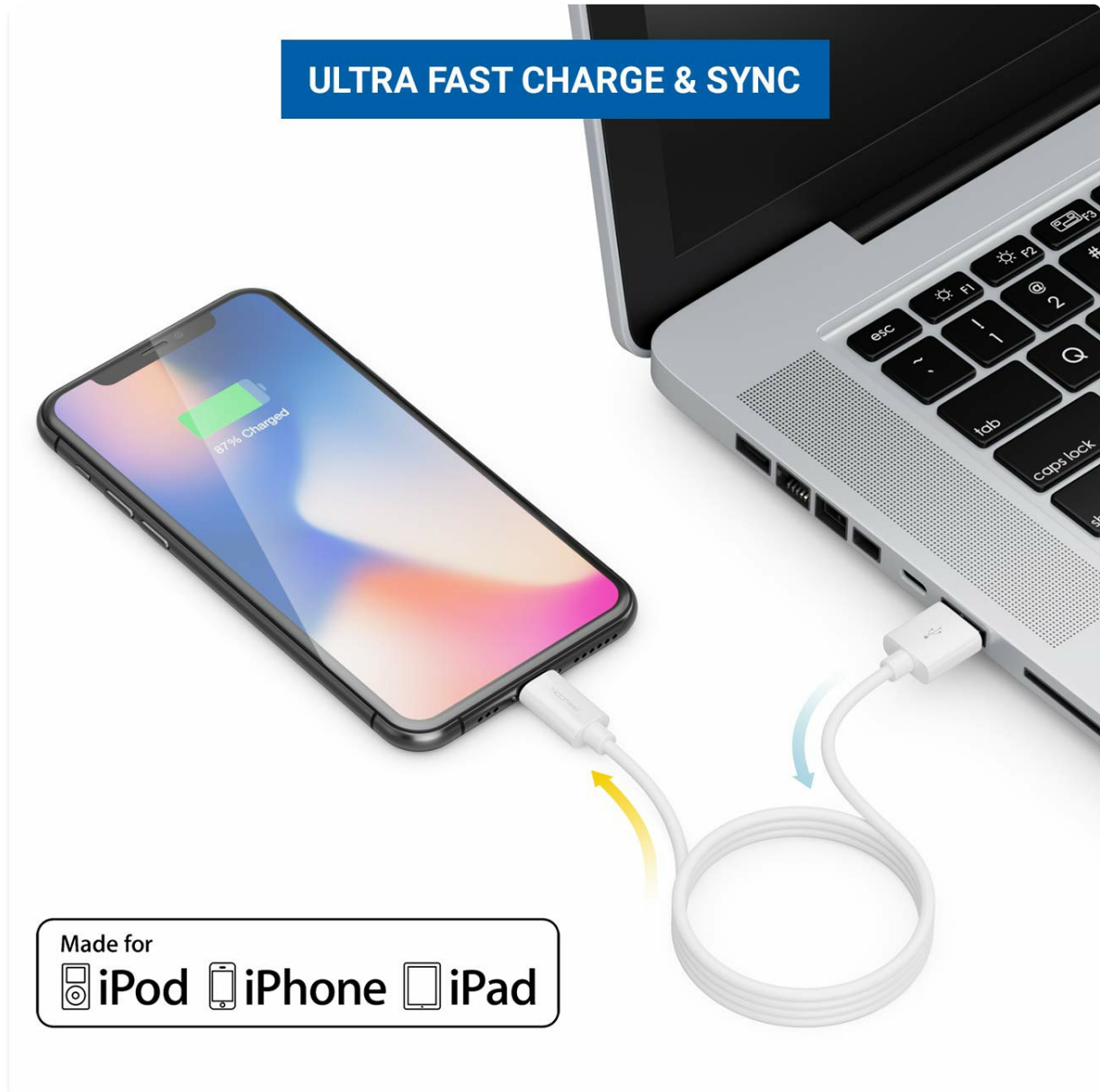
Image 4.1: The deleyCON cable connecting an iPhone to a laptop for charging and data transfer.