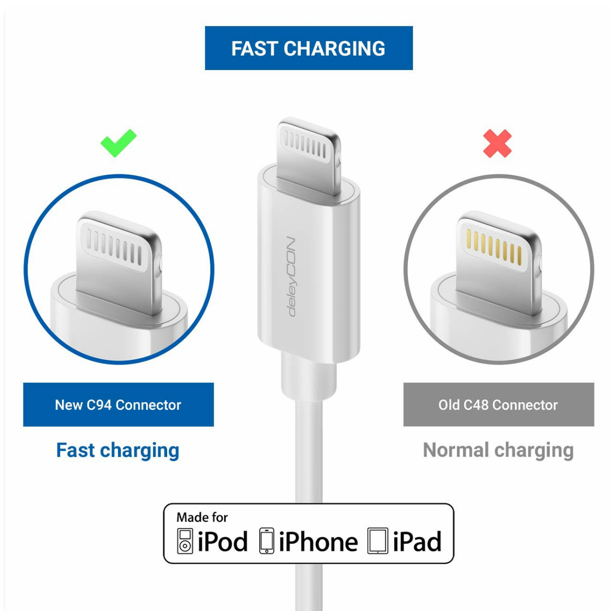
Image 5.2: Visual comparison highlighting the New C94 Connector for fast charging versus the Old C48 Connector for normal charging.