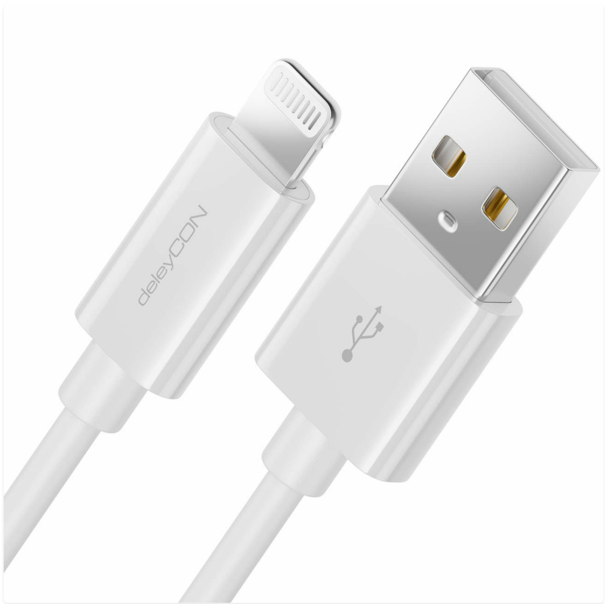
Image 1.1: The deleyCON 2m Lightning to USB-A cable, showcasing both the Lightning and USB-A connectors.