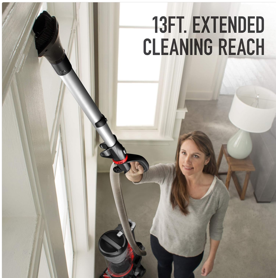
Figure 6: The extended cleaning reach facilitates cleaning of elevated or distant surfaces.

The vacuum offers 13 feet of extended reach with the cleaning wand, allowing you to clean high or distant areas.