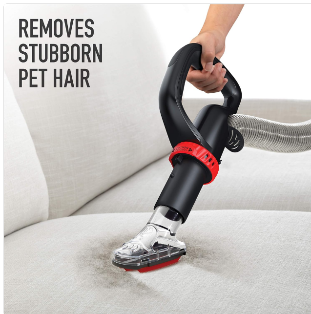
Figure 5: The pet upholstery tool efficiently removes stubborn pet hair from fabric surfaces.

The vacuum offers 13 feet of extended reach with the cleaning wand, allowing you to clean high or distant areas.