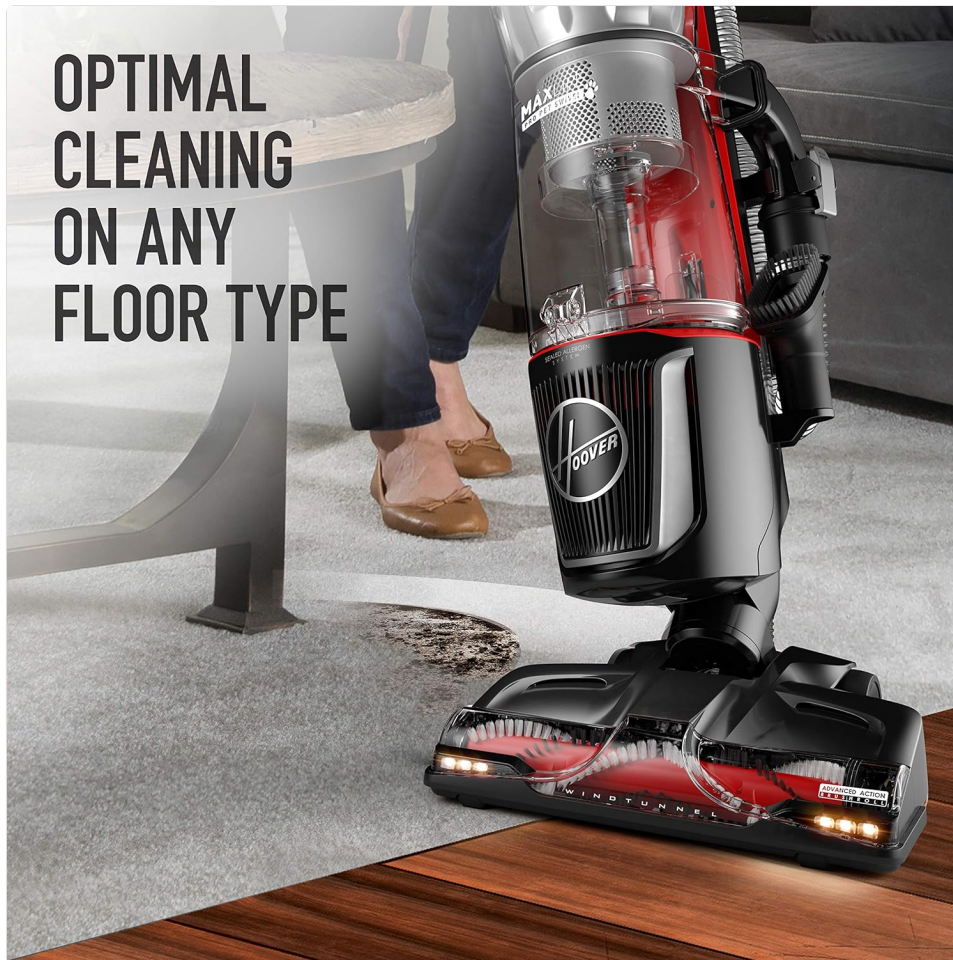
Figure 2: The vacuum effectively cleans various floor types, including carpet and hard surfaces.

The Advanced Action brush roll is designed for effective cleaning on both carpets and hard floors. Adjust the brush roll setting as needed for optimal performance on your specific floor type.