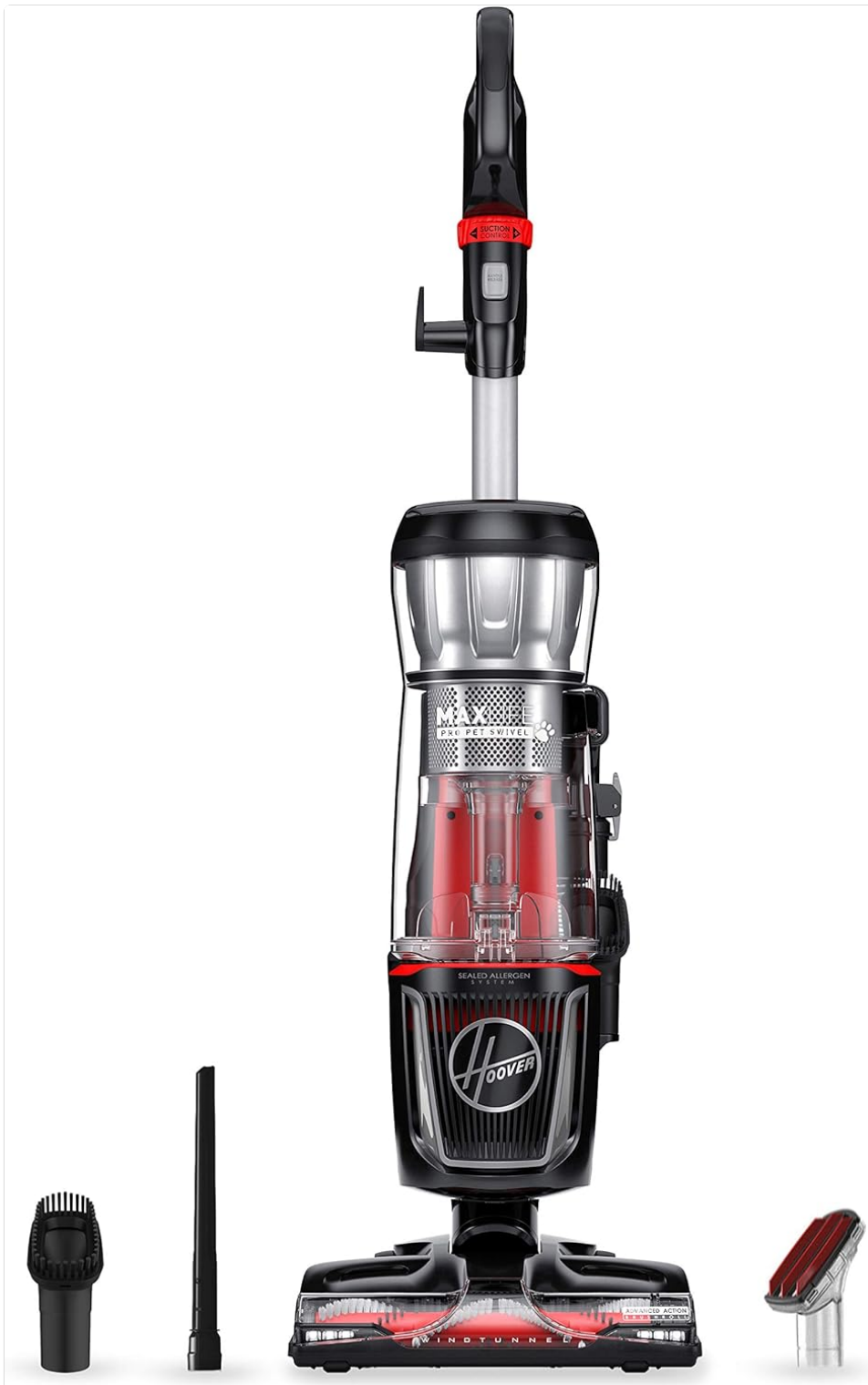
Figure 1: Fully assembled Hoover MAXLife Pro Pet Swivel vacuum cleaner with its included accessories.