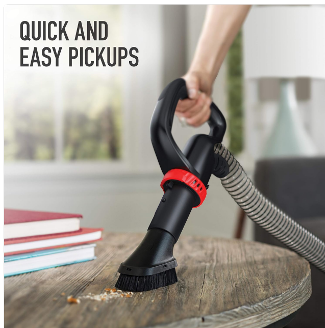
Figure 4: The dusting brush is effective for quick pickups on various surfaces.