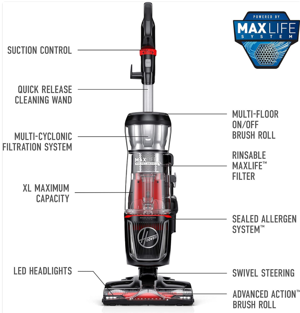
Figure 7: Key components of the Hoover MAXLife Pro Pet Swivel vacuum, including the rinsable MAXLife filter and sealed allergen system.

The MAXLife filtration system includes a sealed allergen HEPA filter. For best performance, regularly check and clean the rinsable MAXLife filter. Refer to the diagram below for filter location.