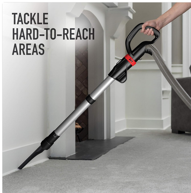
Figure 3: The crevice tool allows access to narrow and hard-to-reach areas.