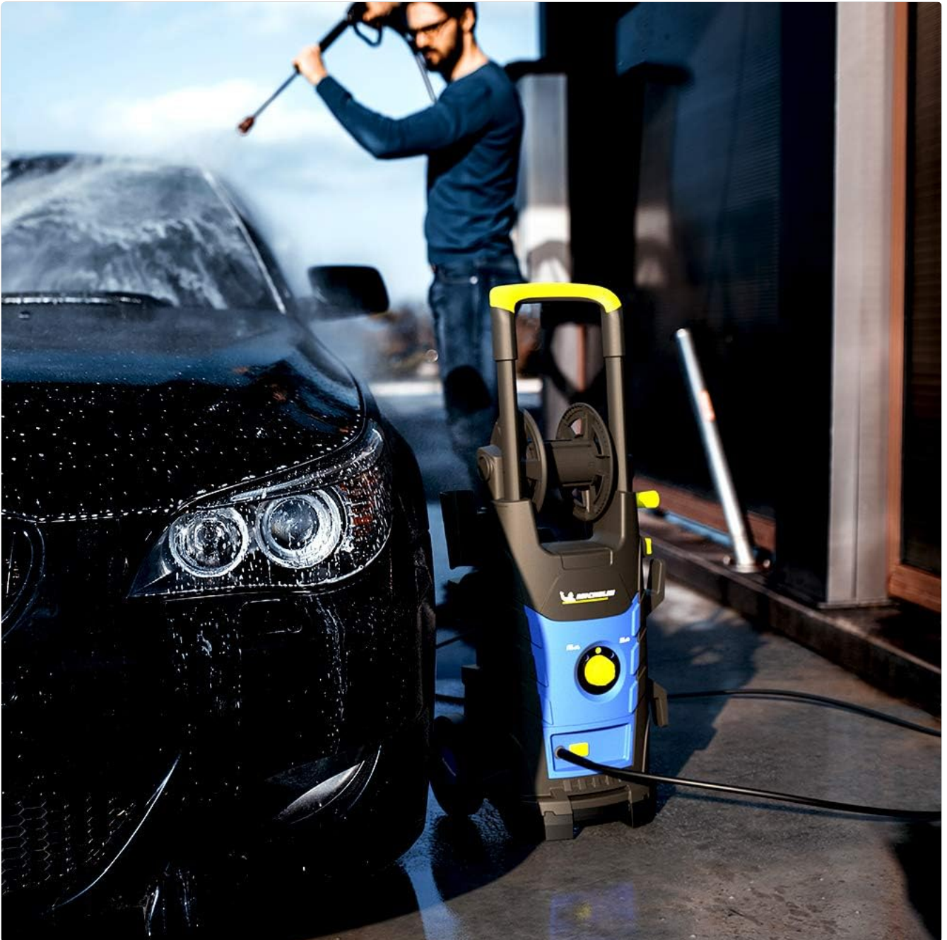
Image: The pressure washer being used to clean a car, demonstrating its application for vehicle washing.