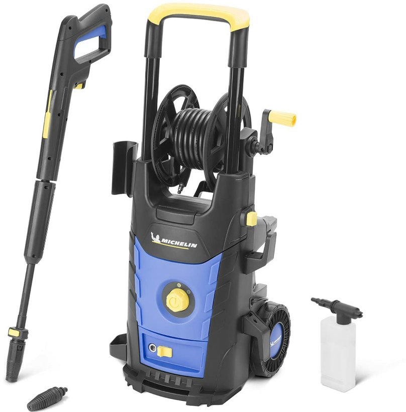
Image: The Michelin MPX17EH pressure washer unit, featuring a hose reel, spray gun, and detergent bottle.