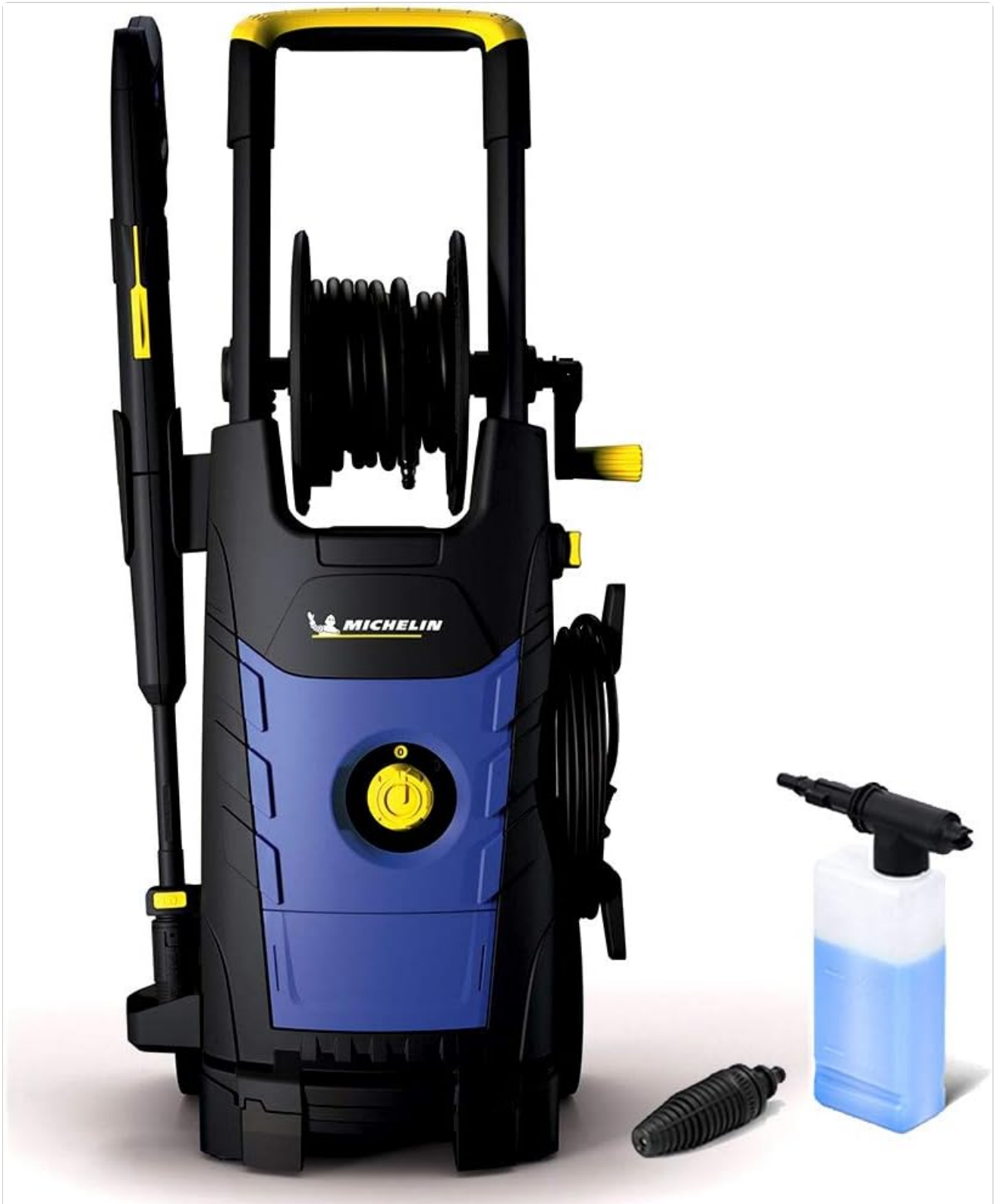
Image: The pressure washer unit displayed with its included accessories, ready for connection.