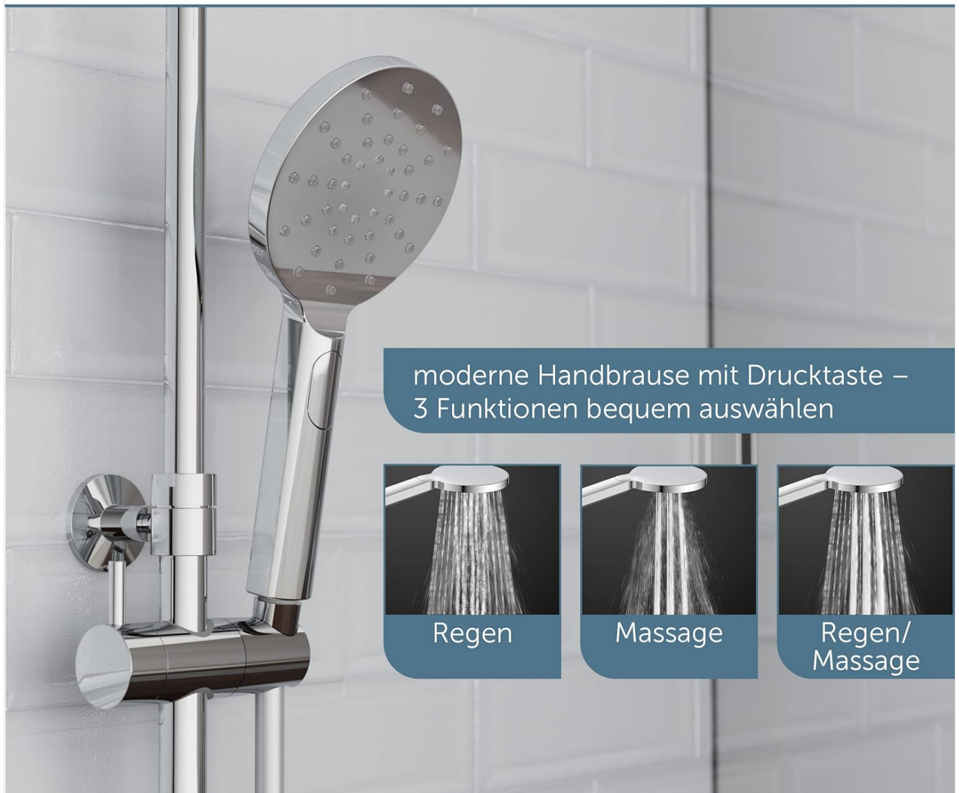
Image: The modern hand shower allows selection of three functions: Rain, Massage, and a combination of Rain/Massage, via a push button.