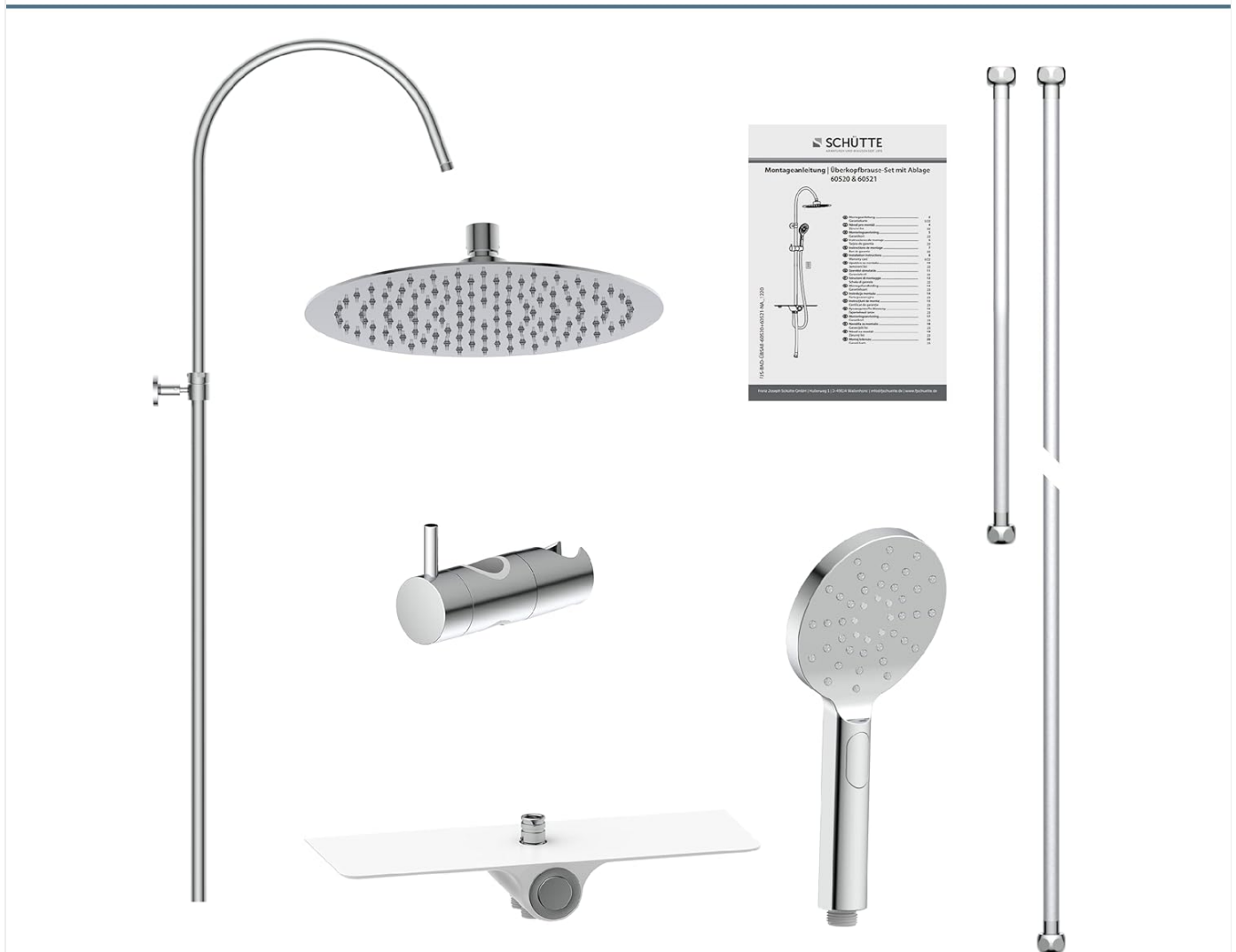
Image: All components included in the SCHÜTTE AQUASTAR 60520 Shower System package.