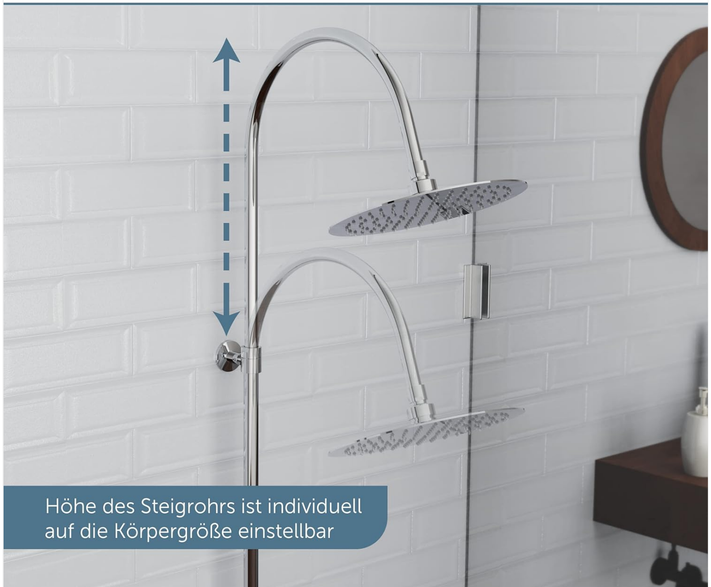
Image: The height of the shower column is individually adjustable to suit user height.