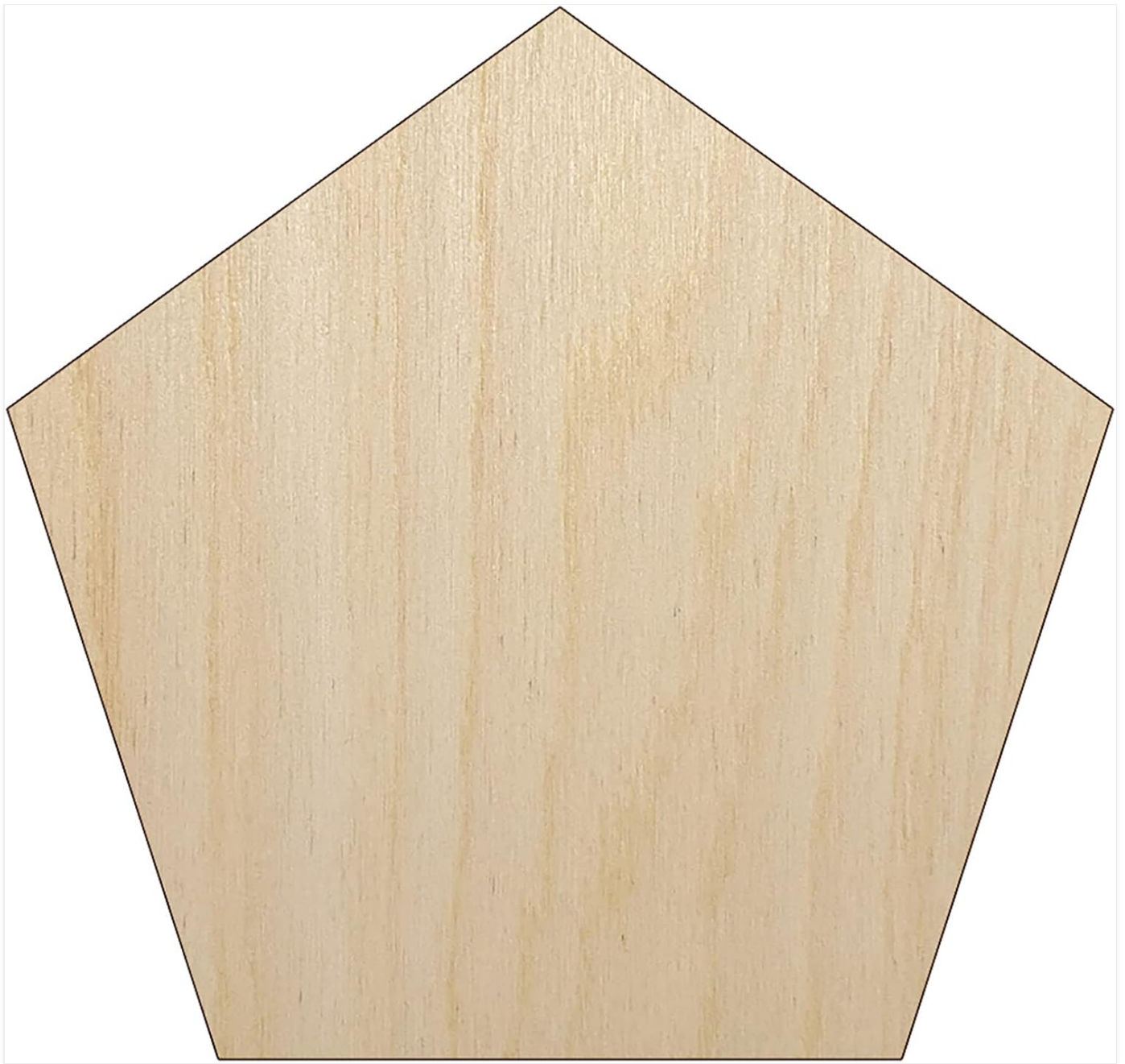
Image 1: The Sniggle Sloth Pentagon Unfinished Wood Shape. This image displays the natural wood grain and precise laser-cut edges of the pentagon shape.