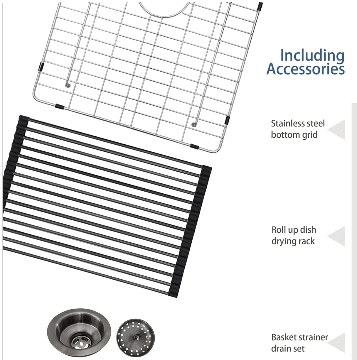
Figure 4: Included Accessories