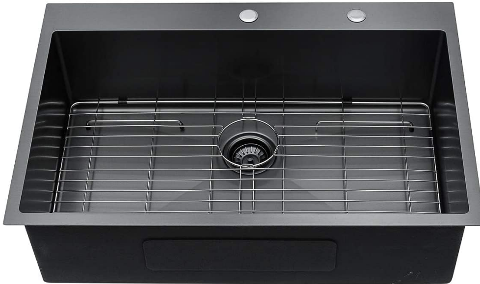
Figure 5: Nano Coating and Drainage Features

Protecting the kitchen sink from scratches