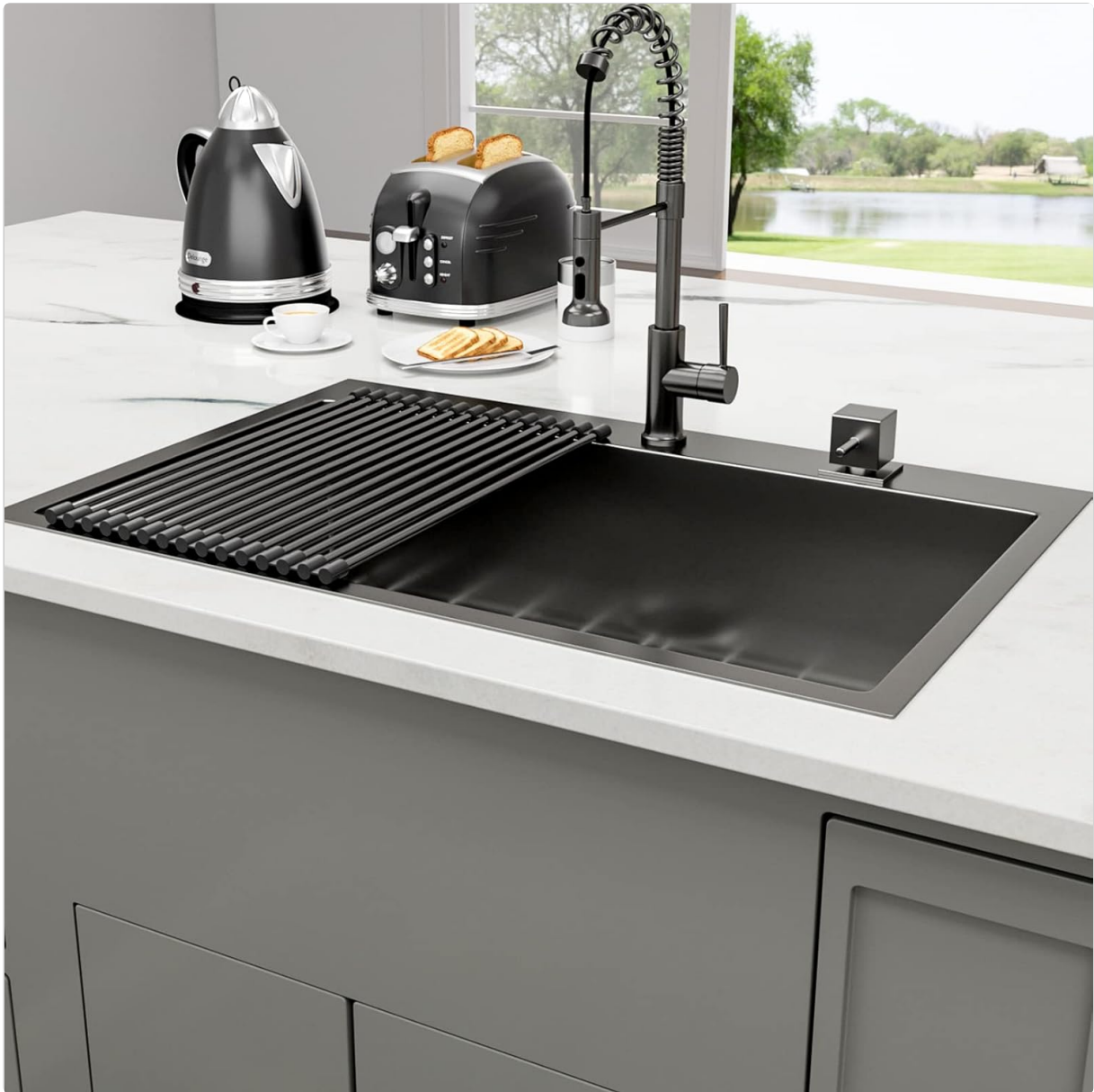
Figure 3: Sink with Included Accessories