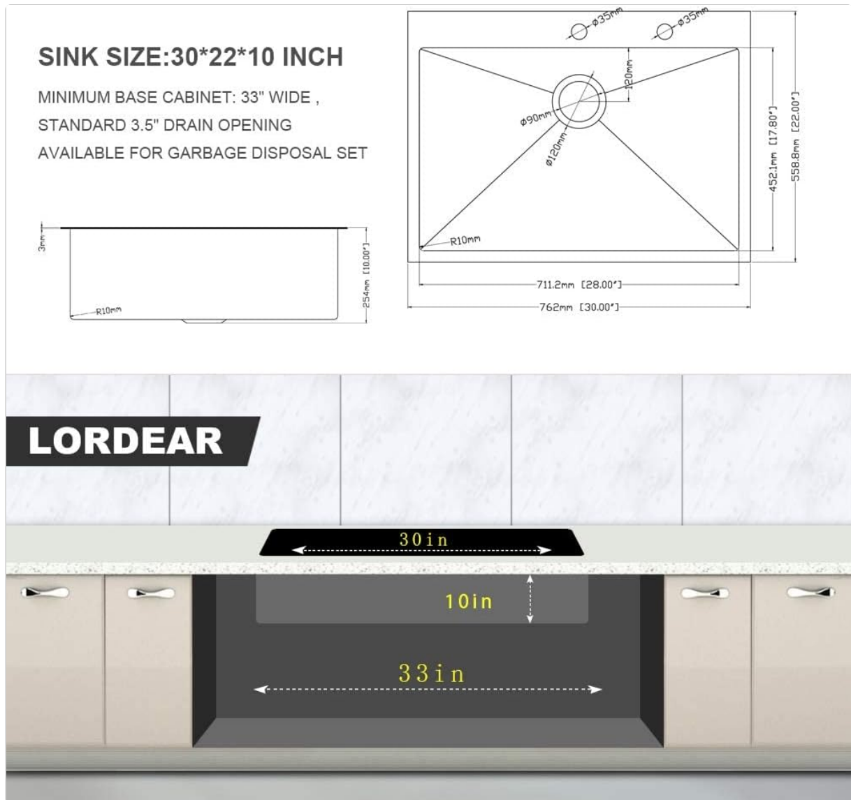
Figure 1: Sink Dimensions and Cabinet Requirements