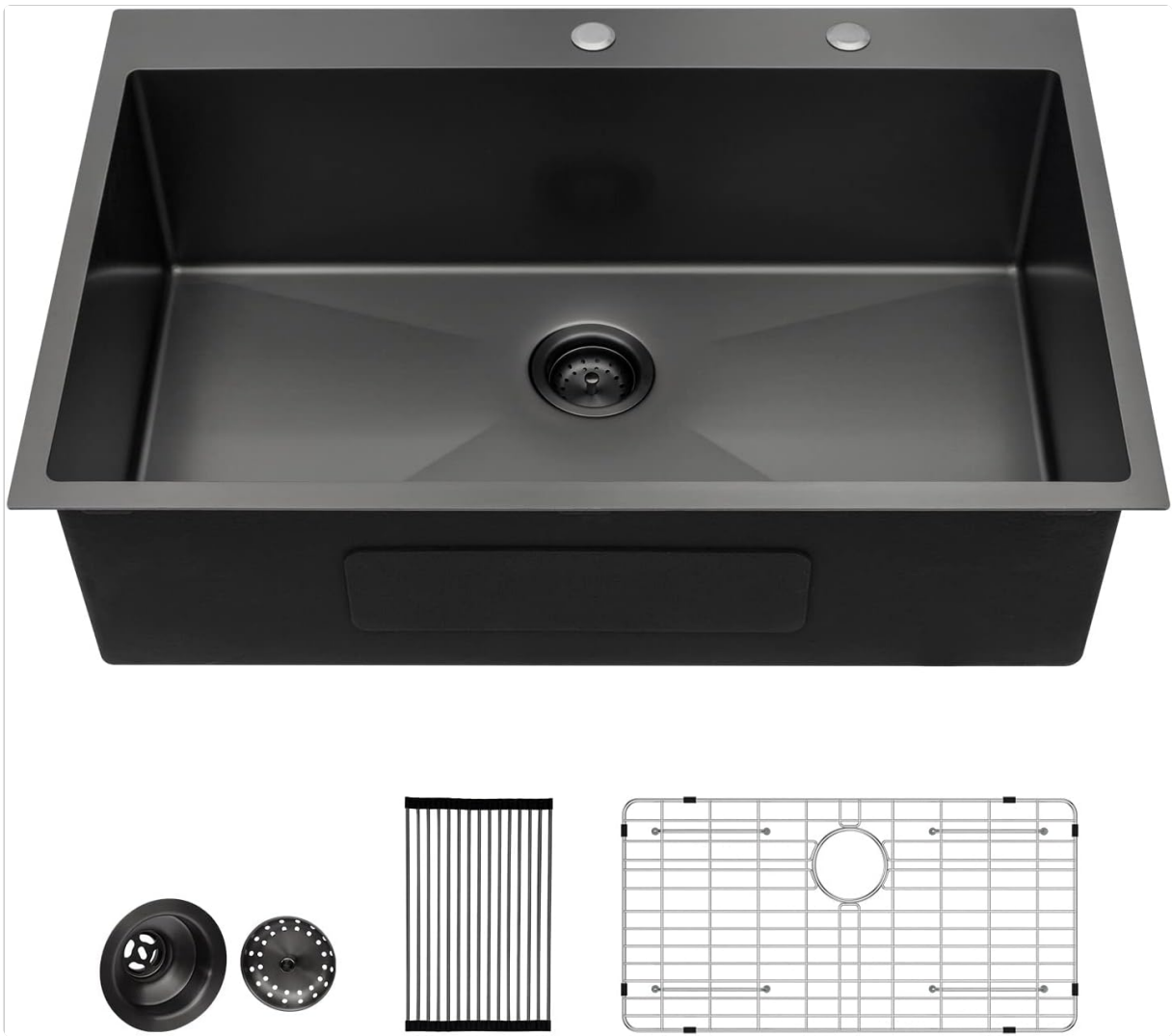
Figure 2: Lordear 30x22 Inch Black Drop-In Kitchen Sink