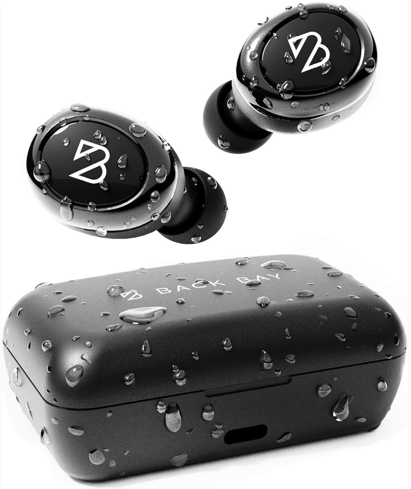
Image: Back Bay Audio Duet 50 Pro Earbuds and Charging Case, showcasing their sweatproof design.