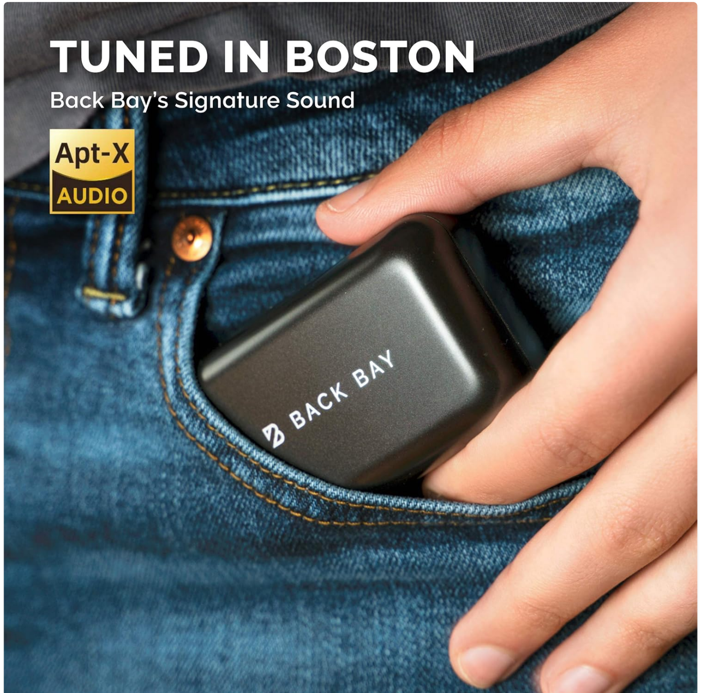
Image: The Duet 50 Pro earbuds and charging case, emphasizing their impressive 130-hour battery life.

Before first use, fully charge your Duet 50 Pro earbuds and charging case. The case provides up to 130 hours of total playtime. Use the included USB-C cable to charge the case.