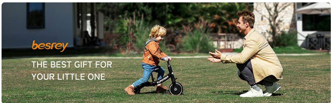
Figure 4: Visual representation of the Sliding Trike (10m-2yrs), Pedal Trike (2yrs-3yrs), and Balance Bike (3yrs-4yrs) modes.

Video 1: Official besrey video demonstrating the 5-in-1 Toddler Bike in various modes, including tricycle and balance bike, for children aged 1-3 years. This video highlights the versatility and ease of transformation.