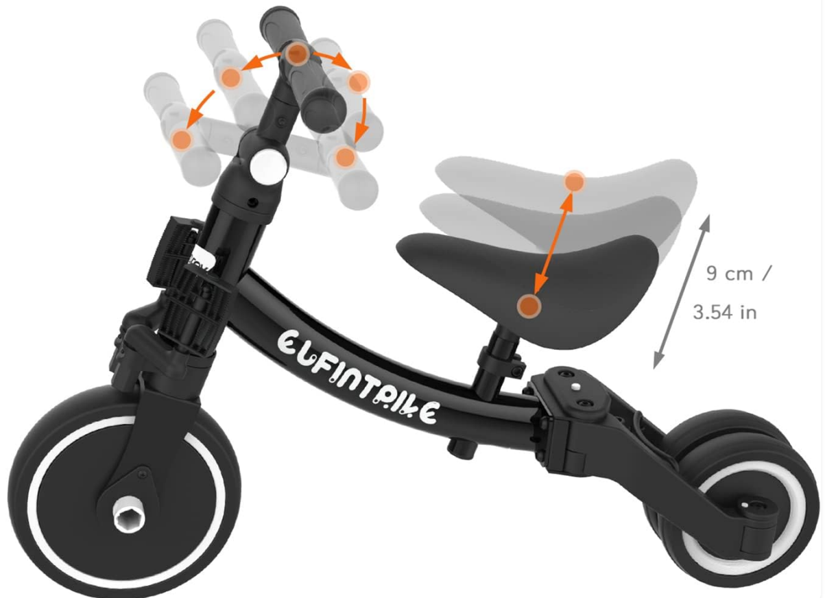
Figure 5: Adjustable seat height and handlebar angle suitable for kids of different heights and ages.

Suitable for kids of different heights and ages