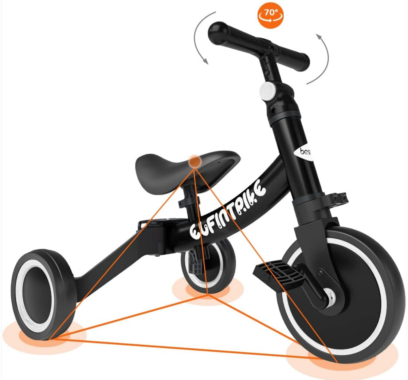
Figure 2: Stable Carbon Steel Triangular Design and Safety Limited 70° Steering for enhanced child safety.

Stable Carbon Steel Triangular Design & Safty Limited 70° Steering