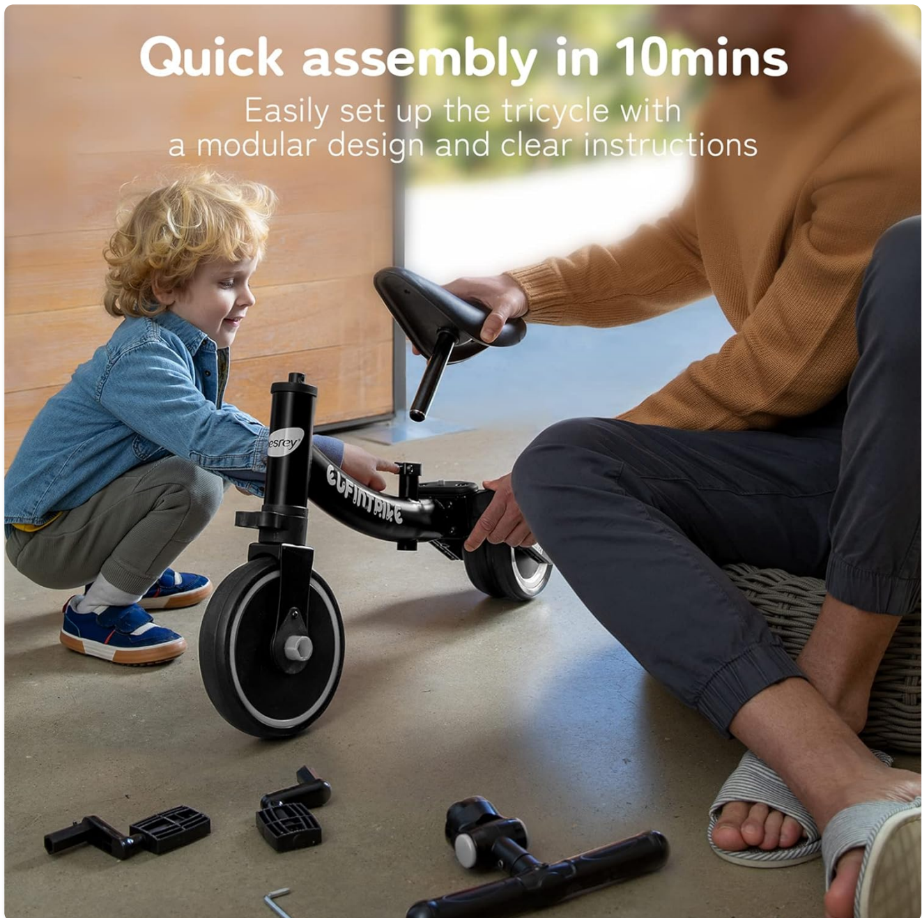
Figure 3: Quick assembly of the tricycle with a modular design, allowing for easy setup.