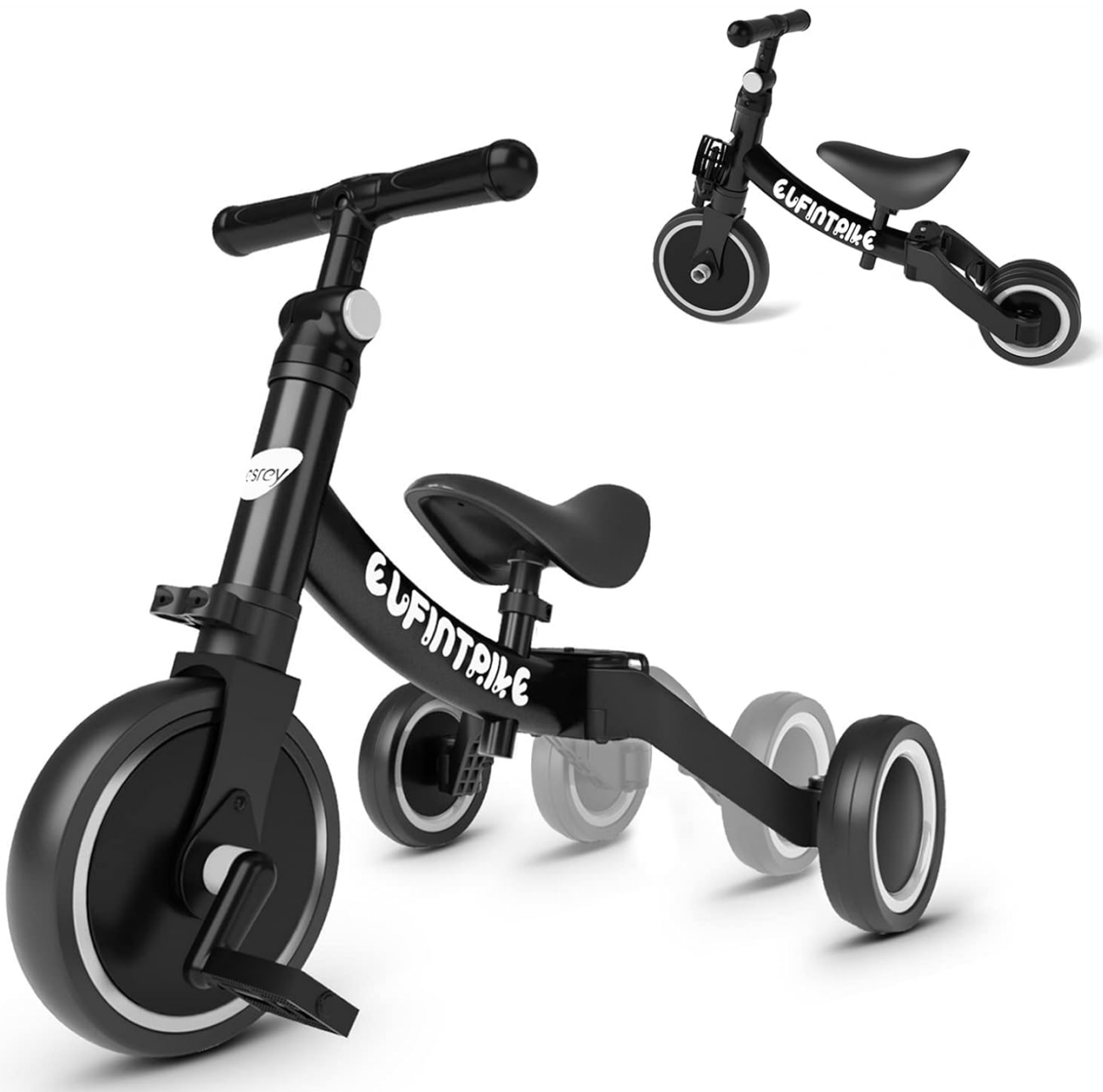
Figure 7: The besrey 5 in 1 Toddler Bike in its black color variant.