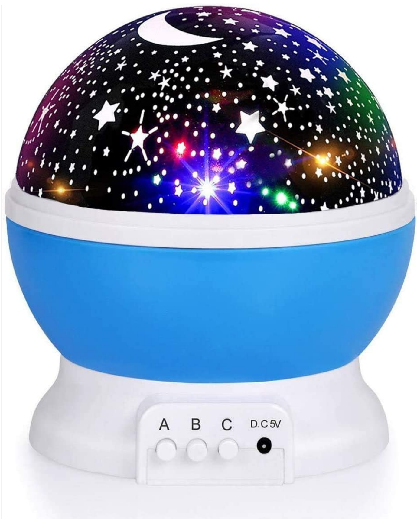
Image: The RICTLY Star Projector Night Light, featuring a blue base and a dome designed for projecting stars and moons.