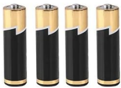
Powered by 4*AAA batteries(not included)