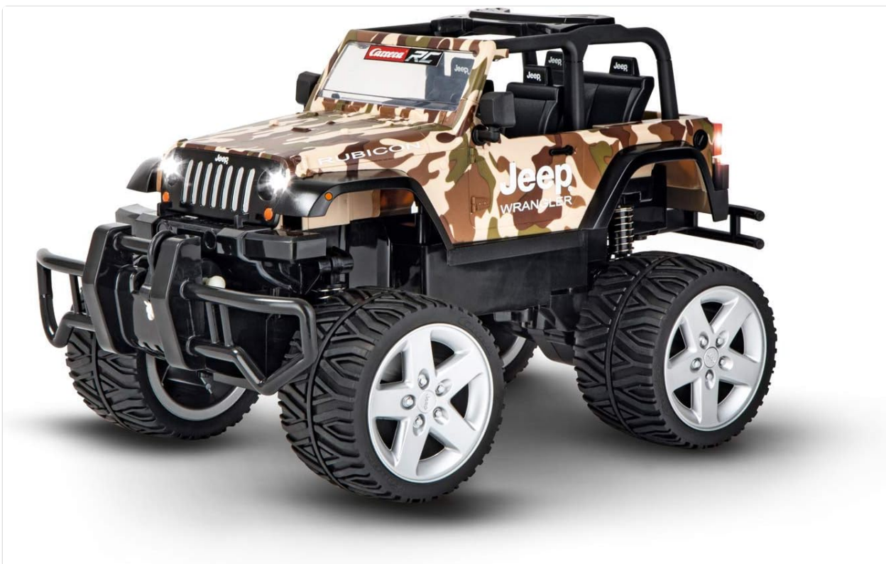
Image 1.1: The Carrera RC Jeep Wrangler Rubicon in camouflage design. This image displays the front and side of the vehicle, highlighting its rugged tires, front bumper, and detailed bodywork.

Thank you for choosing the Carrera RC 2.4GHz Jeep Wrangler Rubicon. This remote-controlled vehicle is designed for off-road adventures, featuring a distinctive camouflage design and robust capabilities. This manual provides essential information for safe operation, setup, maintenance, and troubleshooting.