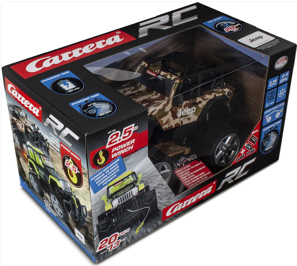
Image 3.1: The product packaging for the Carrera RC Jeep Wrangler Rubicon. This image shows the retail box, which typically displays key features and contents.