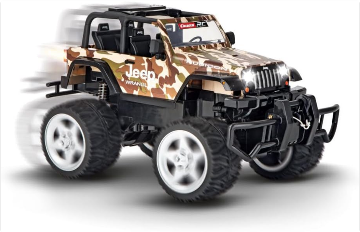
Image 5.1: The Carrera RC Jeep Wrangler Rubicon vehicle shown in motion, demonstrating its dynamic capabilities and speed.