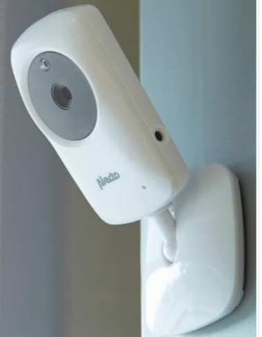
Image: The Alecto DVM-64 camera unit with a Wi-Fi signal icon, illustrating its long range capabilities of up to 50m indoors and 300m outdoors.