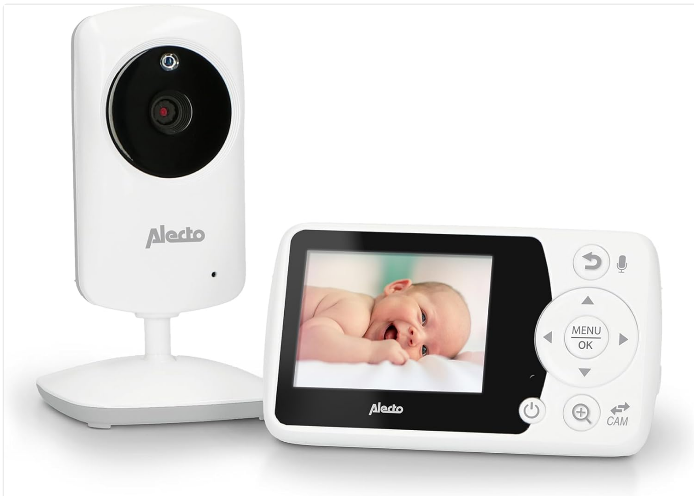
Image: The Alecto DVM-64 baby monitor system, showing the white camera unit on the left and the parent monitor unit with a screen displaying a baby on the right.

The Alecto DVM-64 Wireless Baby Monitor provides a secure and reliable way to monitor your baby. This system includes a baby unit (camera) and a parent unit (monitor) with a large display, offering features such as night vision, two-way communication, temperature monitoring, and lullabies. This manual provides detailed instructions for setting up, operating, maintaining, and troubleshooting your device.