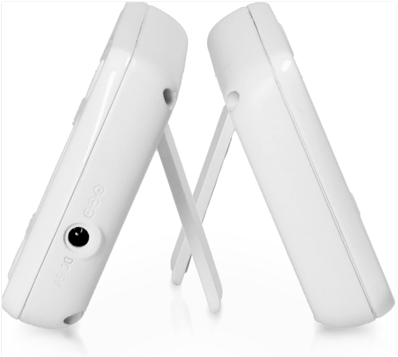
Image: A side view of the Alecto DVM-64 parent unit, highlighting its integrated kickstand for stable placement.