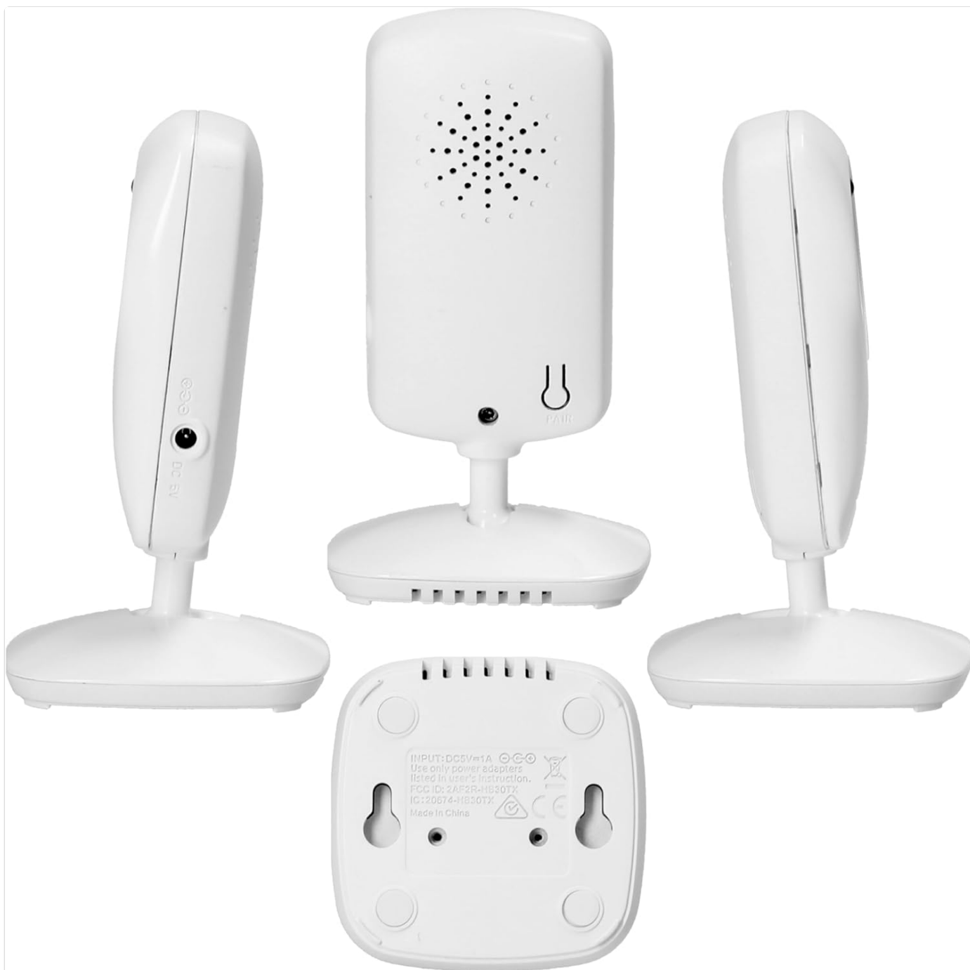
Image: Multiple views of the Alecto DVM-64 camera unit, showing its front, back, side, and bottom with mounting holes.