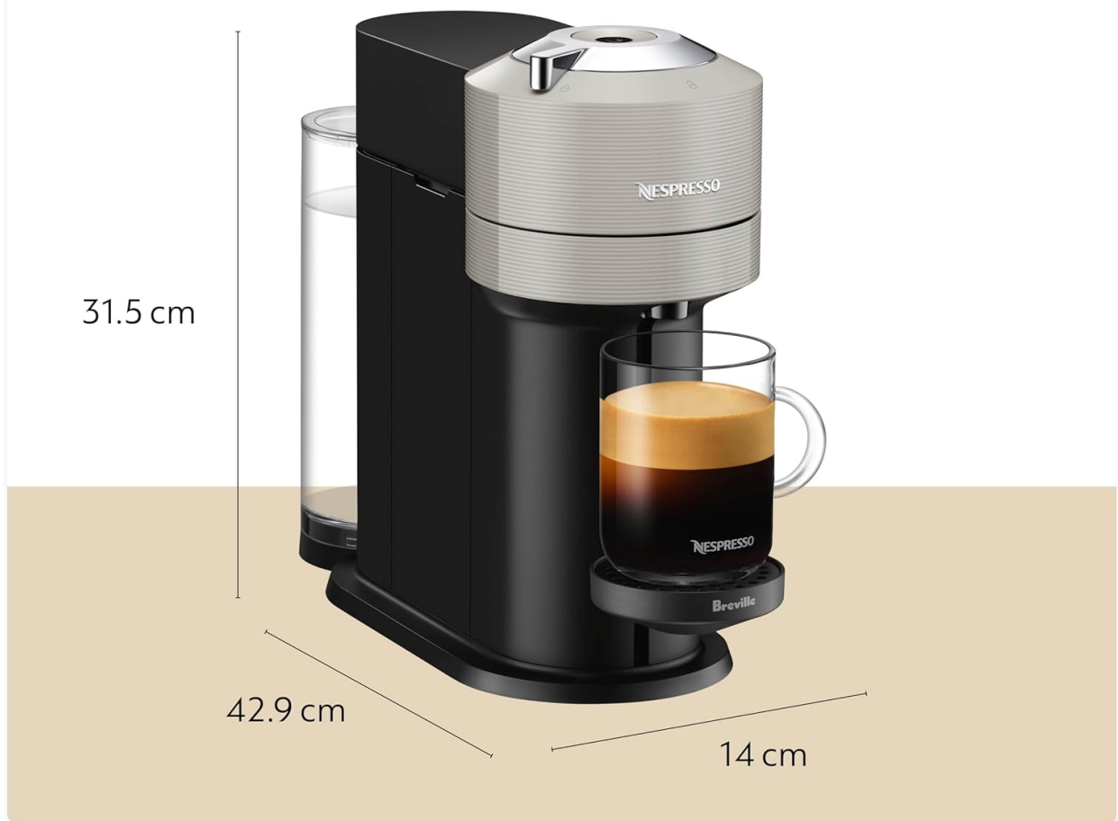
Image: The Nespresso Vertuo Next machine actively brewing coffee into a cup, showing the coffee stream and crema.