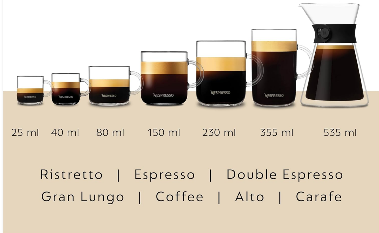
Image: A visual representation of the different coffee and espresso sizes that can be brewed with the Nespresso Vertuo Next machine.