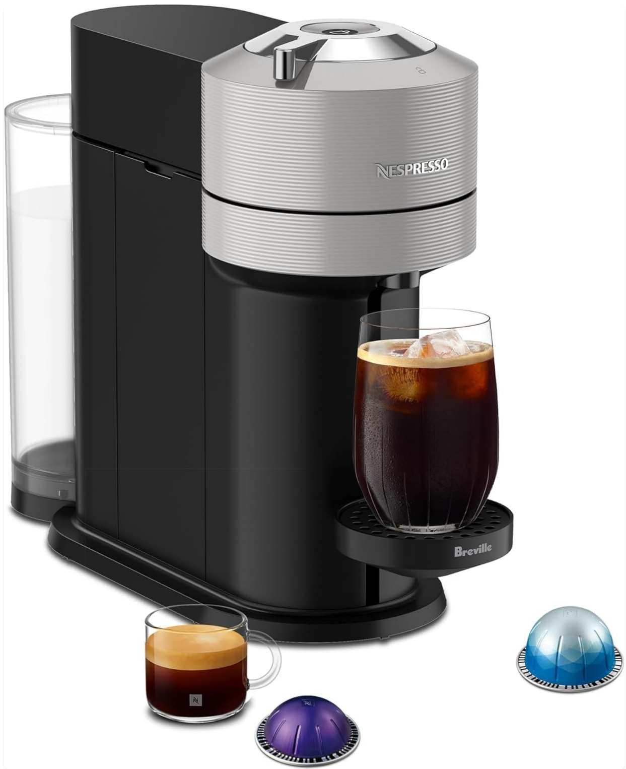
Image: Nespresso Vertuo Next Coffee and Espresso Machine, Gray.