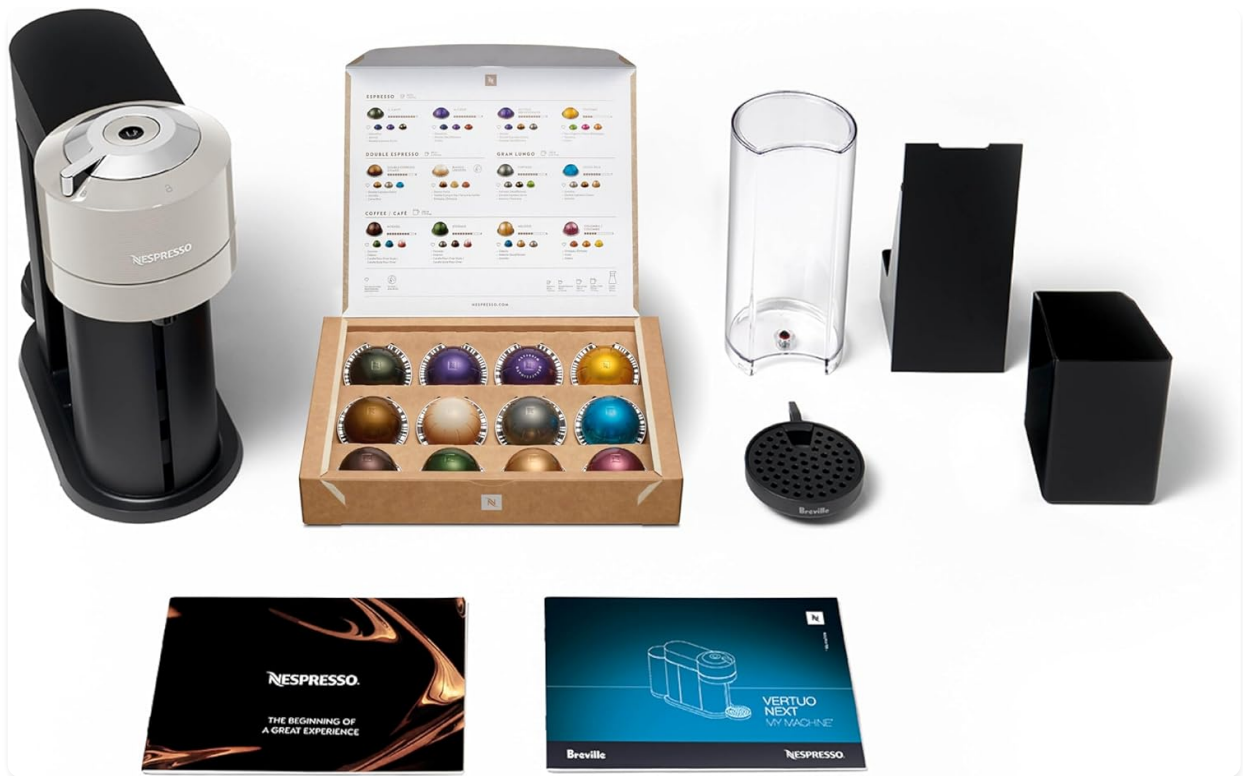
Image: All components of the Nespresso Vertuo Next machine, including the main unit, water tank, drip tray, and a welcome set of capsules.