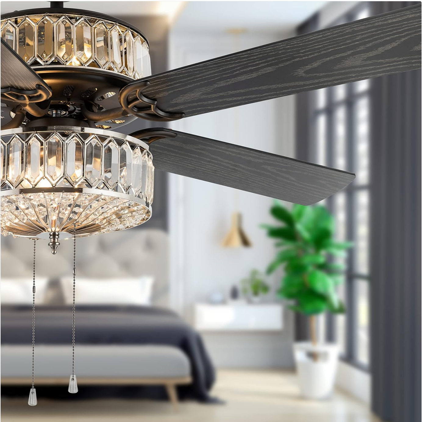
Image: Detailed view of the crystal light fixture, highlighting the faceted K-9 crystals and the chrome silver metal finish.