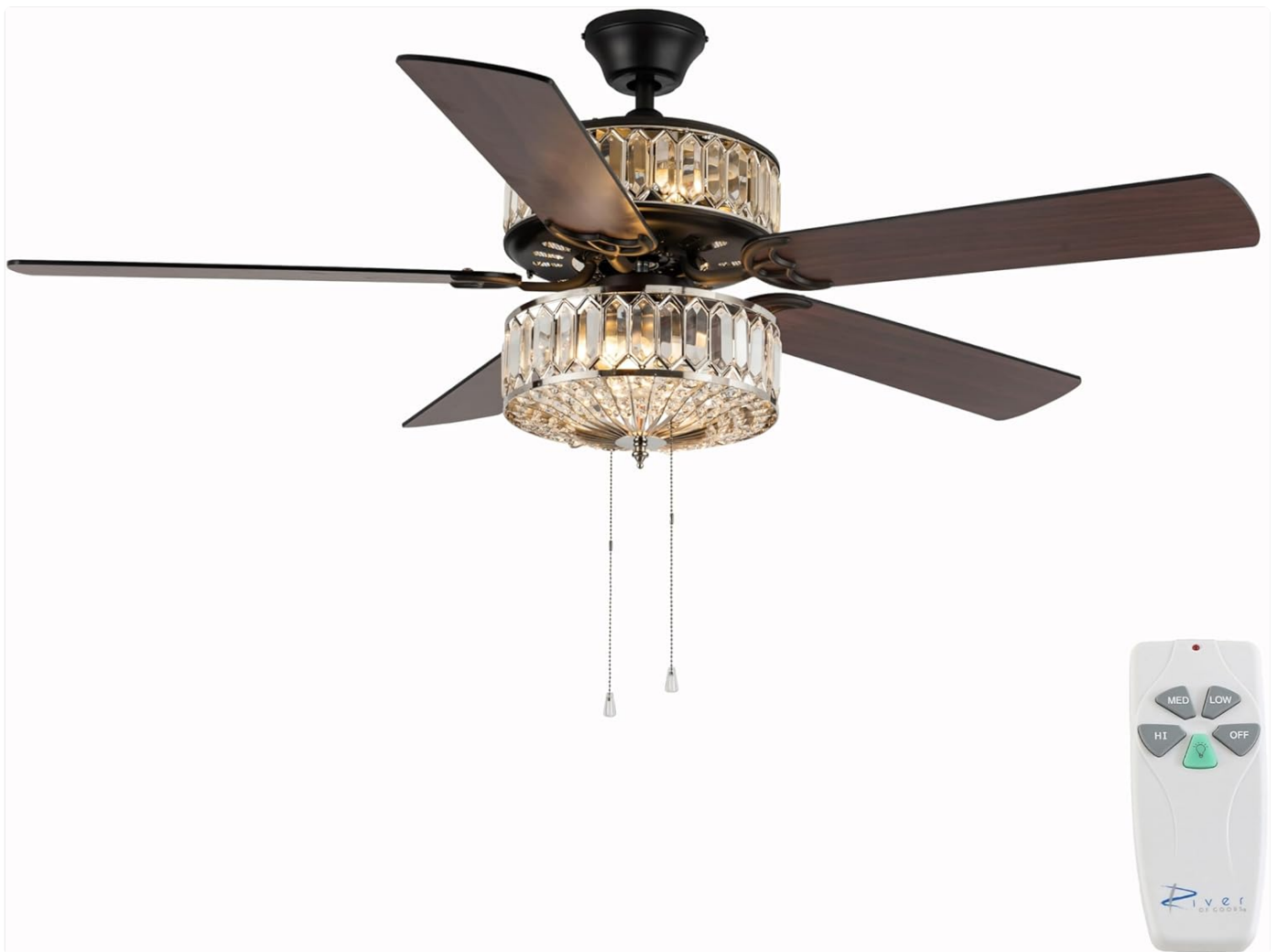
Image: The remote control for the ceiling fan, showing buttons for fan speed (HI, MED, LOW, OFF) and light control.