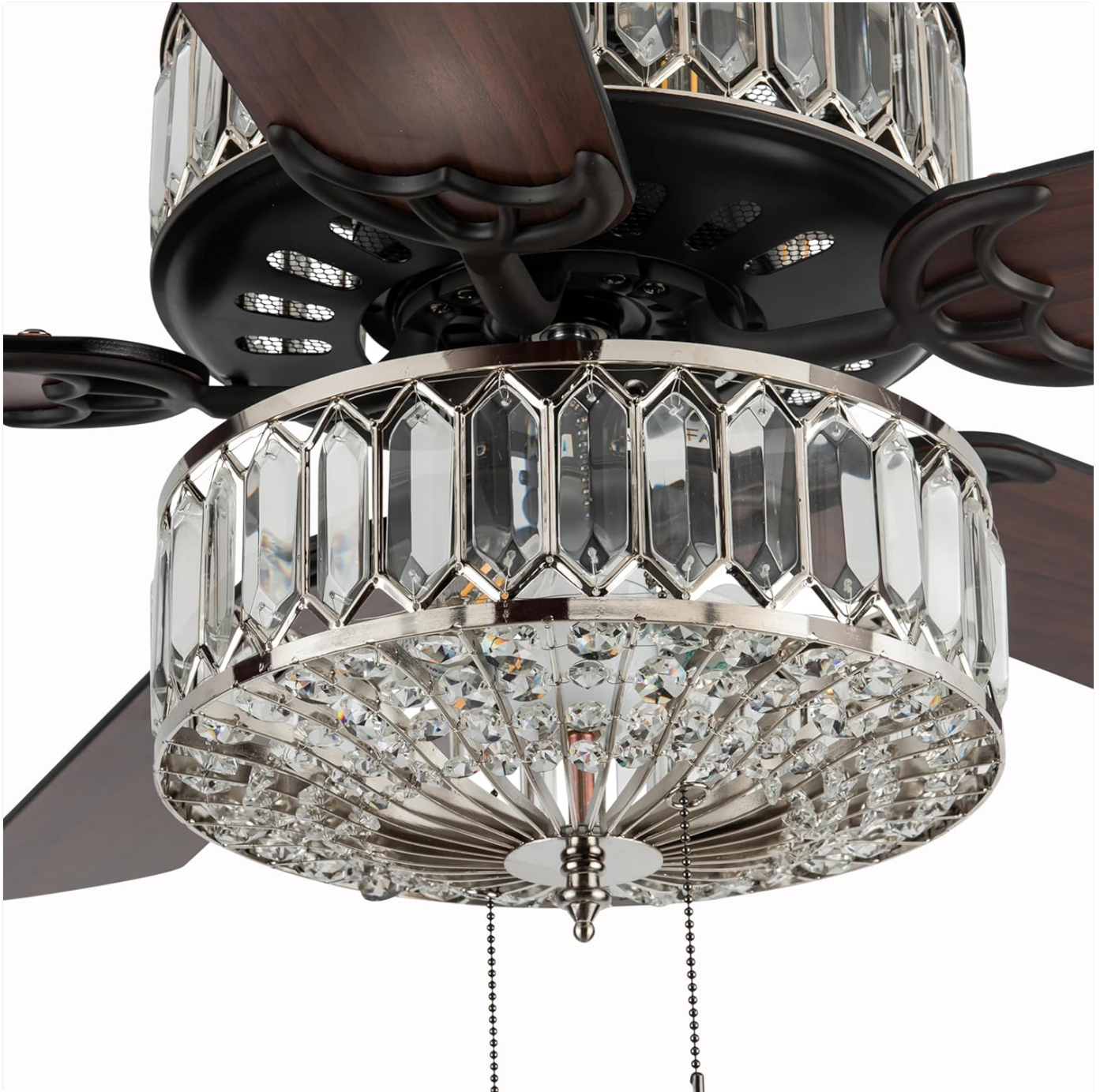
Image: The complete RIVER OF GOODS 52-Inch Glam Crystal Double-Lit LED Ceiling Fan with its remote control, showcasing the crystal light fixture and reversible blades.