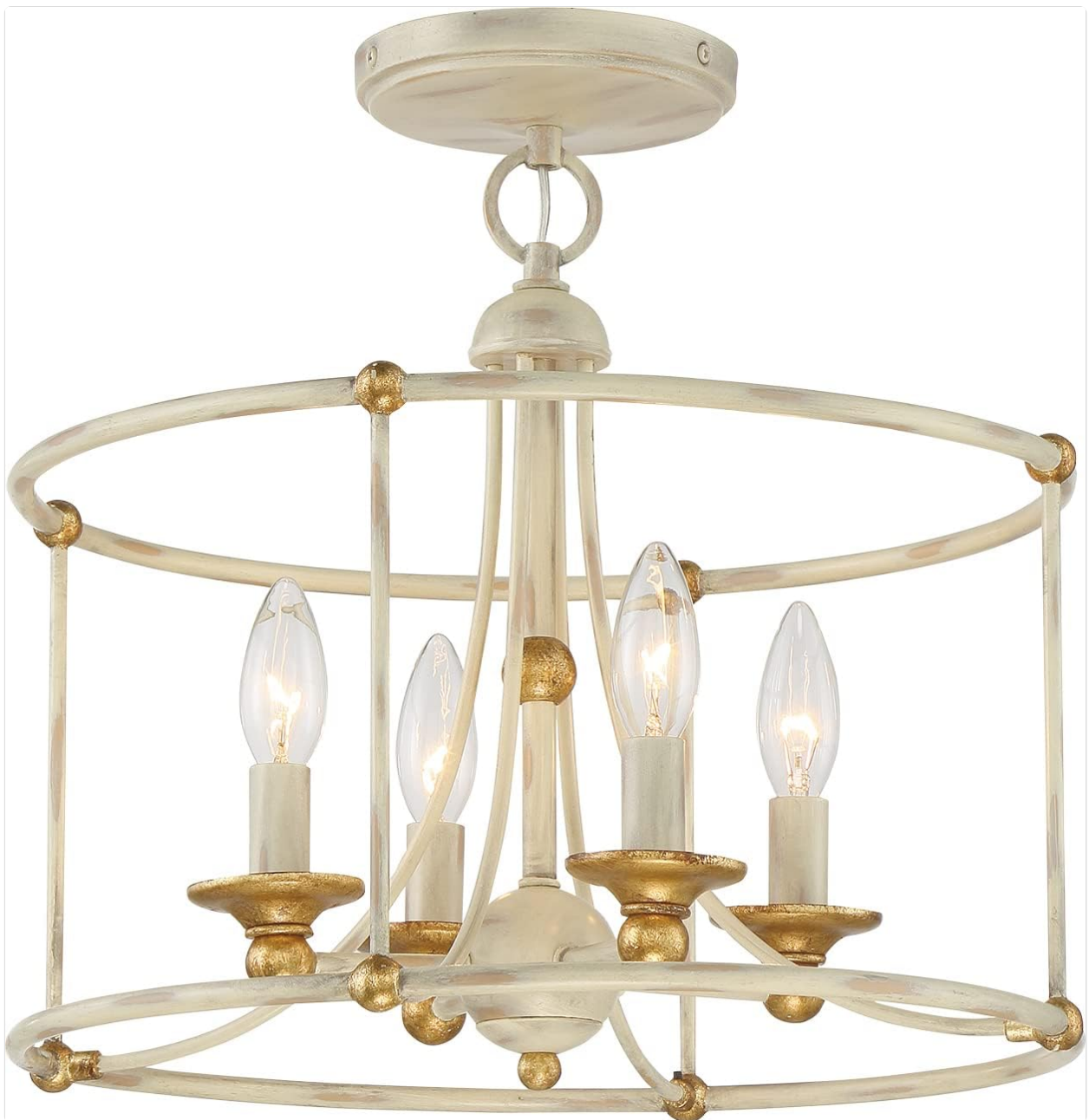
Figure 1: Front view of the Minka Lavery 1049-701 Semi Flush Ceiling Light, showcasing its Farm House White finish and Gilded Gold Leaf details.