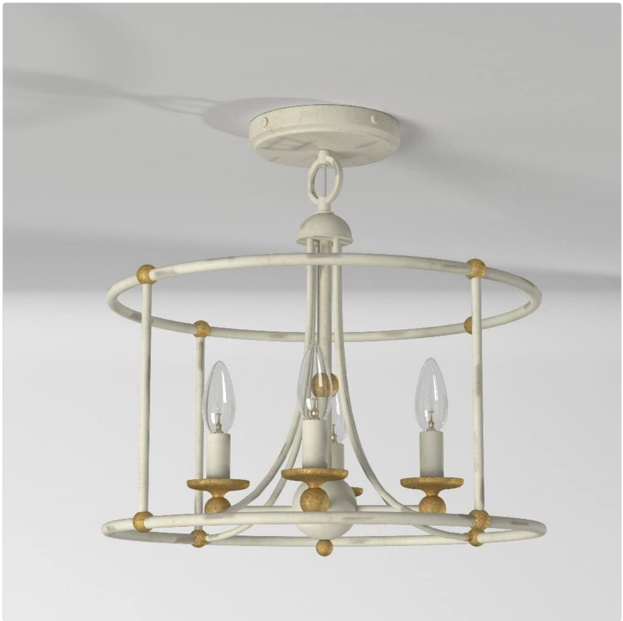
Figure 2: The Minka Lavery 1049-701 Semi Flush Ceiling Light as it appears when installed on a ceiling, providing an overhead perspective.