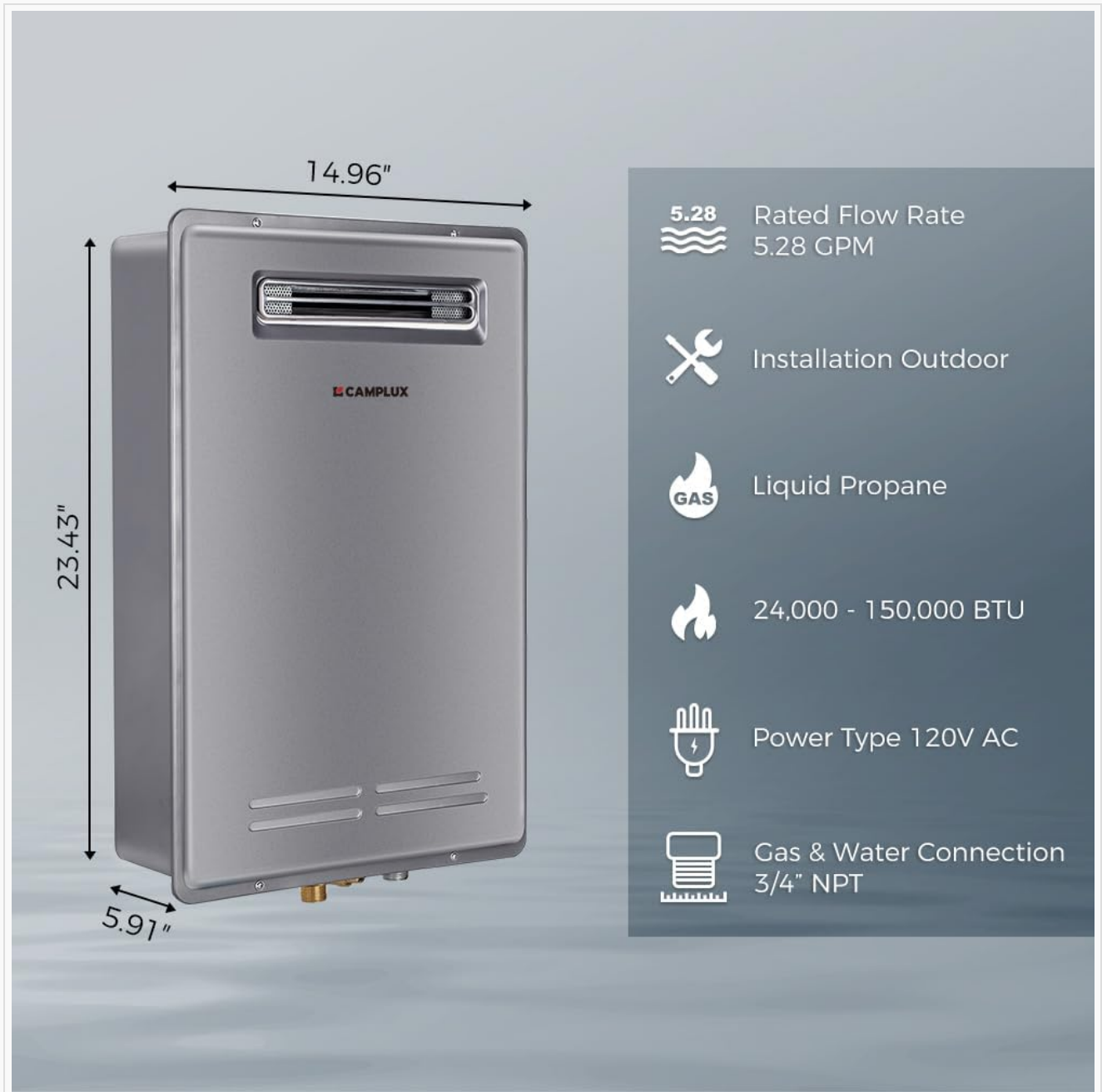
Diagram showing the dimensions and key specifications of the CAMPLUX WA528G-LP water heater.