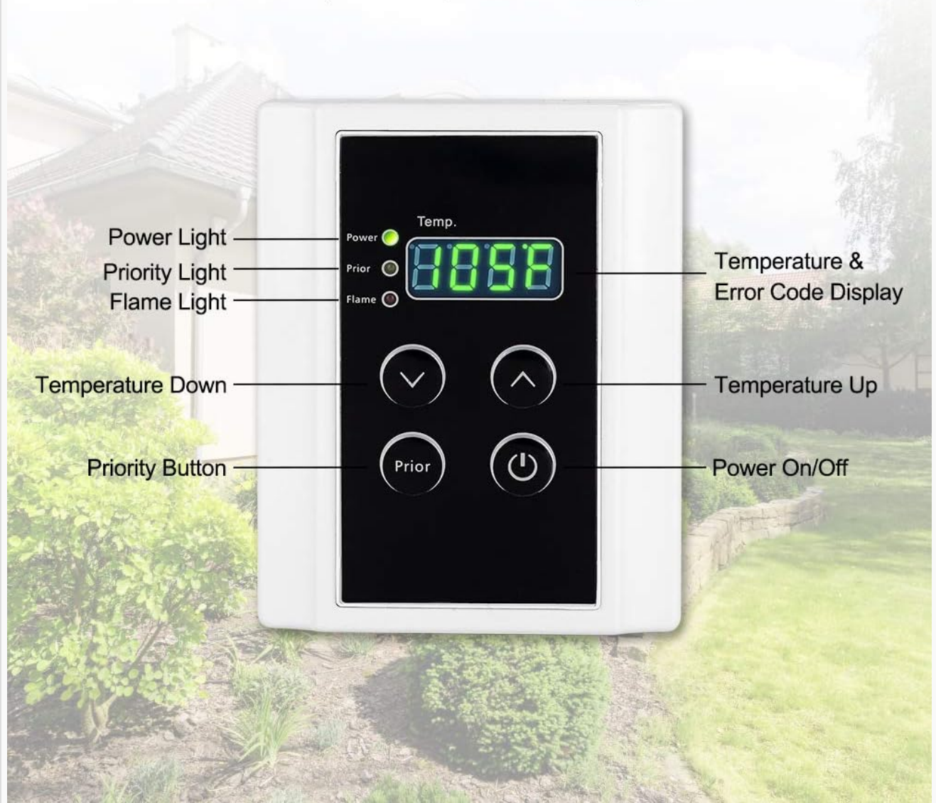
Close-up of the remote control unit for the CAMPLUX WA528G-LP water heater, detailing its functions.