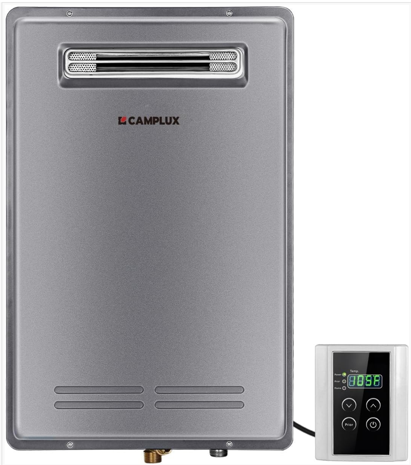
Front view of the CAMPLUX WA528G-LP outdoor tankless water heater in gray, accompanied by its wired remote control unit.