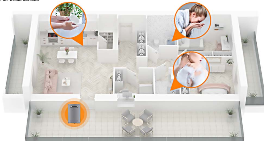
A diagram illustrating the installation process for the CAMPLUX WA528G-LP water heater.

Constant hot water solution for whole families