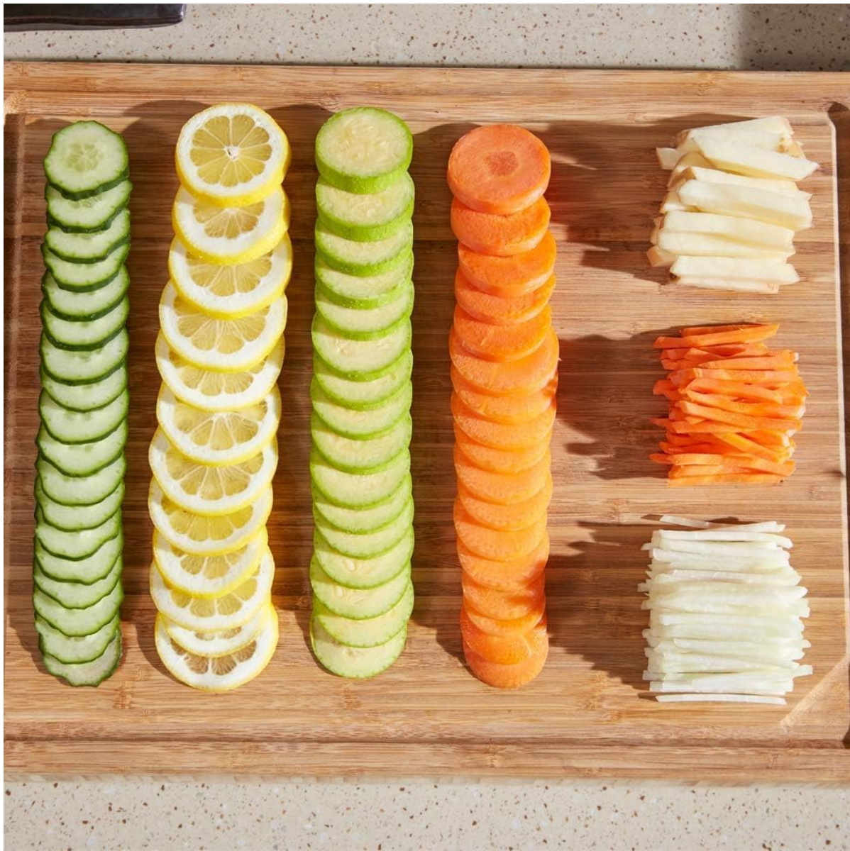
Image 5.3: A display of various vegetables and fruits cut into uniform slices, strips, and dices.