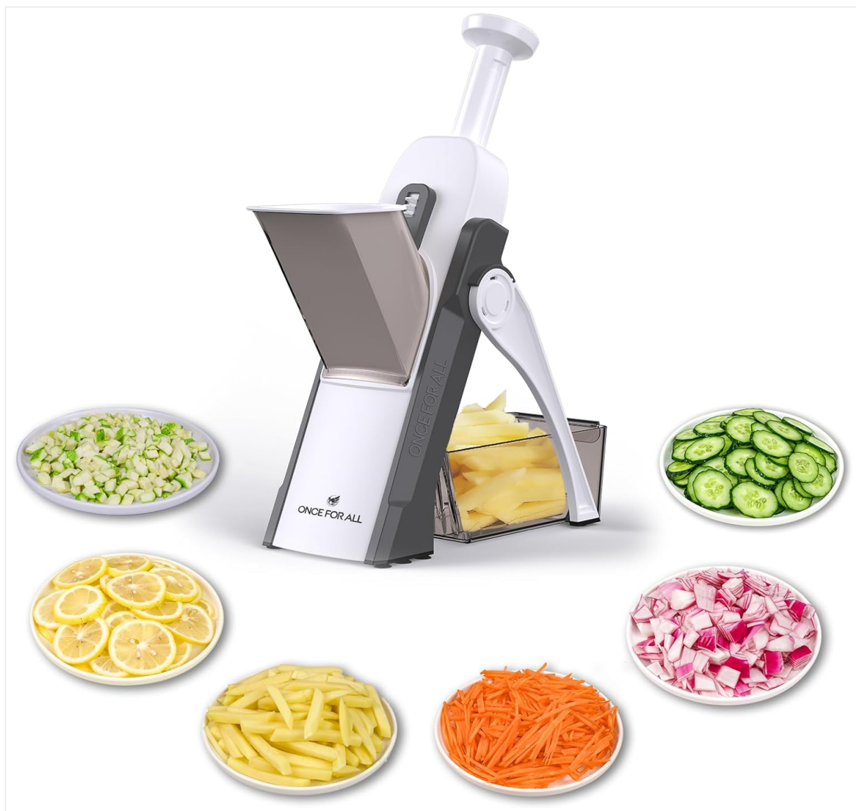
Image 1.1: The ONCE FOR ALL Safe Mandoline Slicer with examples of its cutting capabilities.