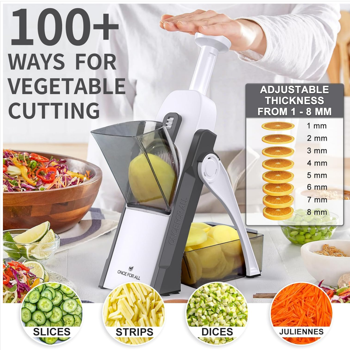
Image 5.2: The mandoline slicer set up to produce different cuts, including slices, strips, dices, and juliennes.