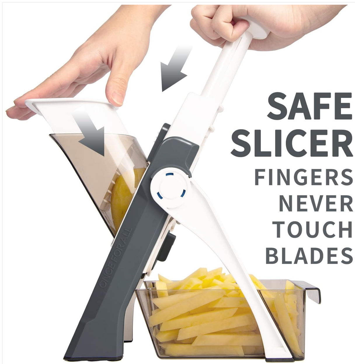
Image 2.1: Demonstrating safe operation with the food pusher, ensuring fingers do not touch blades.