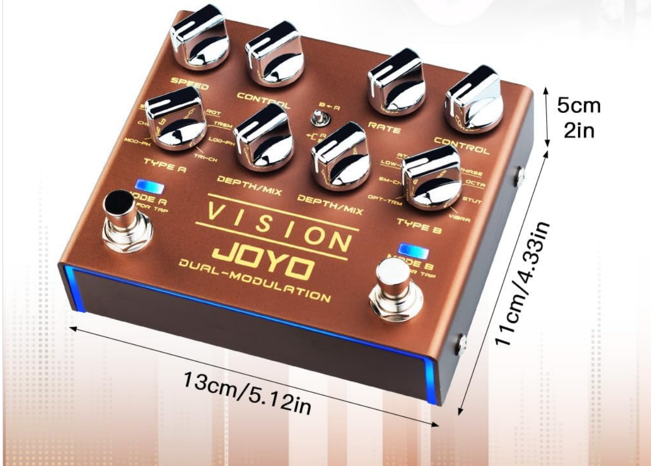
Figure 6: Physical dimensions and key specifications of the JOYO Vision R-09 pedal.