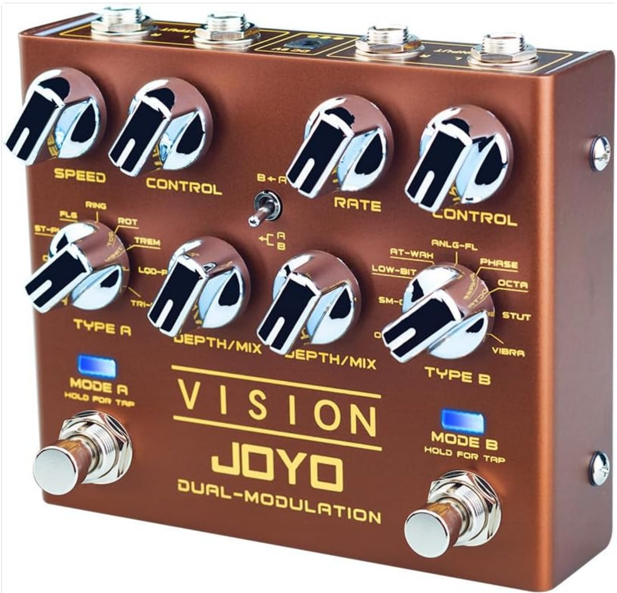
Figure 3: Overview of the JOYO Vision R-09 pedal controls.

The JOYO Vision R-09 features two independent modulation channels, Mode A and Mode B, each with its own set of effects and controls. The pedal's intuitive layout allows for easy adjustment of various parameters to achieve desired tones.