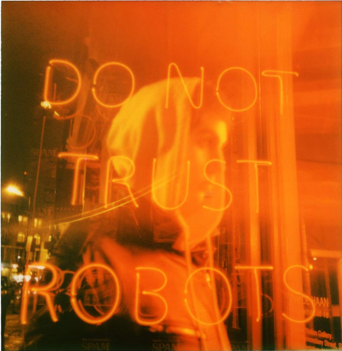
Image: An example of an instant photo produced by the camera, featuring neon text overlaid on a person, demonstrating the camera's output quality.