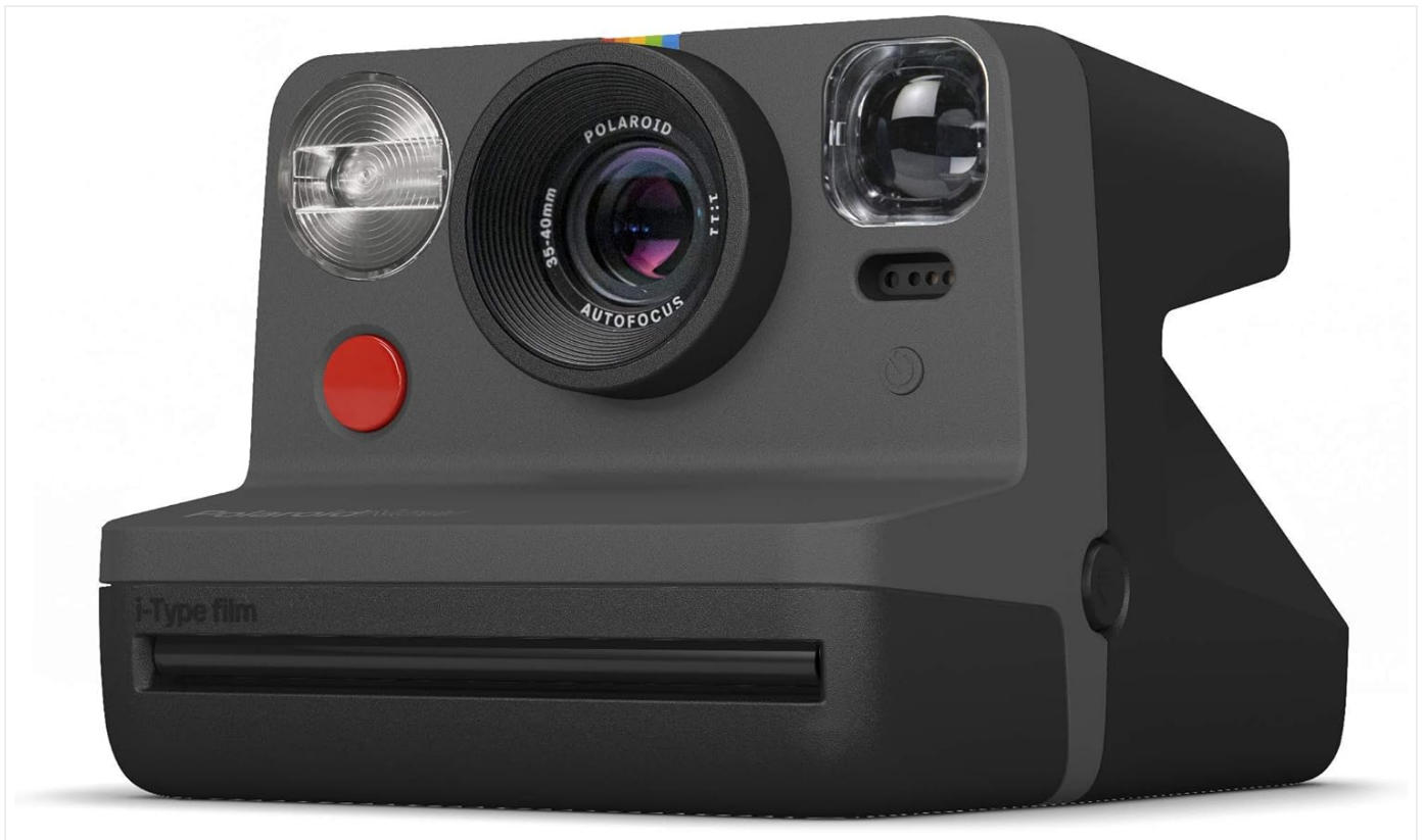
Image: A detailed view of the Polaroid Now camera, highlighting its lens, flash, and autofocus mechanism.