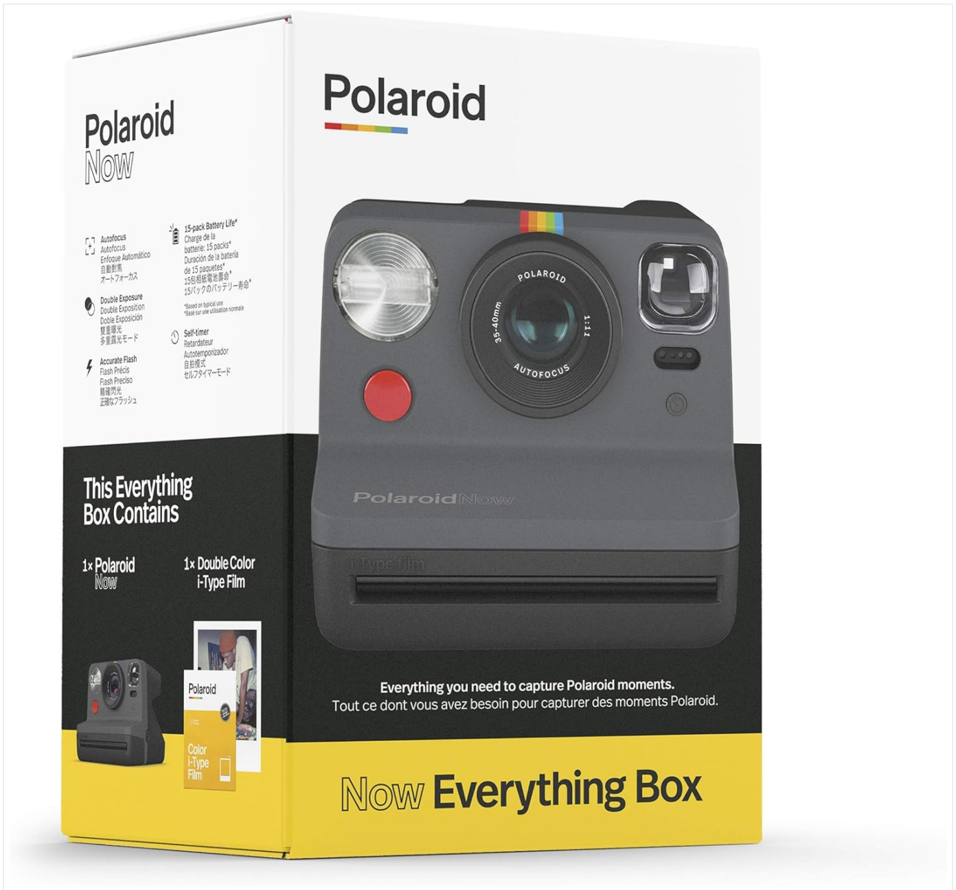
Image: The Polaroid Now camera shown alongside its packaging and a film box, illustrating the product and its components.