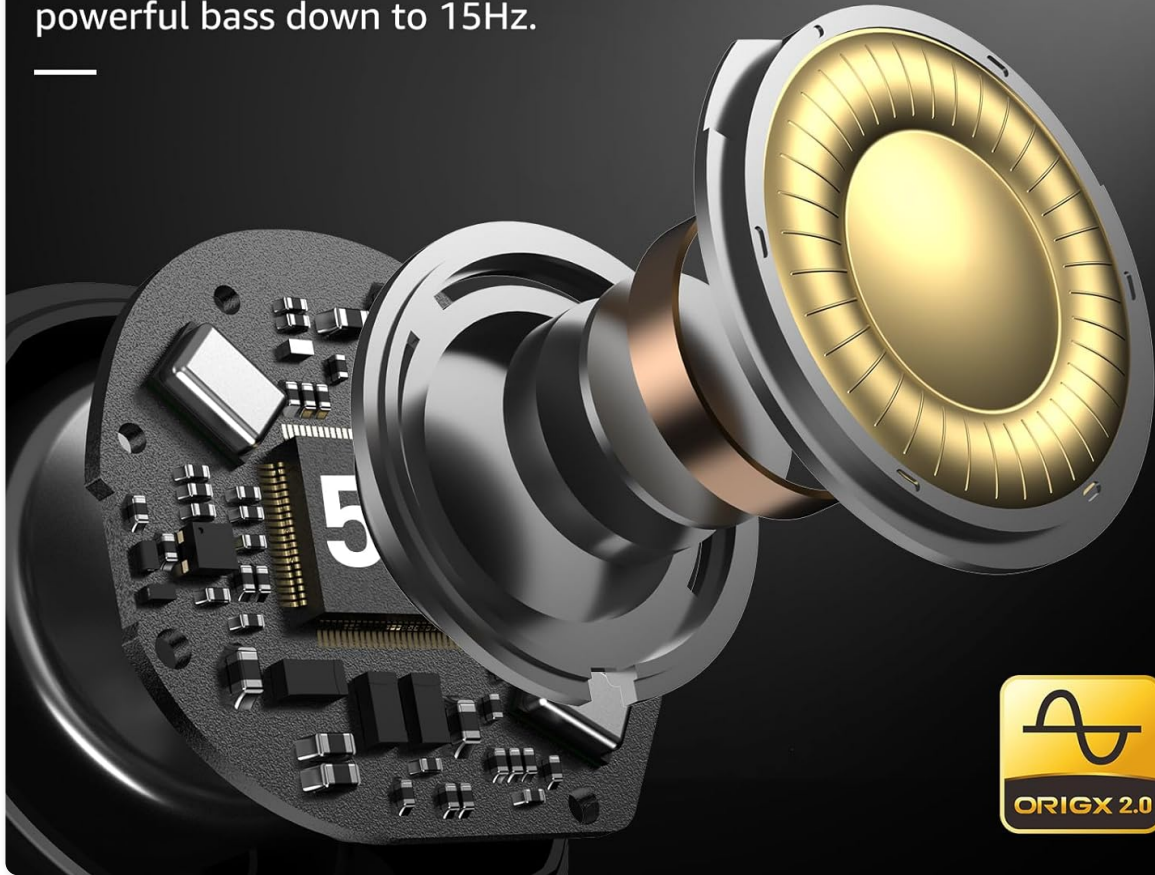
Figure 3.2: TOZO OrigX Acoustics Technology for enhanced sound.

Experience sound that stays true to its natural form with TOZO OrigX Acoustics Technology, delivering powerful bass down to 15Hz.