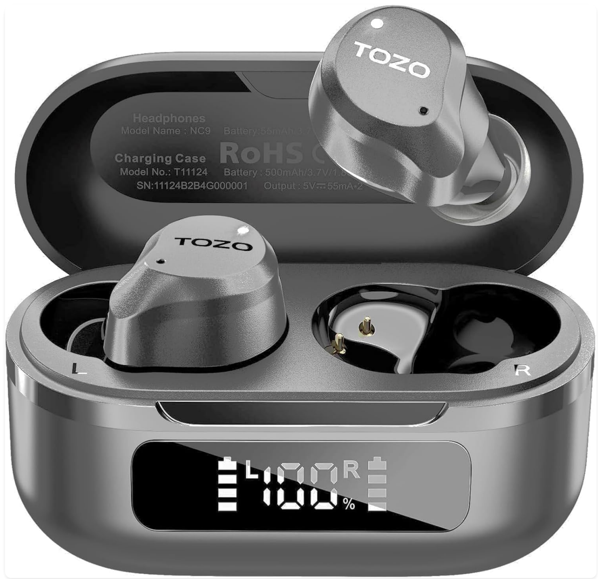
Figure 3.1: TOZO NC9 Earbuds and Charging Case.