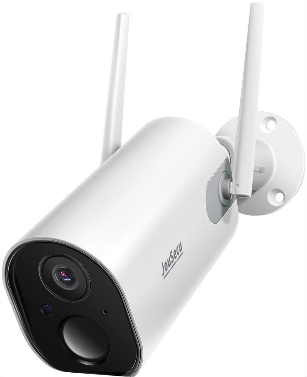
Figure 1: JouSecu 1080P Wireless Battery Operated Outdoor Security Camera.