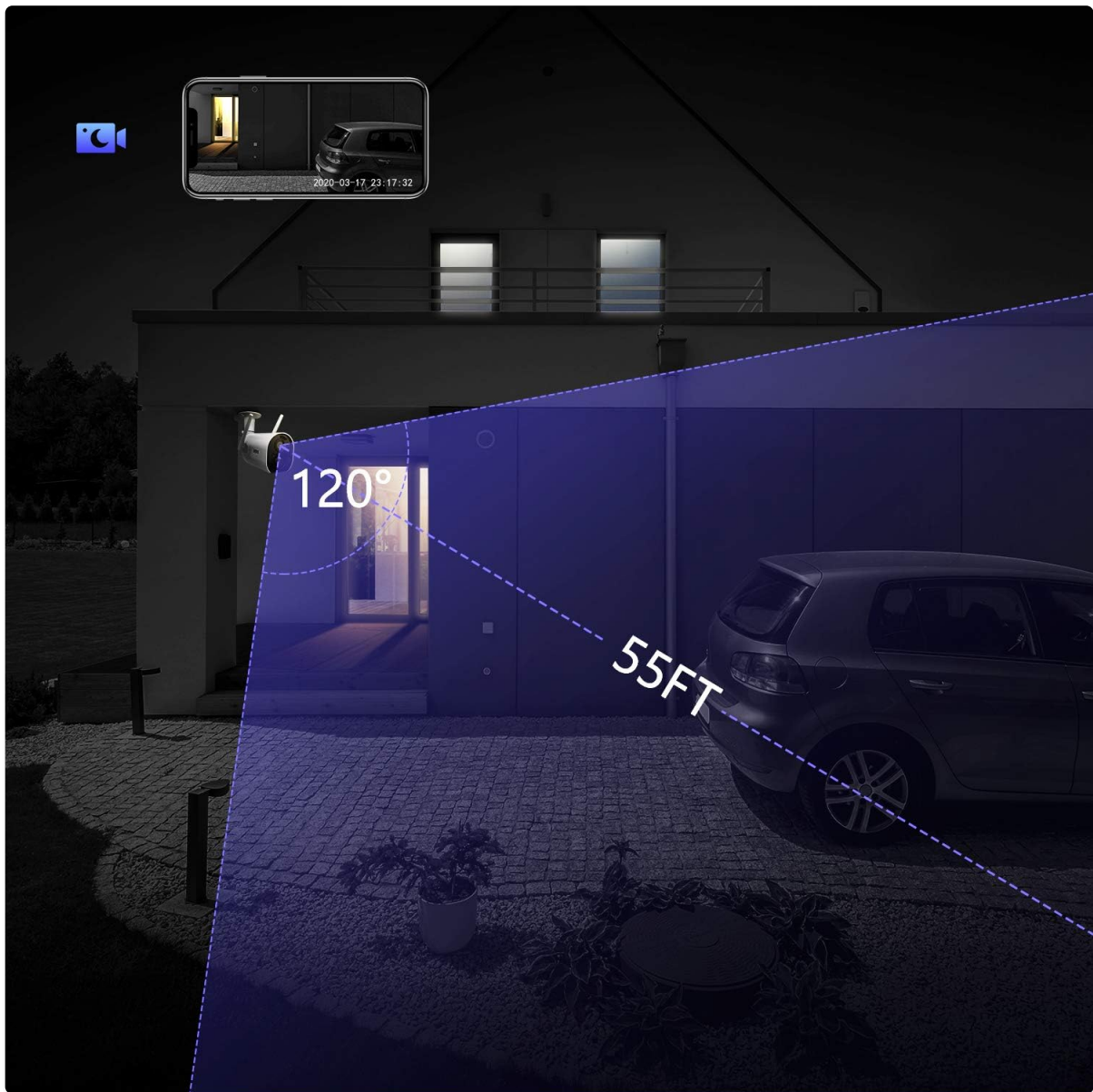
Figure 5: Night Vision Capability.