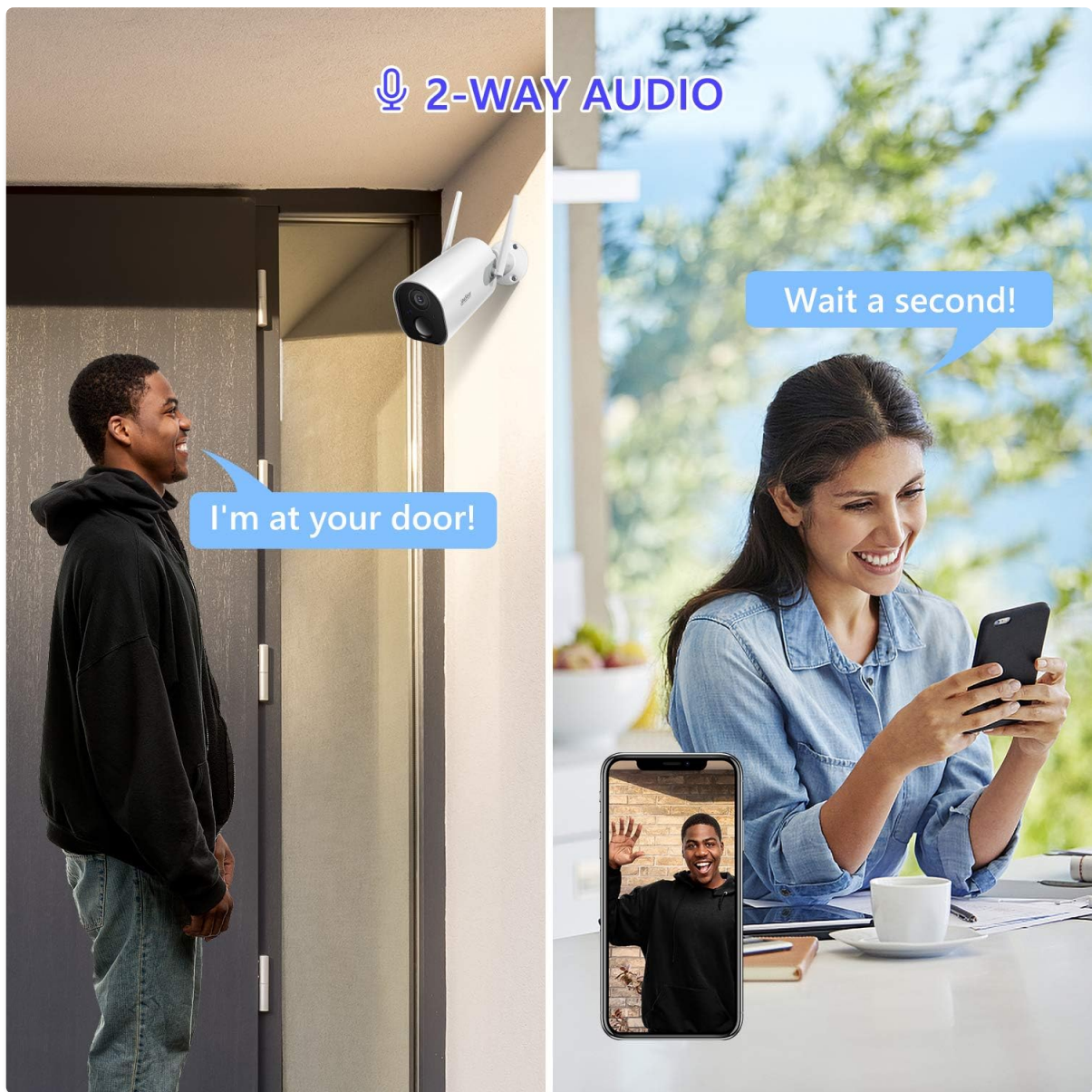
Figure 3: Demonstrating 2-Way Audio Communication.