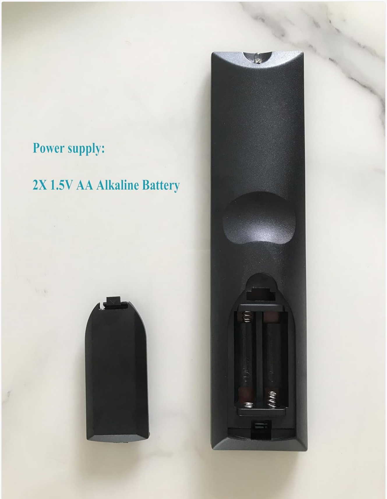
Figure 2.1: Rear view of the remote control with the battery cover removed, illustrating the battery insertion process. It indicates the need for 2x 1.5V AA Alkaline Batteries.