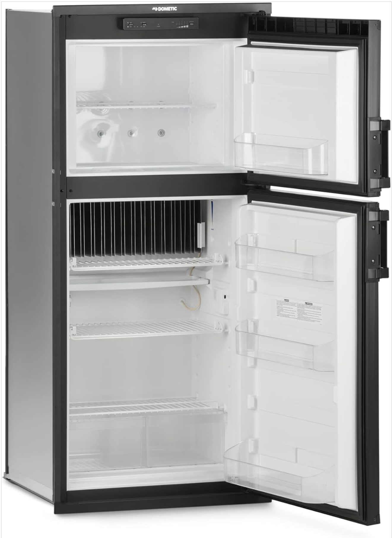
Figure 4.1: Interior view of the refrigerator, highlighting the spacious shelves and adjustable door bins.