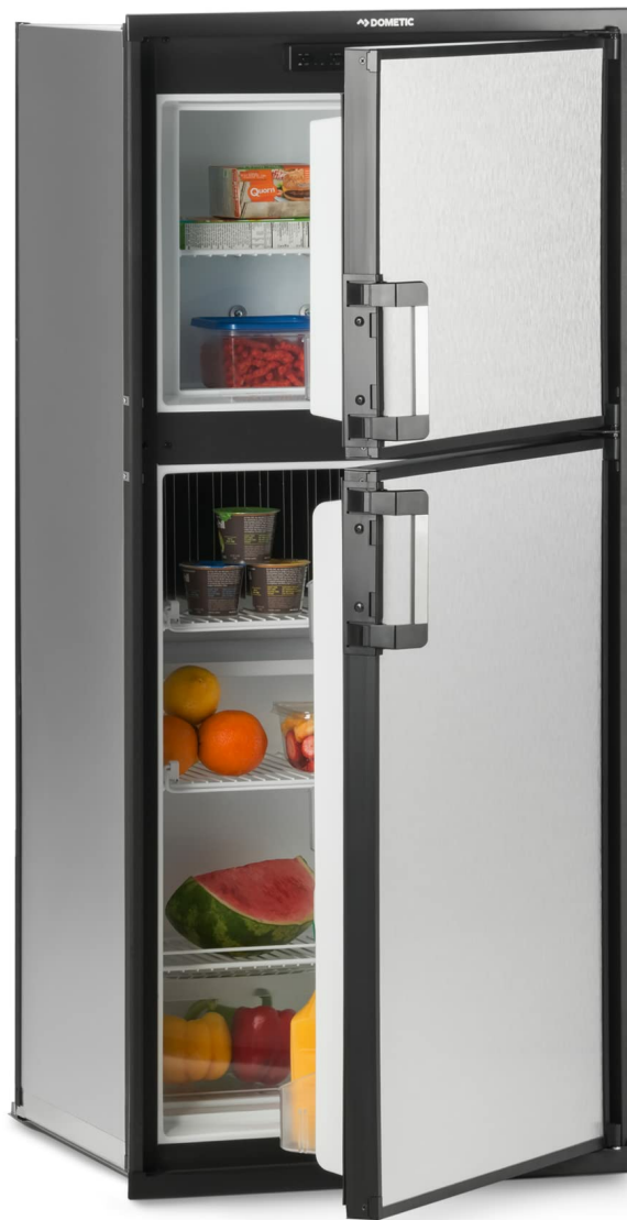
Figure 1.1: Front view of the Dometic Americana II Plus Refrigerator.