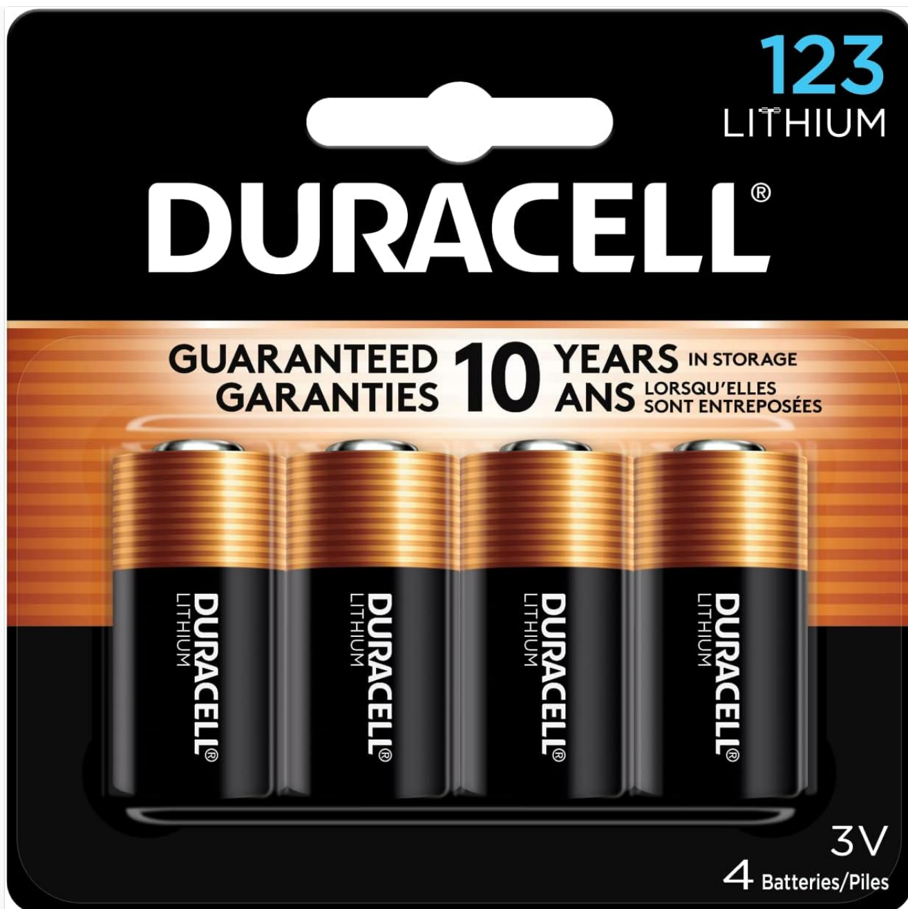
Duracell CR123A 3V Lithium Batteries in a 4-count package.