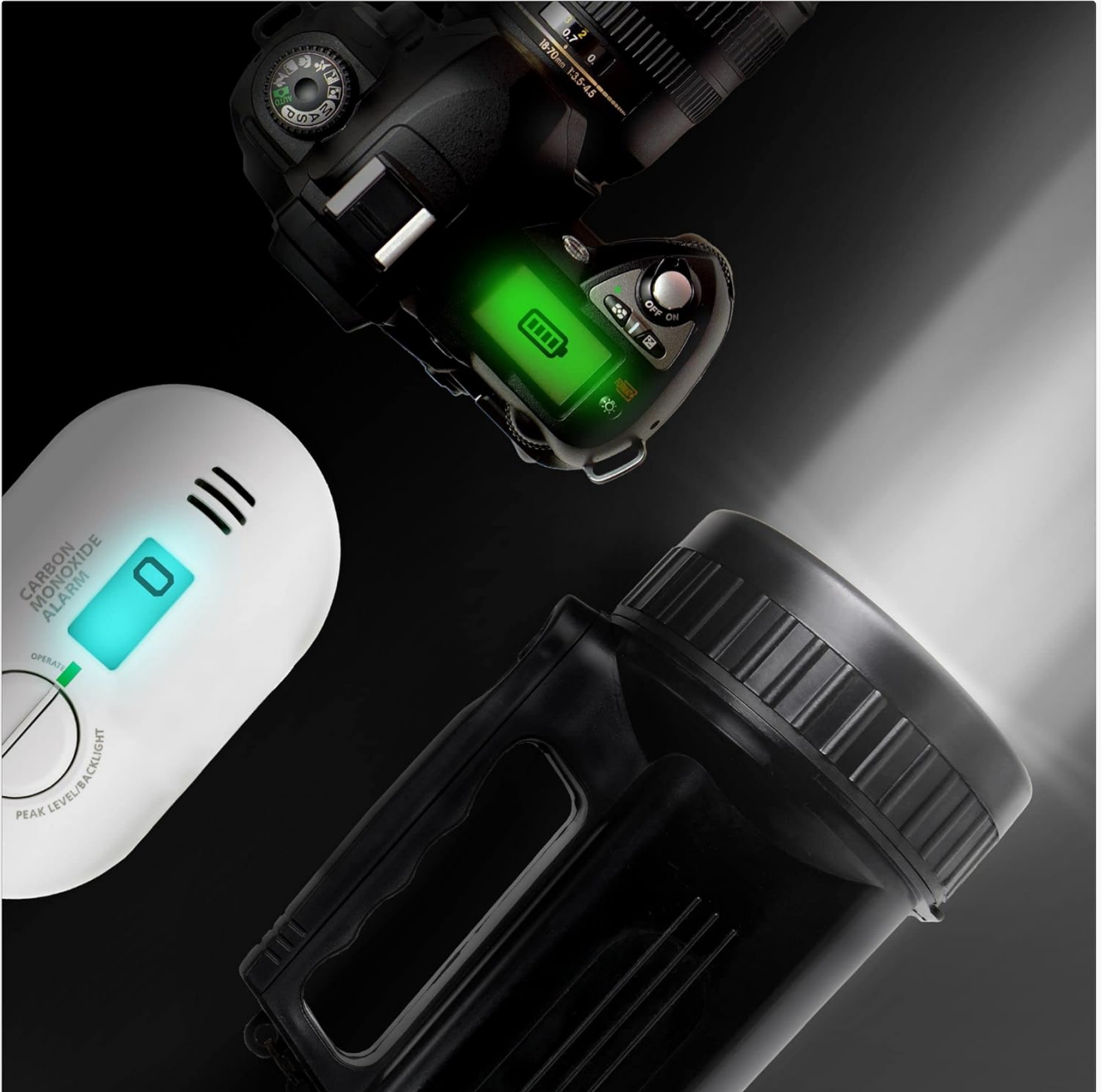
Image: Examples of devices powered by CR123A batteries, including security cameras, flashlights, and smart home devices.

Duracell CR123A batteries are designed for immediate use upon installation. Once correctly inserted into a compatible device, the device should power on and operate as intended. These batteries provide a stable 3V output, suitable for high-drain devices requiring consistent power.