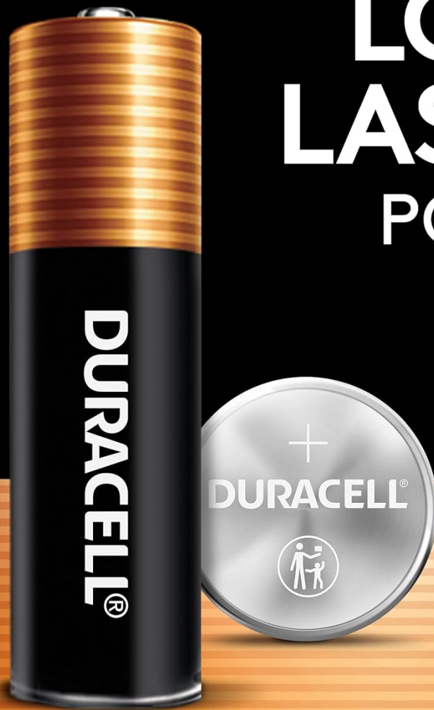
Image: Duracell CR123A battery highlighting its long-lasting power capability.