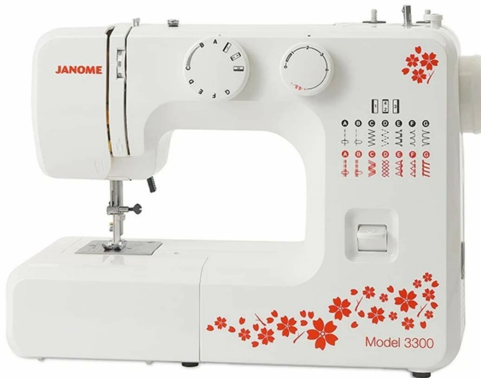
Image: Front view of the Janome 3300 Sewing Machine, showing the needle area, stitch selector, and tension dial.