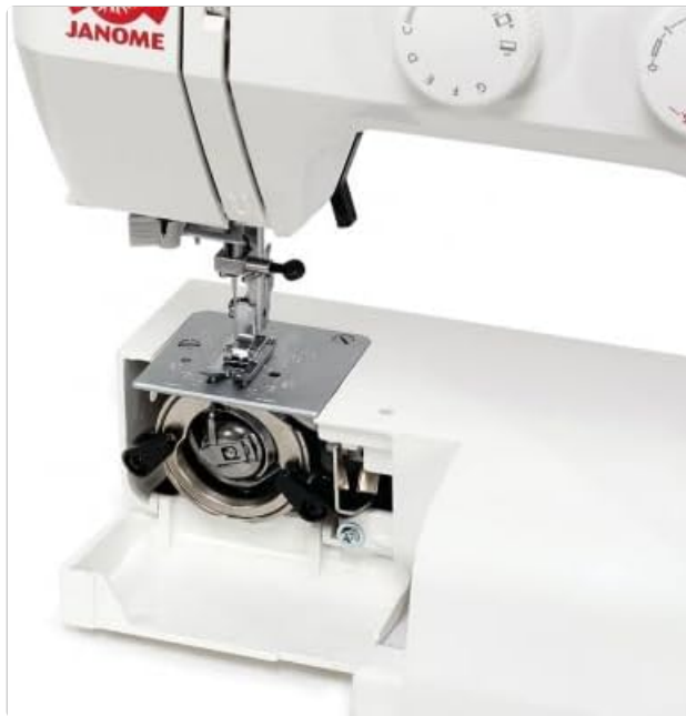
Image: Close-up view of the bobbin area of the Janome 3300 Sewing Machine, showing the bobbin case and thread path.