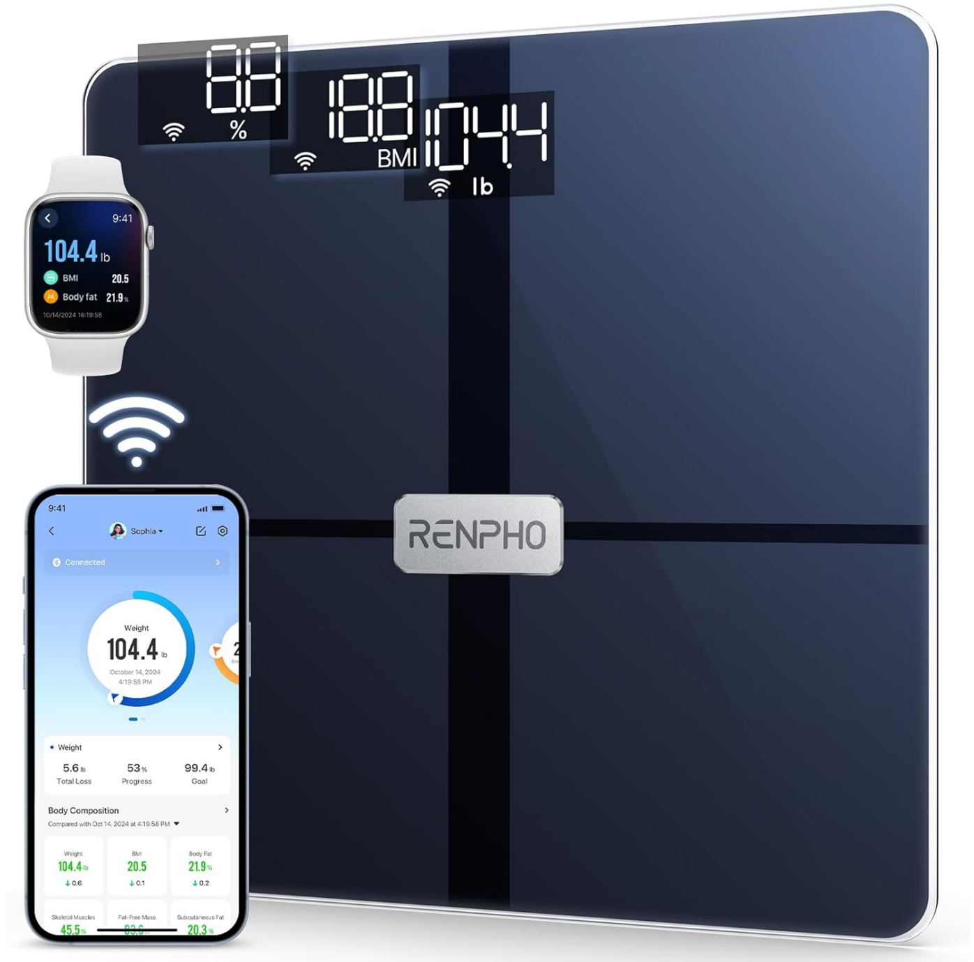
Figure 3: Scale Display and App Synchronization.

Place the scale on a hard, flat surface. Step onto the scale barefoot and stand still. The display will show your weight, BMI, and body fat percentage. Your data will automatically sync to the Renpho Health app via Wi-Fi or Bluetooth.