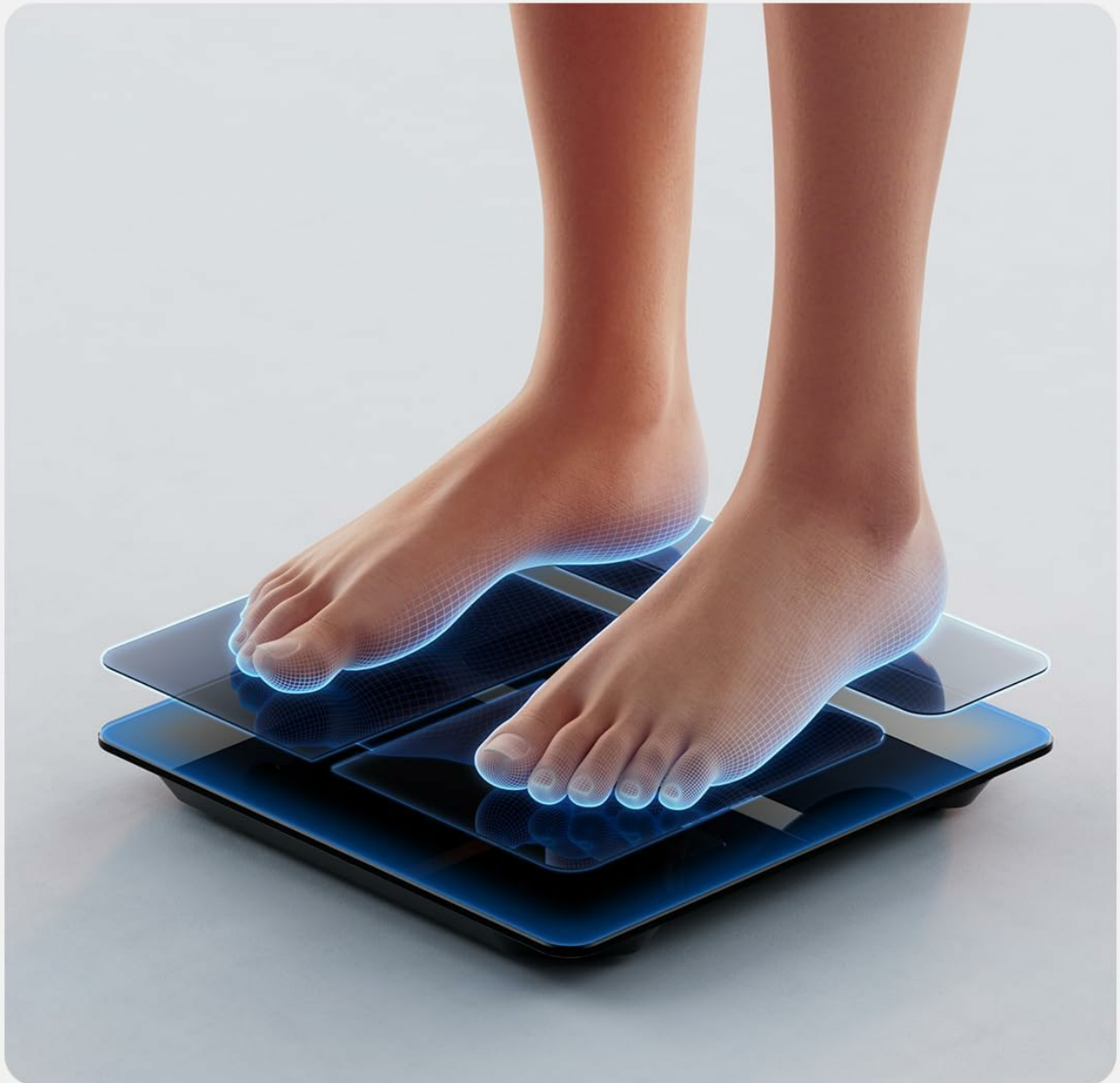
Figure 4: ITO Coating Technology for Accurate Readings.

ITO coating technology for accurate measurements wherever you step